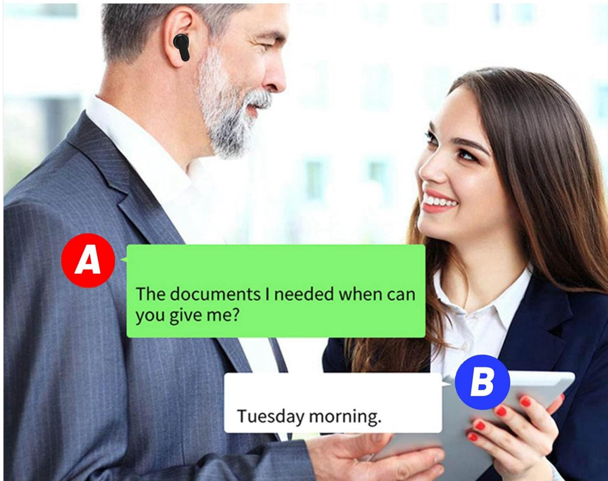
Image 3.1: Illustration of two individuals engaging in real-time translated conversation using the earbuds and a smartphone.

AND SAY WHAT YOU WANT TO EXPRESS CAN BE TRANSLATED.