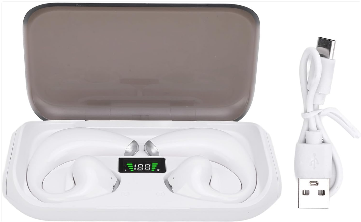
Image 2.1: The earbuds inside the charging case, connected to a USB charging cable.