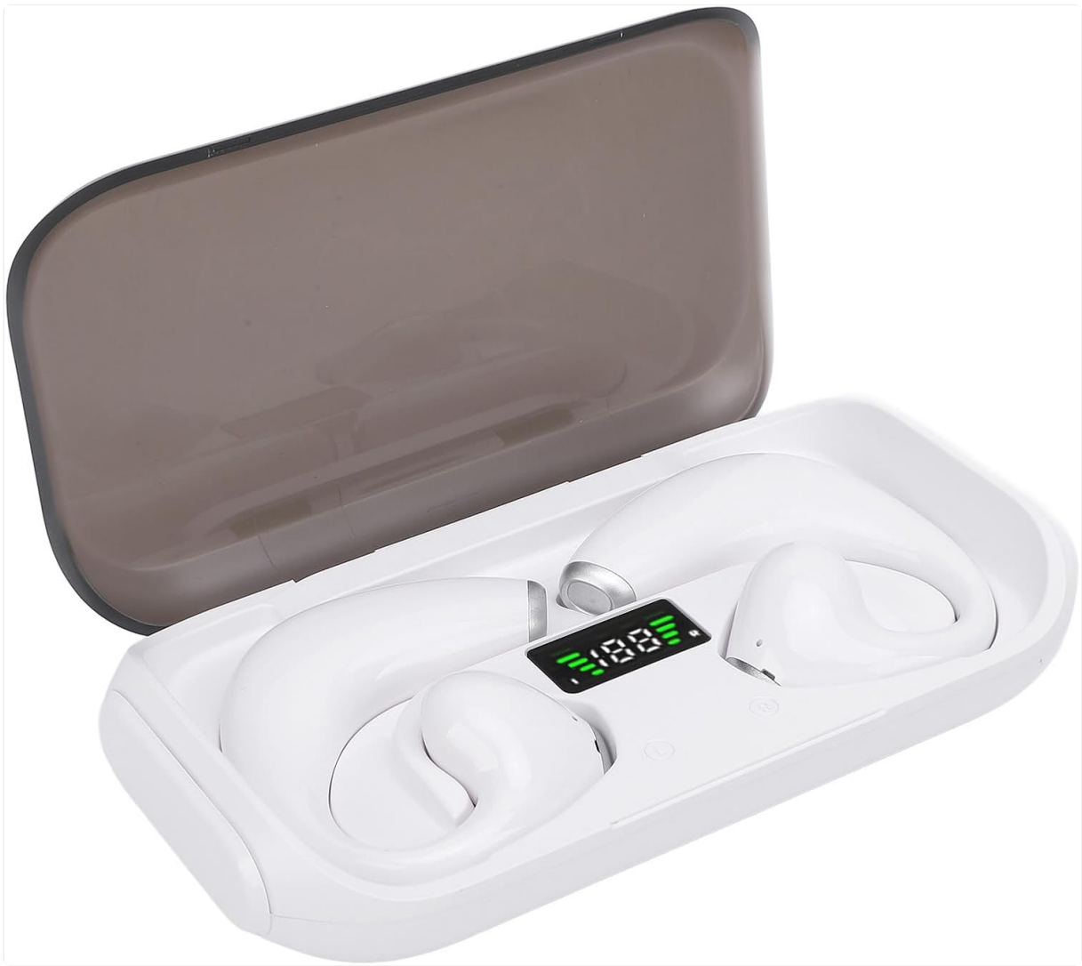
Image 1.1: Jiawu JR04 Language Translation Earbuds in their charging case, displaying a digital battery indicator.