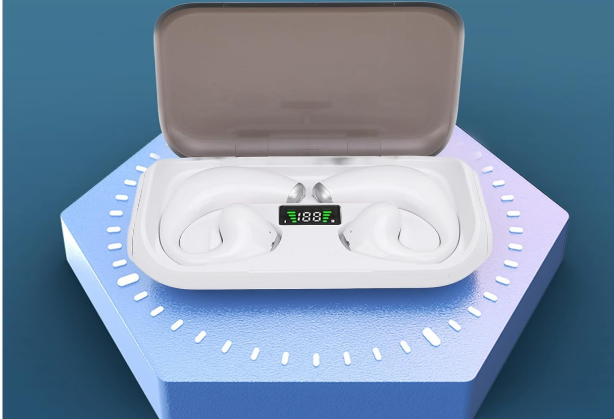
Image 4.1: The earbuds securely placed in their charging case, highlighting the battery status display.

Paired with a charging compartment, it can be used continuously for a day, fully charged for only 1 hour, and enjoy continuous translation/music.