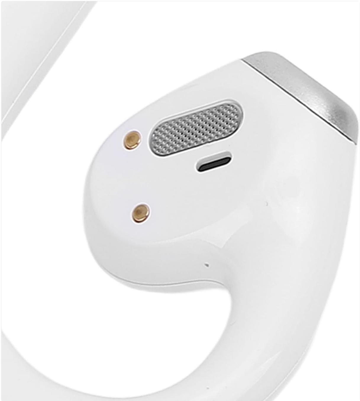
Image 3.3: A detailed view of the touch-sensitive area and microphone on one of the earbuds.