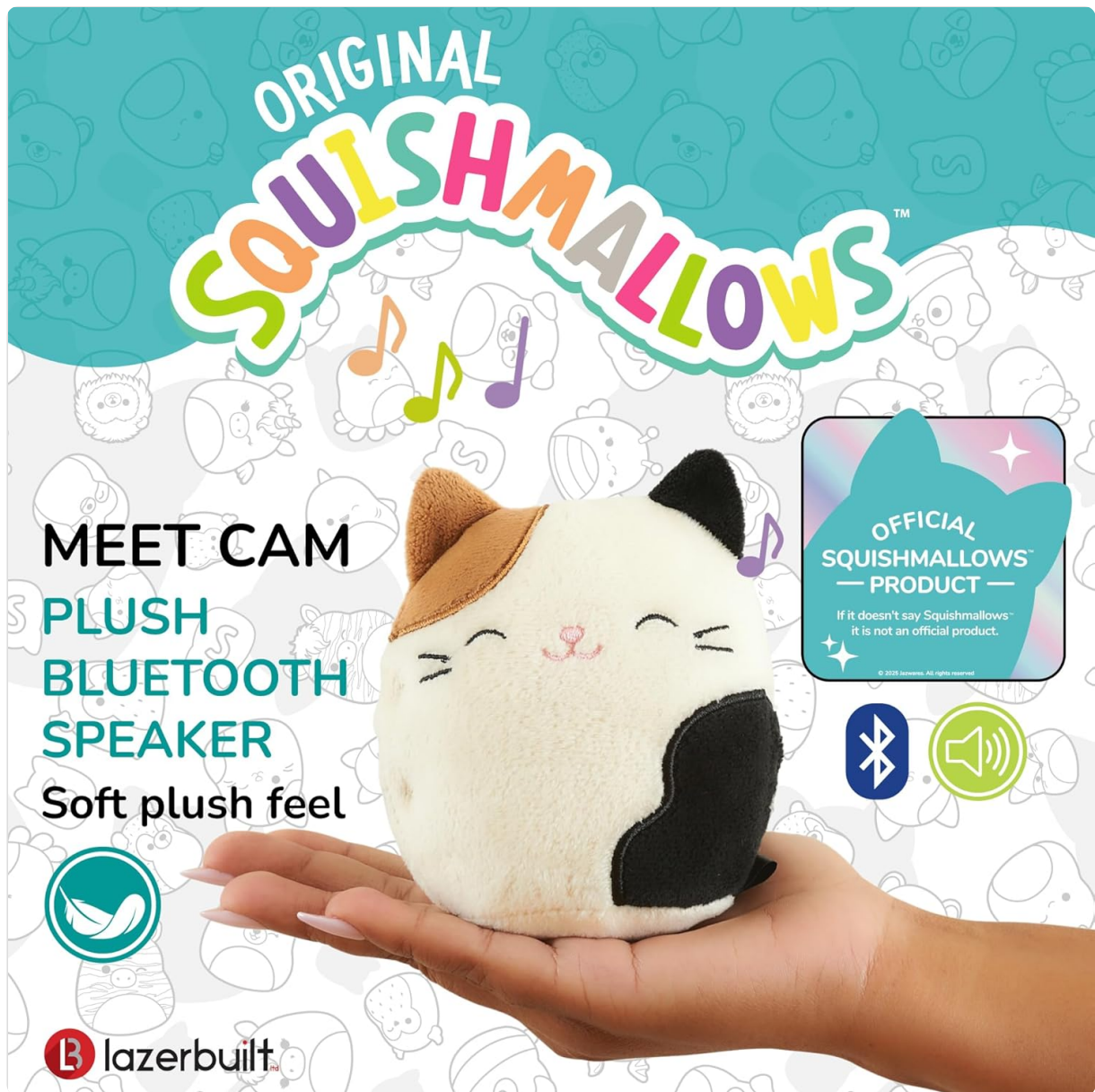
Image: Front view of the Squishmallows Cam The Cat Plush Portable Speaker, showcasing its soft, cat-shaped design.