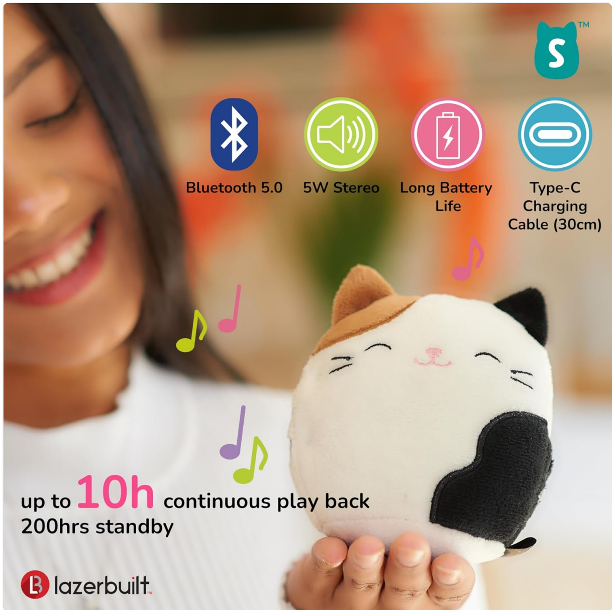
Image: The Squishmallows Cam The Cat speaker shown with its USB Type-C charging cable and 3.5mm audio cable.