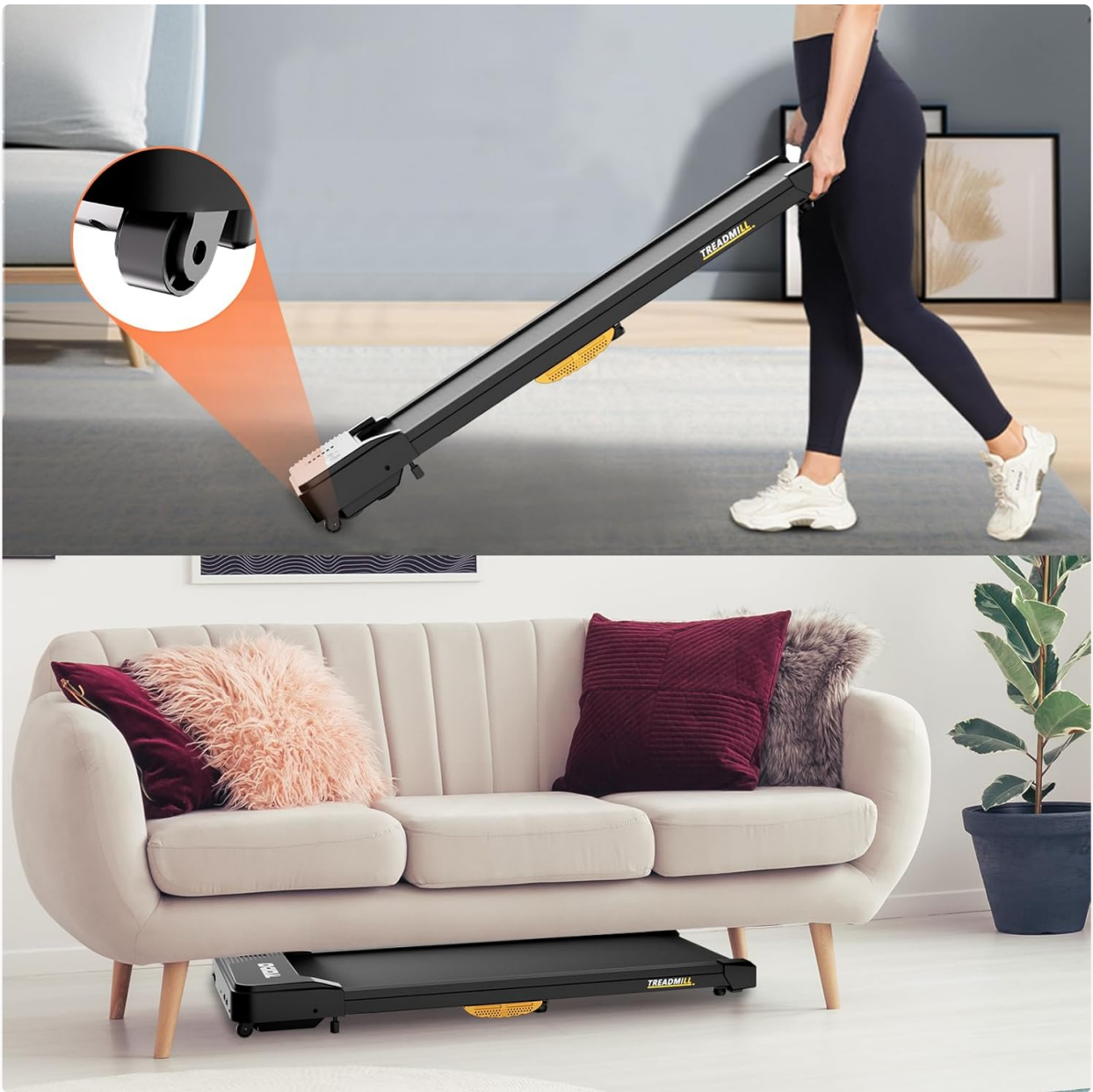
This image demonstrates the treadmill's compact design and portability, showing how it can be easily stored under furniture and moved using its integrated wheels.