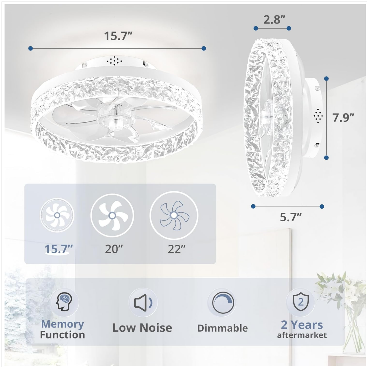
Image: Detailed dimensions of the ceiling fan, highlighting its low-profile design.