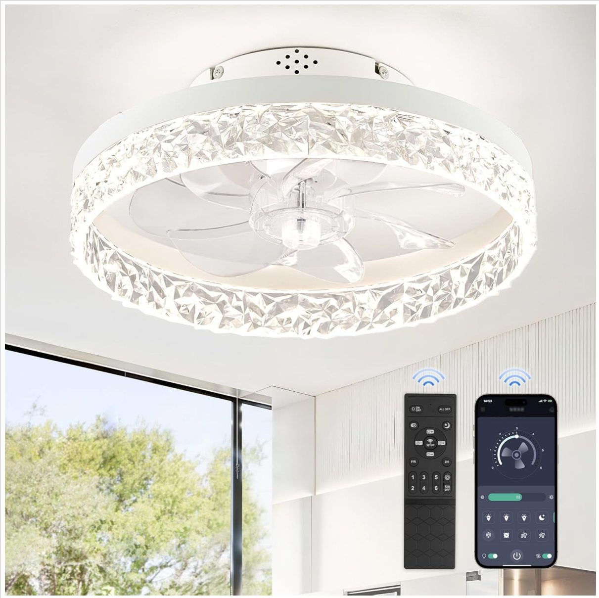
Image: Overview of the LEDIARY 15.7 inch Modern Ceiling Fan, showing the integrated light, fan blades, and included remote control.