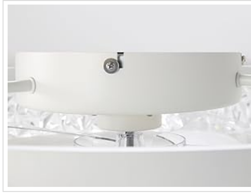
Image: Close-up view of the fan's mounting mechanism, showing how it attaches to the ceiling.