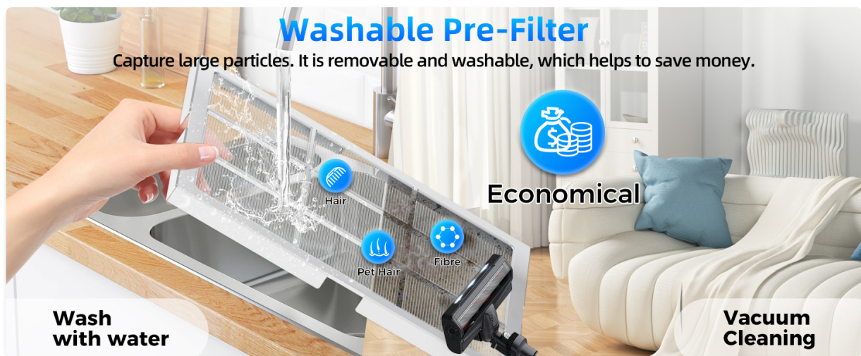
Image: Instructions for cleaning the washable pre-filter by rinsing with water or vacuuming.