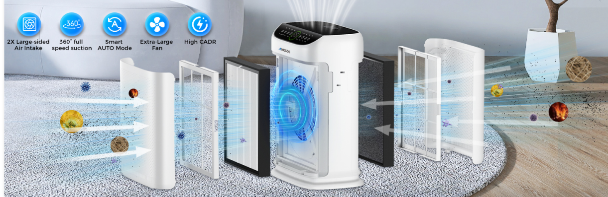
Image: Illustration of the True H13 HEPA filter's effectiveness against various airborne particles.

Purify actively, achieving high efficiency and thoroughness