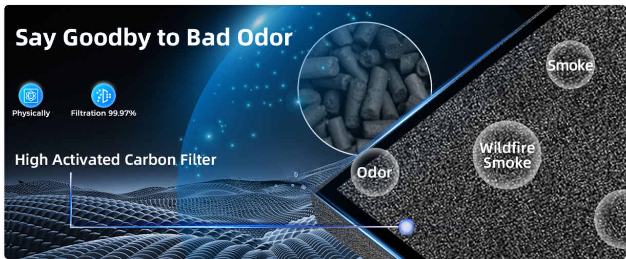
Image: Representation of the high-activated carbon filter's ability to eliminate odors and smoke.