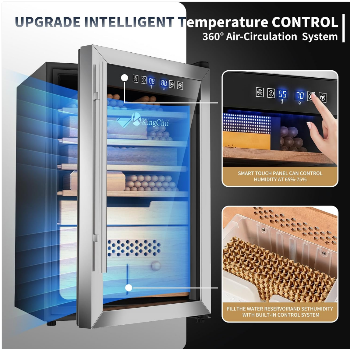
Figure 2: Humidification System. This image highlights the smart touch control panel and the water reservoir for the built-in humidification system.

Seasoning is crucial to prepare the cedar wood for cigar storage. Fill the included moisture container with distilled water. Place the container inside the humidor. Close the humidor door and allow the humidity to stabilize. Monitor the hygrometer in the drawer; the humidity should reach 65% to 78%. This process may take up to 3 days. Once seasoned, you can begin to add your cigars.