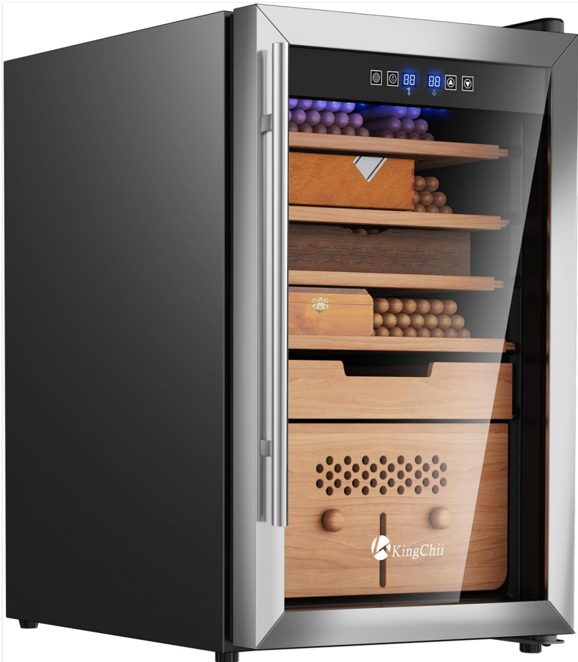
Figure 1: KingChii JCC-70 Electric Cigar Humidor. This image shows the sleek black and stainless steel exterior of

Carefully remove the humidor from its packaging. Place the unit in an open room, ensuring sufficient space around all sides for proper air circulation. Avoid placing it in direct sunlight or near heat sources. Do not build this unit into any type of enclosure like a cabinet, as it relies on ambient air for cooling and heating.