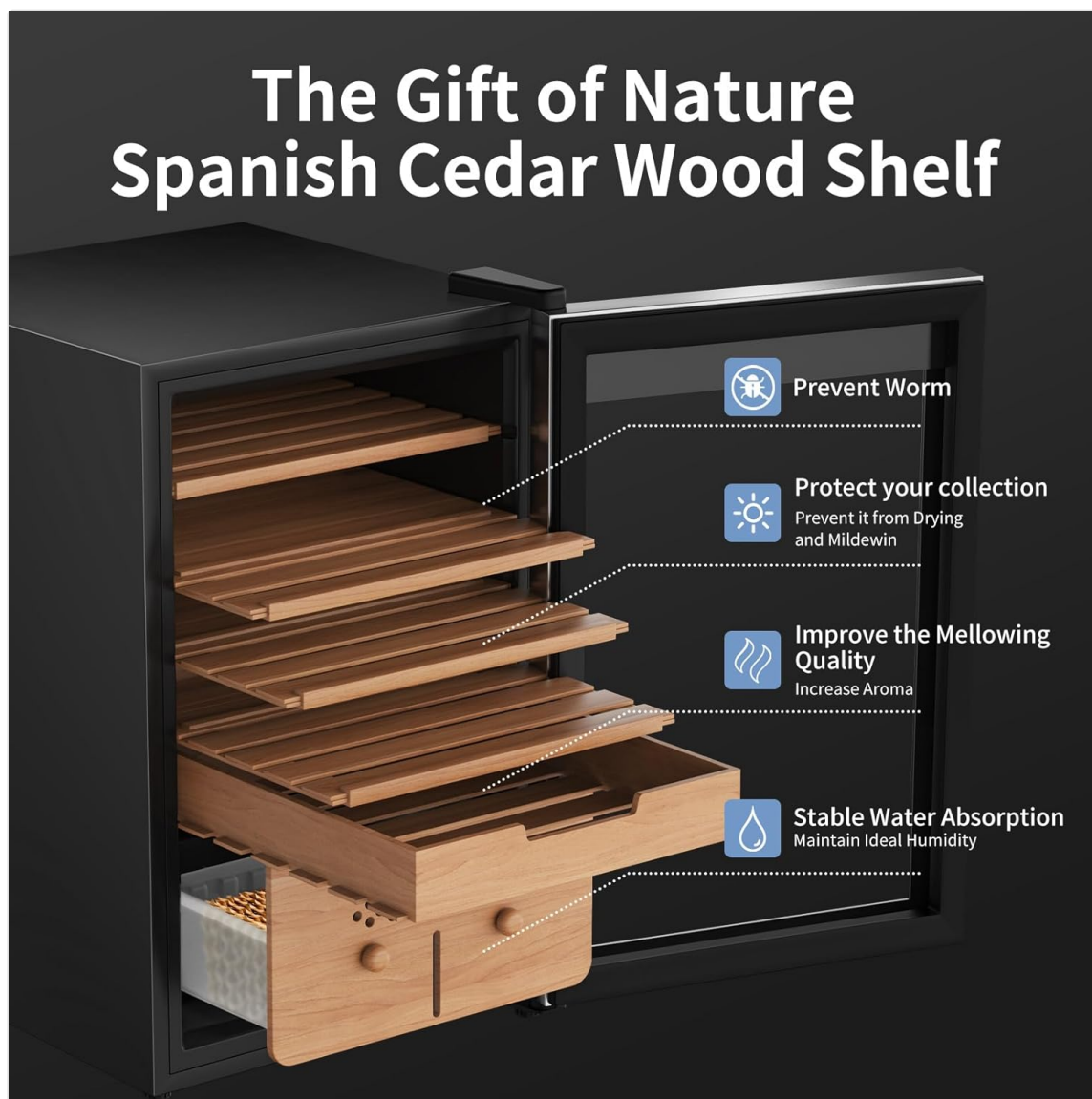
Figure 5: Spanish Cedar Wood Shelves. This image illustrates the Spanish cedar wood shelves and drawer, highlighting their benefits for cigar preservation.

place your cigars on the Spanish cedar wood shelves and in the drawer. The shelves are movable, allowing for flexible storage arrangements.