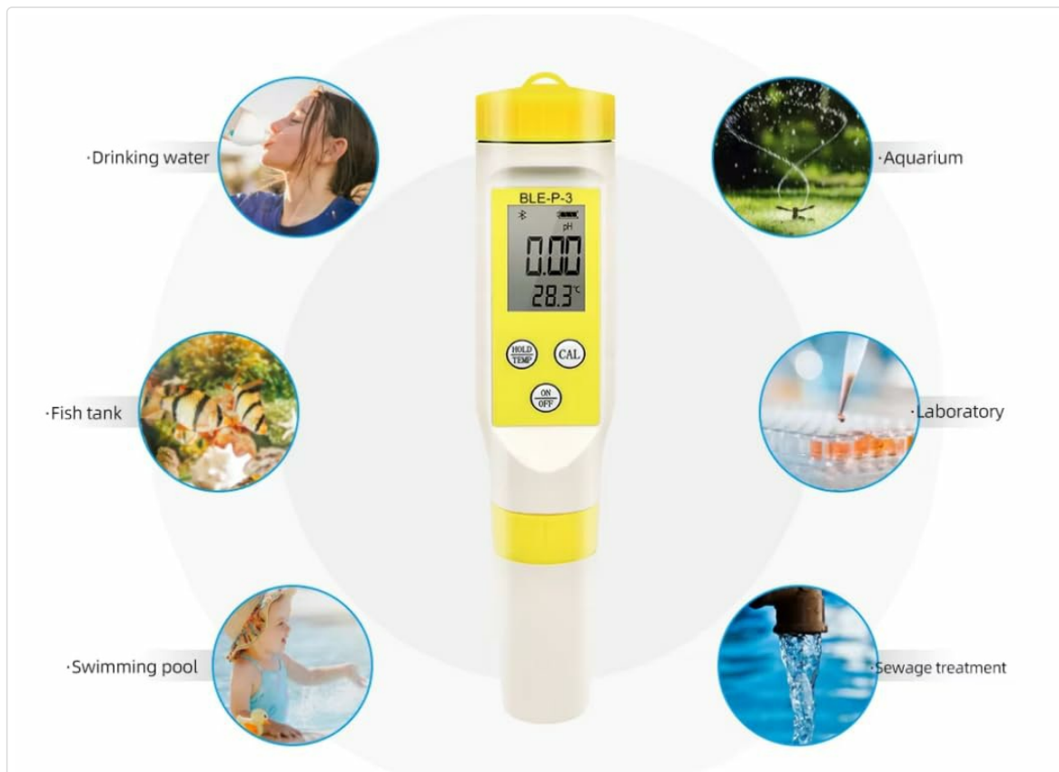
Image 1: The VIHELM BLE-P-3 pH meter surrounded by circular icons depicting various application scenarios: drinking water, aquarium, laboratory, sewage treatment, swimming pool, and fish tank, illustrating its versatility.

The VIHELM BLE-P-3 is a smart digital pH and temperature meter designed for accurate and convenient measurement of pH levels and temperature in various liquids. This device features Bluetooth connectivity, allowing for real-time data viewing, saving, and analysis via a dedicated smartphone application. It is suitable for a wide range of applications including drinking water quality testing, aquariums, fish tanks, swimming pools, laboratory use, and sewage treatment.