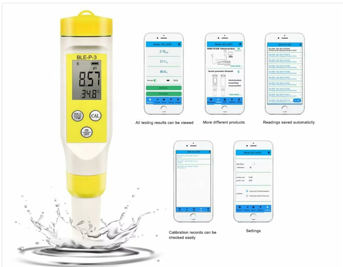
Image 7: The VIHELM BLE-P-3 pH meter shown with multiple smartphone screens illustrating the app's capabilities: viewing all testing results, managing different products, automatically saving readings, checking calibration records, and accessing settings.