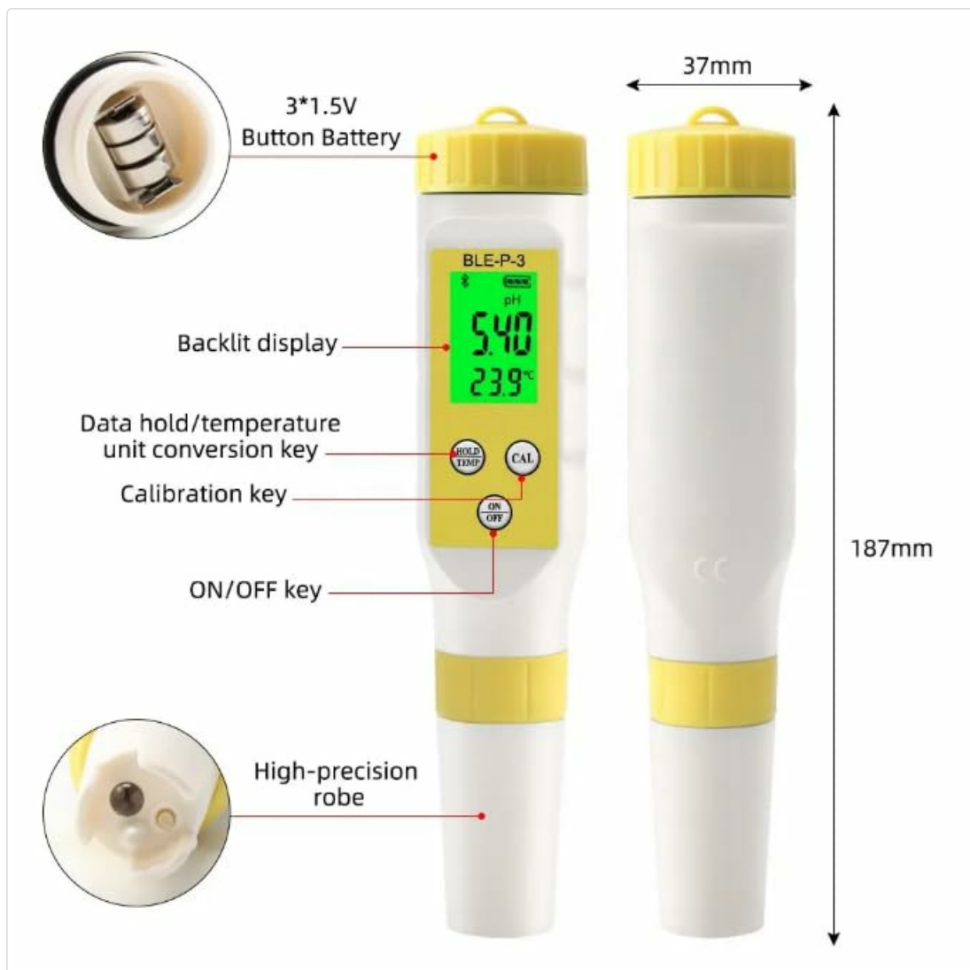
Image 3: A detailed diagram of the VIHELM BLE-P-3 pH Meter, highlighting its components: 3*1.5V button battery compartment, backlit display, data hold/temperature unit conversion key, calibration key, ON/OFF key, and high-precision probe. Dimensions are also provided: 187mm length and 37mm width.