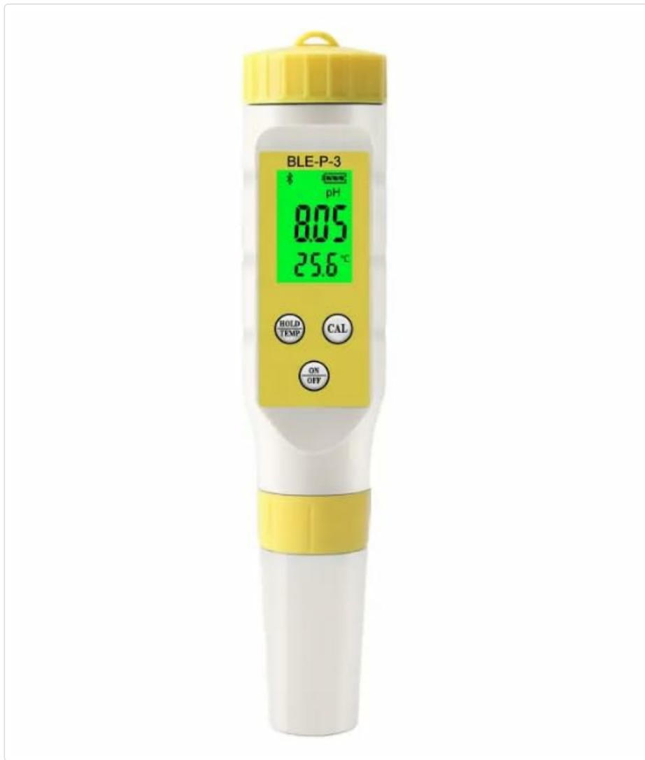
Image 2: A front view of the VIHELM BLE-P-3 Smart Digital pH/Temp Meter, showing its display with pH and temperature readings, and the 'HOLD/TEMP', 'CAL', and 'ON/OFF' buttons.