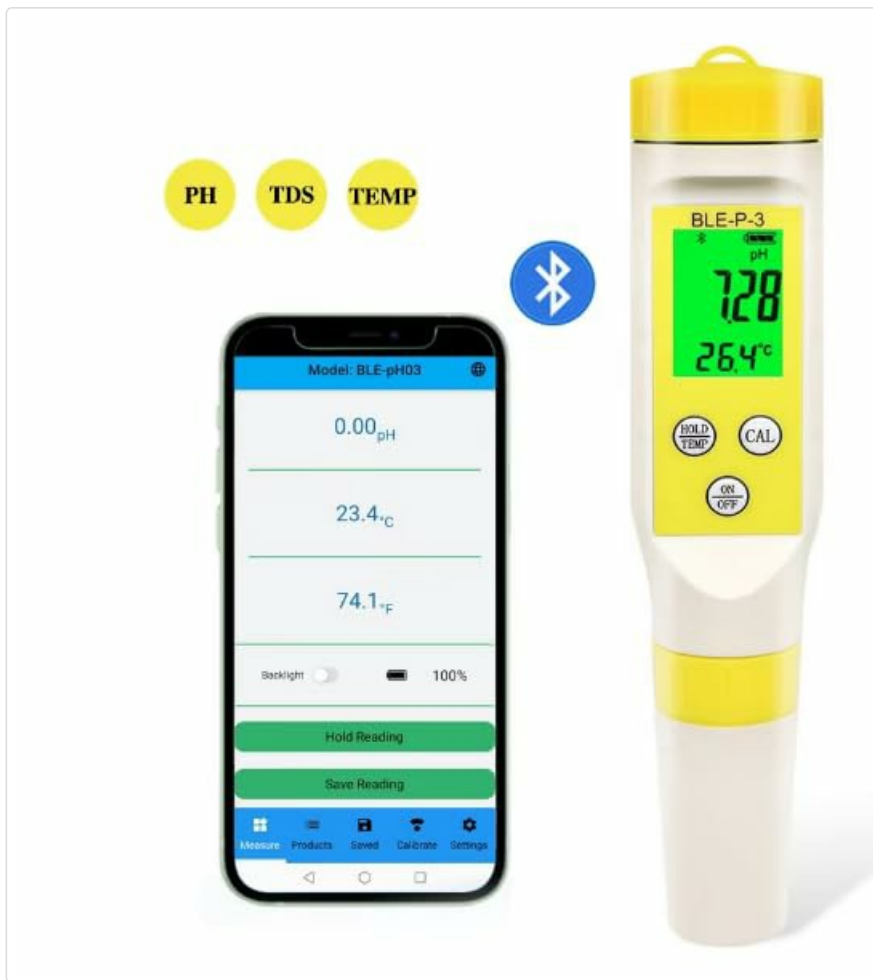
Image 5: The VIHELM BLE-P-3 pH meter displayed alongside a smartphone showing its companion application. The app displays pH and temperature readings, and options for backlight control, holding, and saving readings. Bluetooth icon indicates connectivity.