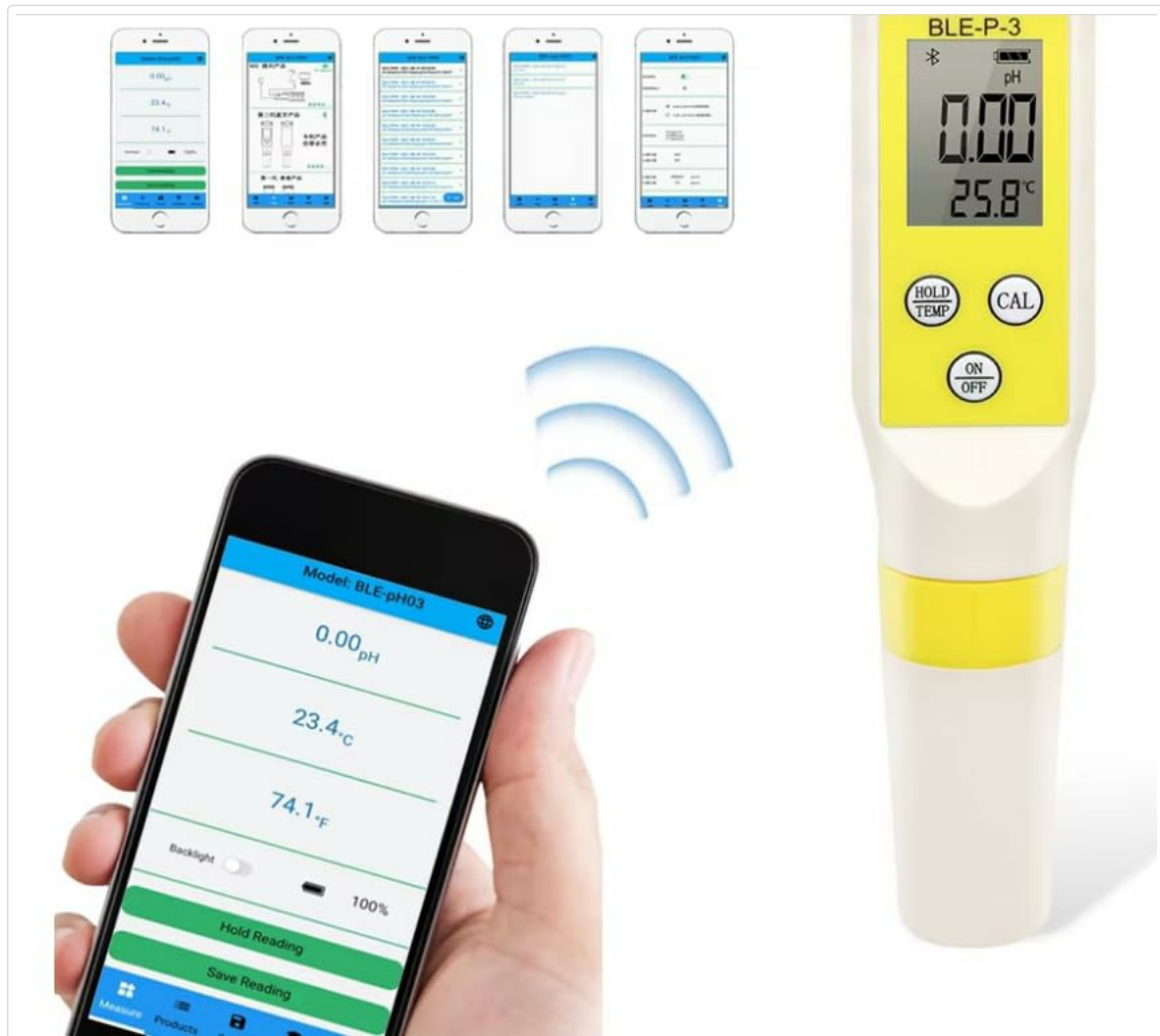
Image 4: The VIHELM BLE-P-3 pH meter displaying a pH reading of 0.00 and temperature of 25.8°C, with a smartphone showing the connected app. A Bluetooth signal graphic indicates wireless communication between the device and the app.