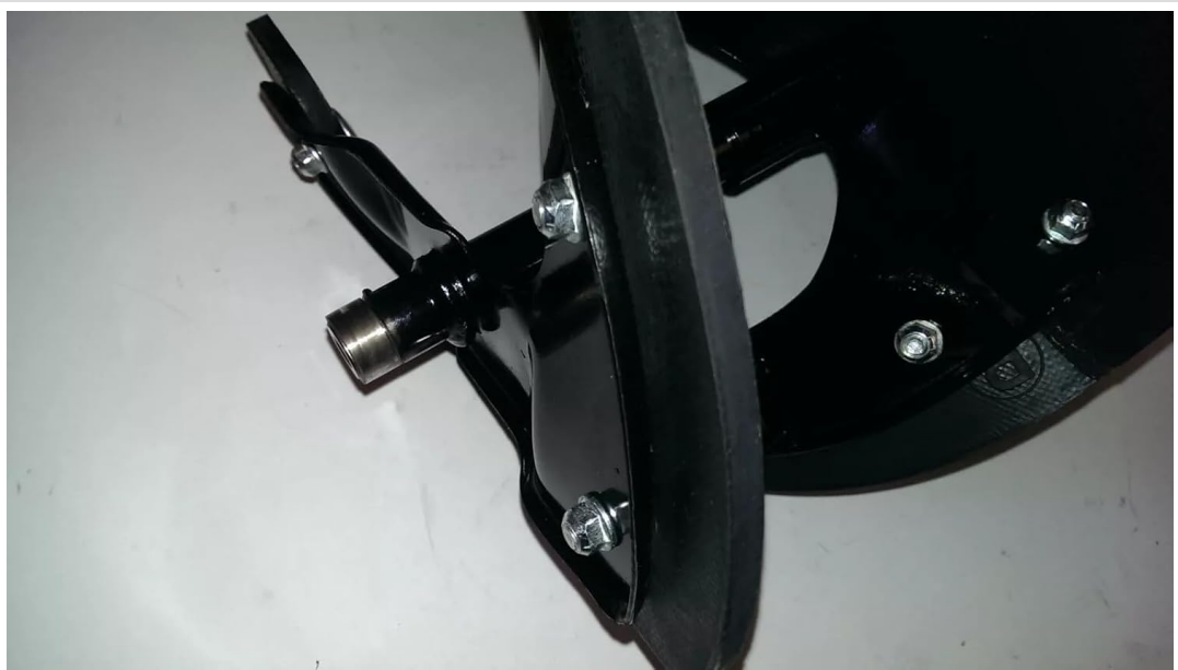
Figure 3: Close-up of the opposite end of the auger shaft, showing its connection point.