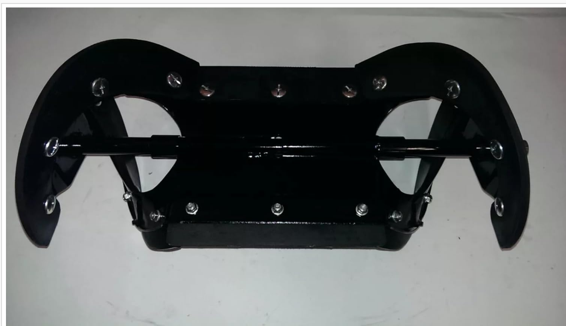
Figure 1: Overall view of the YYBParts replacement auger assembly, showing the main body and shaft.