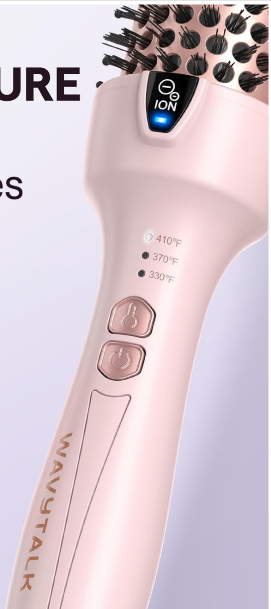
Image: A hand demonstrating how to turn on the Wavytalk Thermal Brush by holding the power button for 3 seconds.