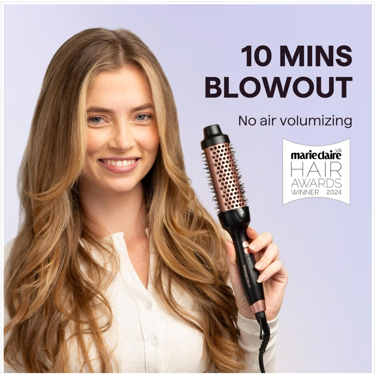
Image: The handle of the Wavytalk Thermal Brush displaying the three temperature settings and power buttons.