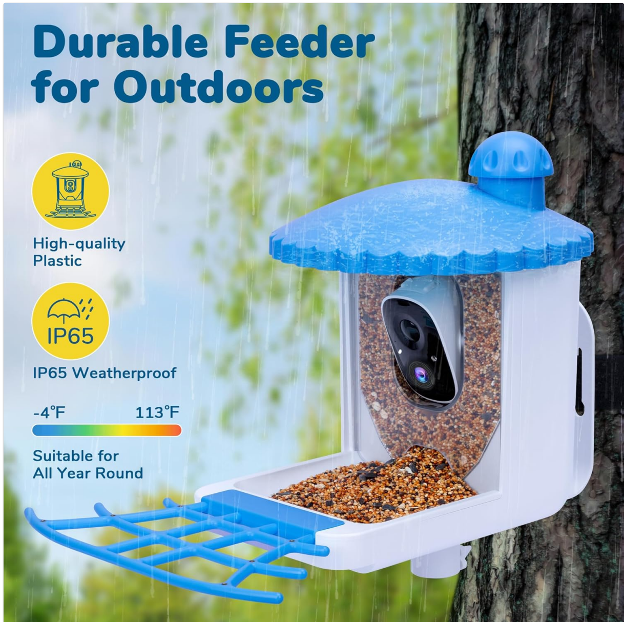
Figure 2.3: The feeder's robust IP65 weatherproof construction ensures reliable outdoor performance in various conditions.

Video 2.1: This video demonstrates the camera's ability to capture various bird species visiting the feeder, highlighting the clear video quality and diverse bird activity.