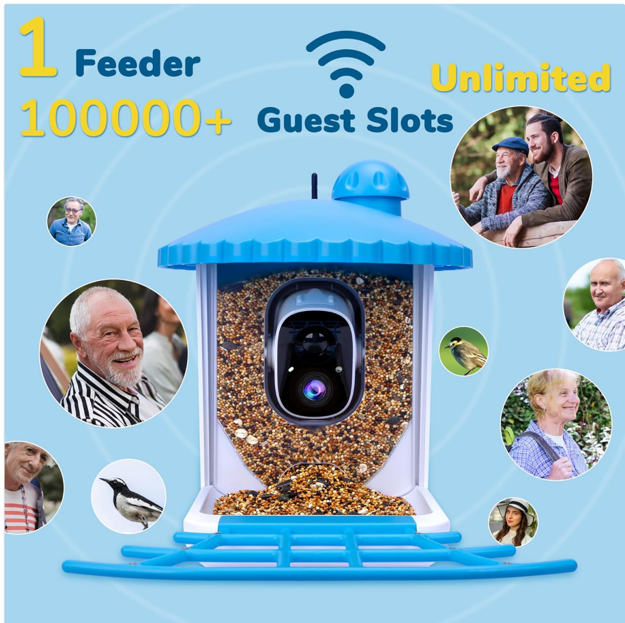
Figure 3.1: The bird feeder can be securely mounted on a tree, pole, or wall to suit your outdoor space.