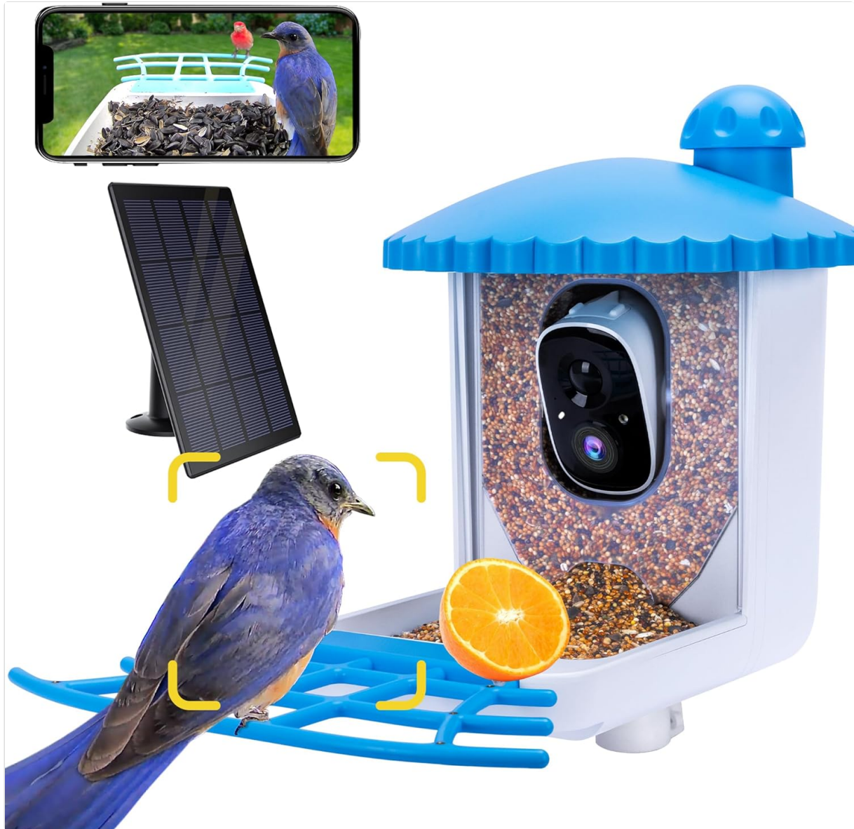
Figure 2.1: The Twesync Bird Feeder with Camera, showcasing its integrated camera, solar panel, and feeding tray.