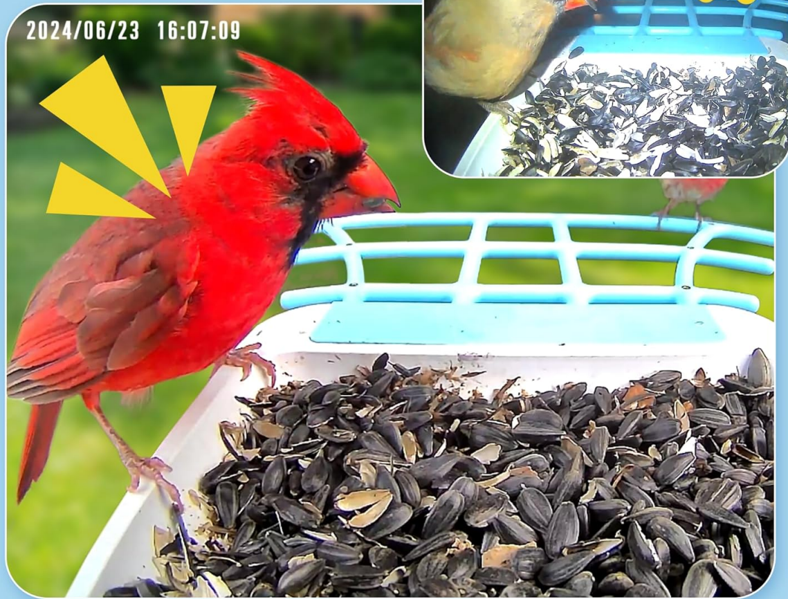
Figure 4.1: Capture clear images and videos of birds during both day and night with the camera's advanced vision capabilities.