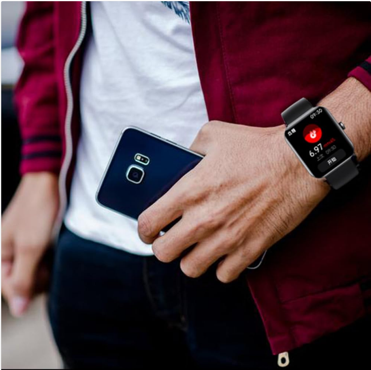
Image: A person wearing the smartwatch on their wrist while holding a smartphone, illustrating the connectivity between the two devices.