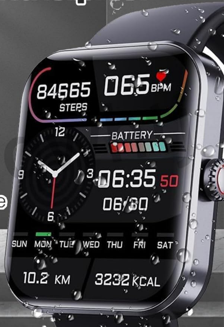
Image: Close-up of the smartwatch screen displaying "IP67 Waterproof" along with icons for "Mass dial," "Notification," and "Sports mode," emphasizing its durability and core functionalities.