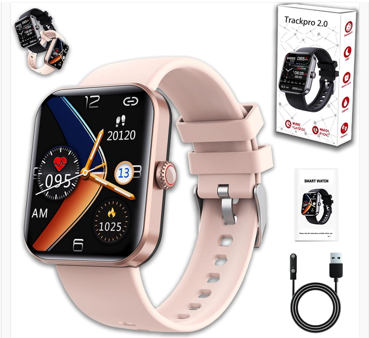
Image: Contents of the Fitsense Trackpro Smartwatch package, including the pink smartwatch, user manual, charging cable, and product box.