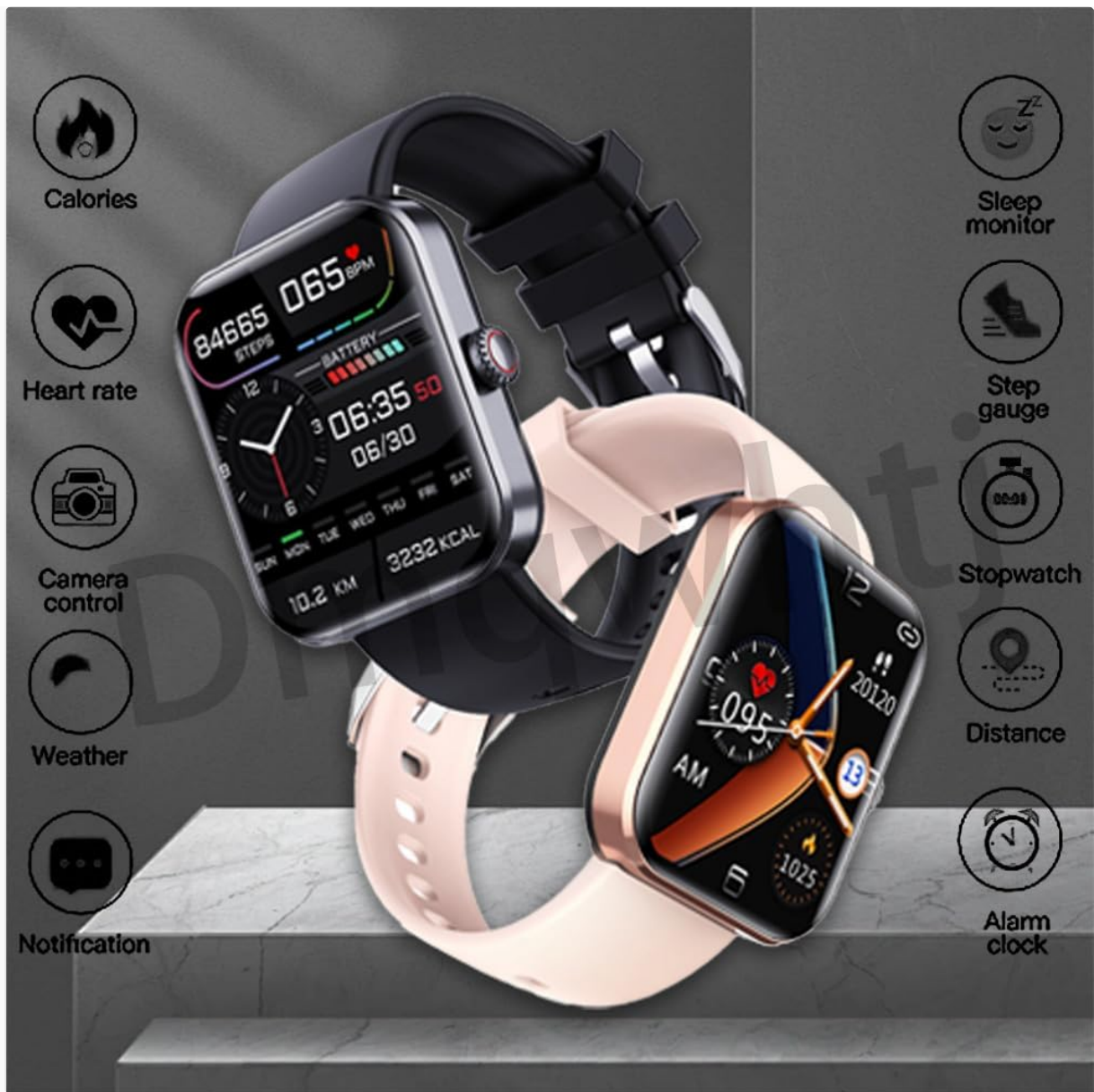
Image: The smartwatch screen showing icons for calories, sleep monitor, heart rate, step gauge, camera control, stopwatch, weather, distance, notification, and alarm clock, highlighting its multi-functional capabilities.