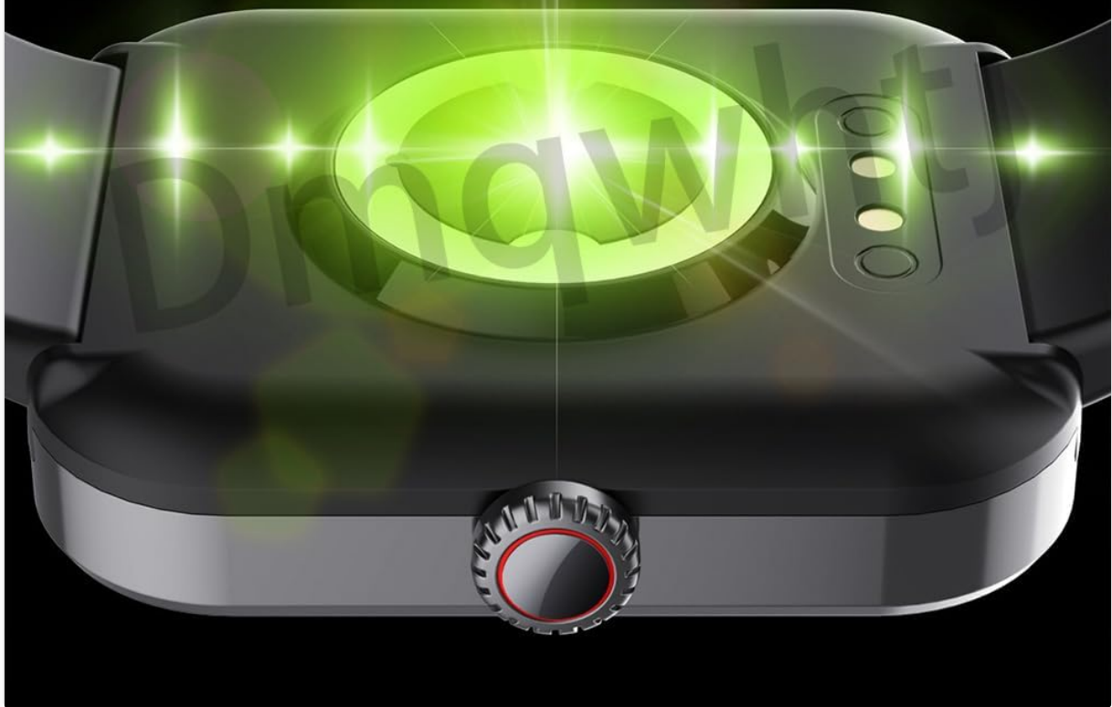
Image: The back of the smartwatch showing the magnetic charging contacts, illuminated with a green light, indicating active charging or data monitoring.