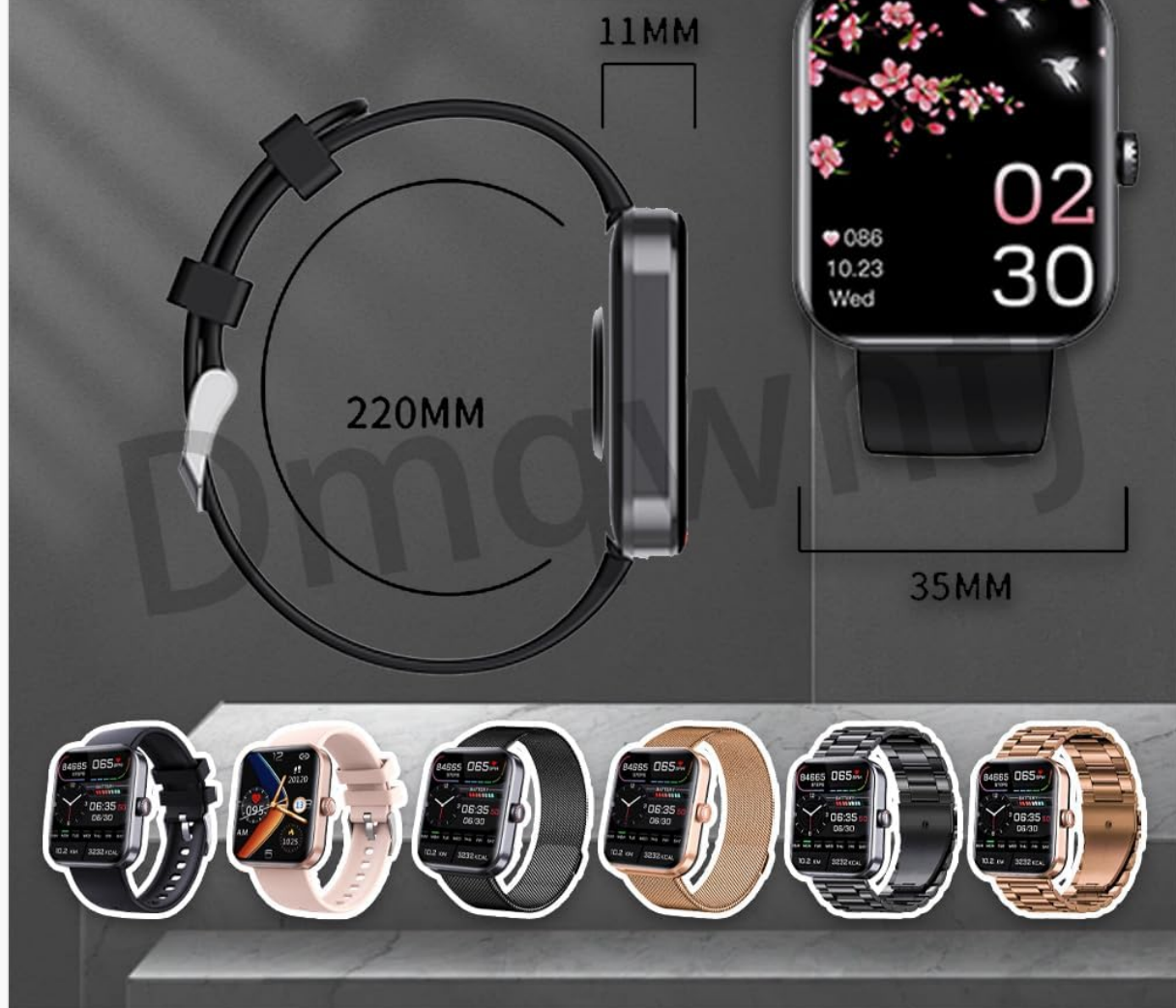
Image: Diagram showing the product dimensions of the smartwatch: 11mm thickness, 220mm strap length, and 35mm width.