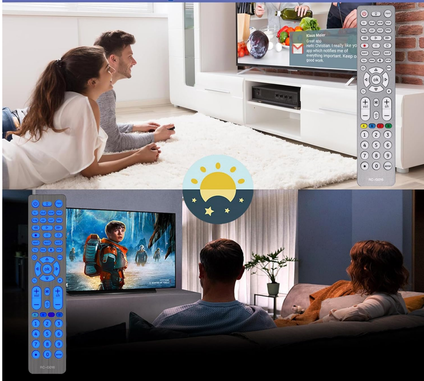
Figure 4: Illustration of the remote's backlight feature. The light bulb icon button activates the blue backlight for use in dark environments. Pressing it again turns off the backlight to conserve battery power.

To activate the backlight, press the Backlit button (often indicated by a light bulb icon). The buttons will illuminate, making them visible in low-light conditions. Press the button again to turn off the backlight and conserve battery life.