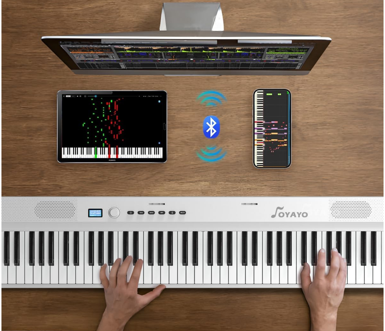
Image: The OYAYO FP88DW piano demonstrating MIDI and Bluetooth connectivity with external devices like tablets and smartphones for educational apps.

Connect to computer/iPad/Phone educational App get more music learning and gameplay