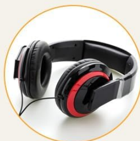
Wired Headphones Connect

Upgraded speakers bring better sound quality experience, and the overall design is more beautiful