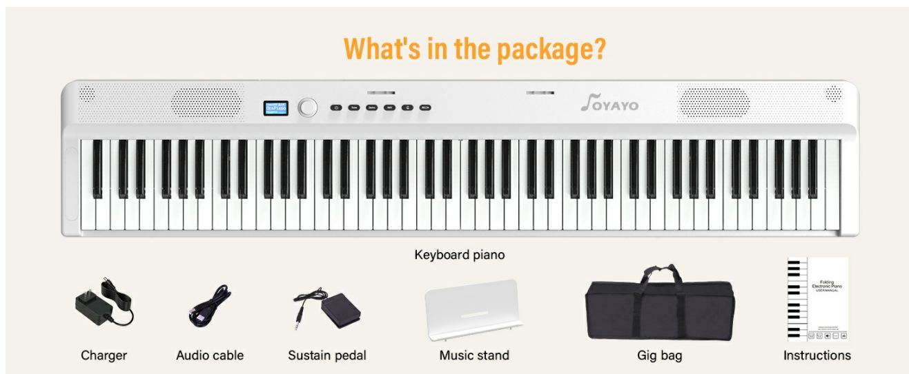
Image: OYAYO FP88DW Folding Piano Keyboard and its accessories, including the power adapter, audio cable, sustain pedal, music stand, gig bag, and user manual.