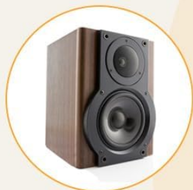
Wired Speakers Connect