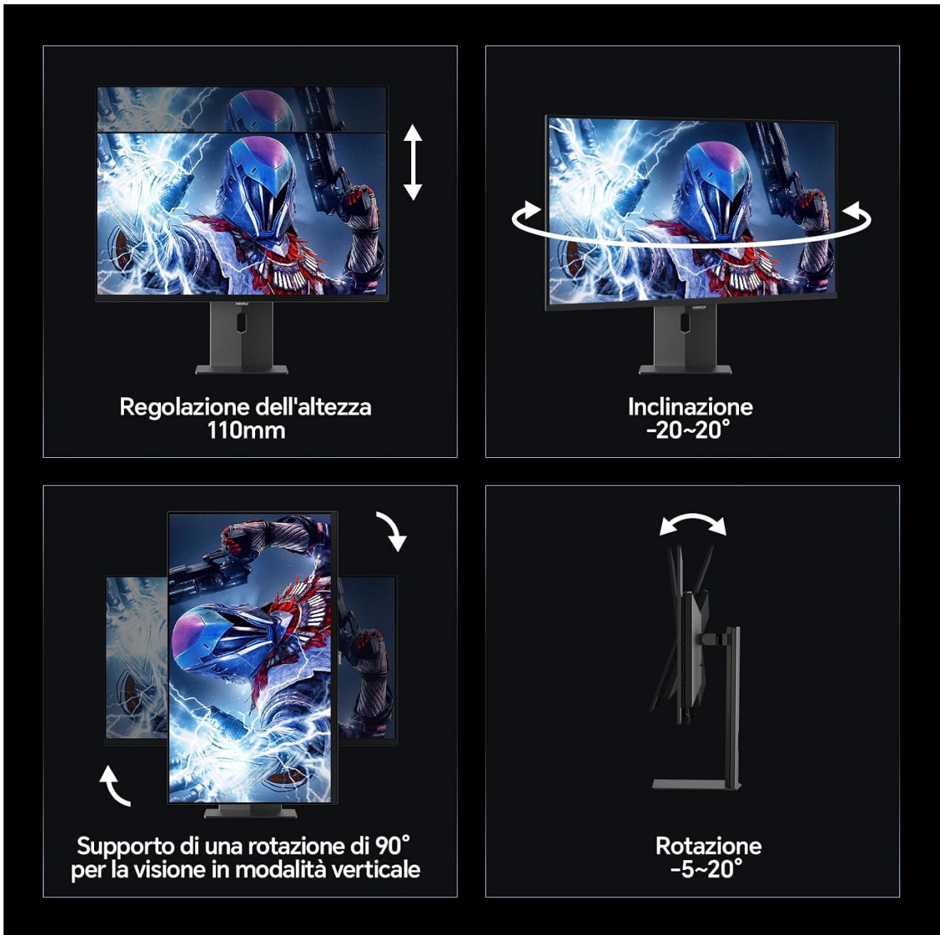
Image: Illustrations showing the monitor's ergonomic adjustments including height adjustment (110mm), tilt (-20° to 20°), 90° pivot for vertical viewing, and swivel (-5° to 20°).

Alternatively, the monitor supports VESA 75mm x 75mm mounting for wall mounts or monitor arms. Ensure the VESA mount is rated for the monitor's weight (3 kg).