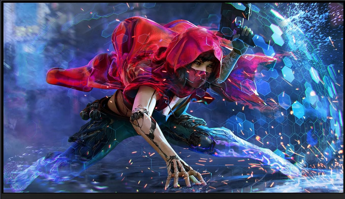
Image: KOORUI S2721XO 27-inch QD-OLED Gaming Monitor showcasing its main features like 240Hz refresh rate, 0.03ms response time, QHD resolution, QD-OLED panel, VESA compatibility, 99% DCI-P3 color gamut, Eye Care, and Adaptive Sync.