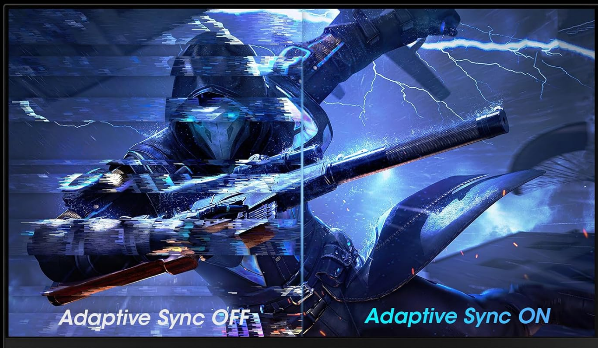
Image: A visual demonstration of Adaptive Sync technology, showing the difference between Adaptive Sync OFF (with screen tearing and stuttering) and Adaptive Sync ON (with smooth, tear-free visuals).