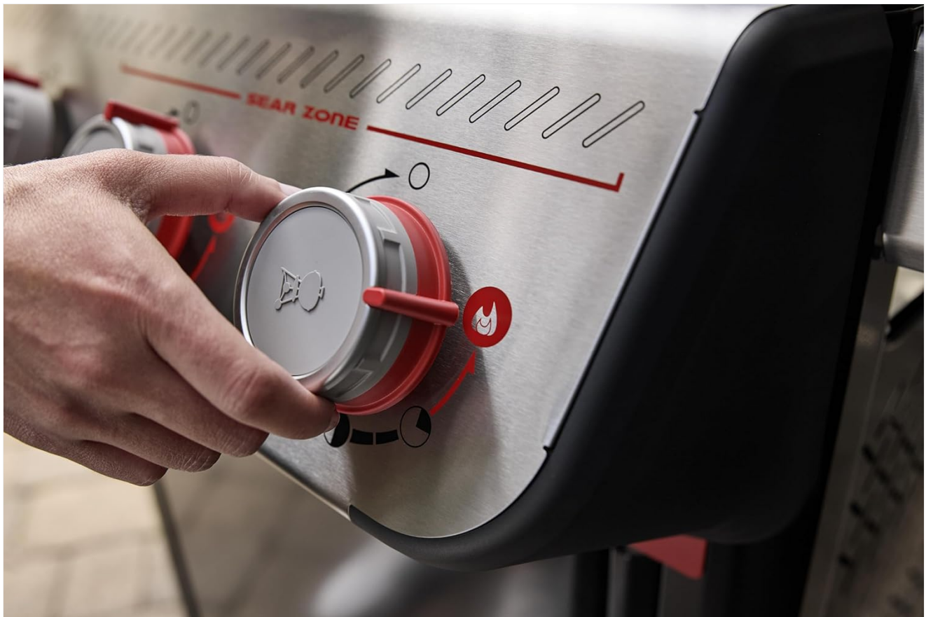
Figure 5: Adjusting the control knob for the Sear Zone.