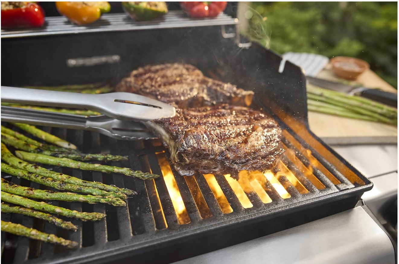
Figure 6: Food being seared on the grill's cooking grates.