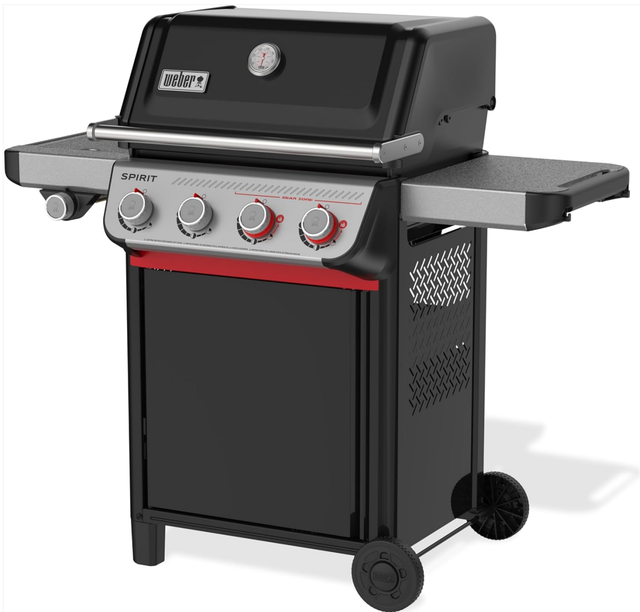
Figure 3: Side view showing the side burner and accessory rails.