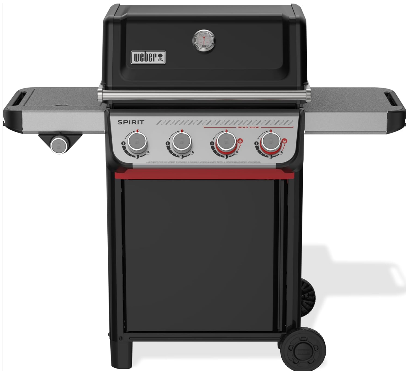
Figure 1: Front view of the Weber SPIRIT E-435 4-Burner Liquid Propane Gas Grill.