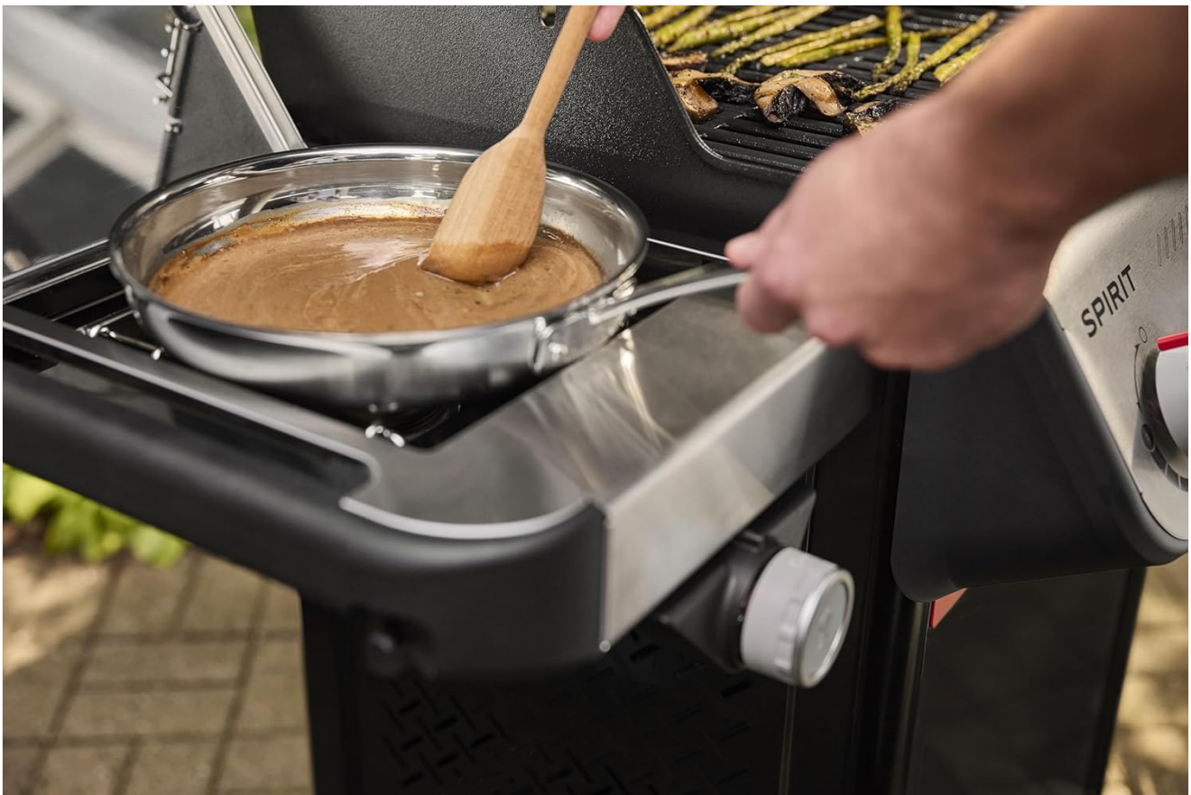
Figure 7: The side burner in operation with a pan.