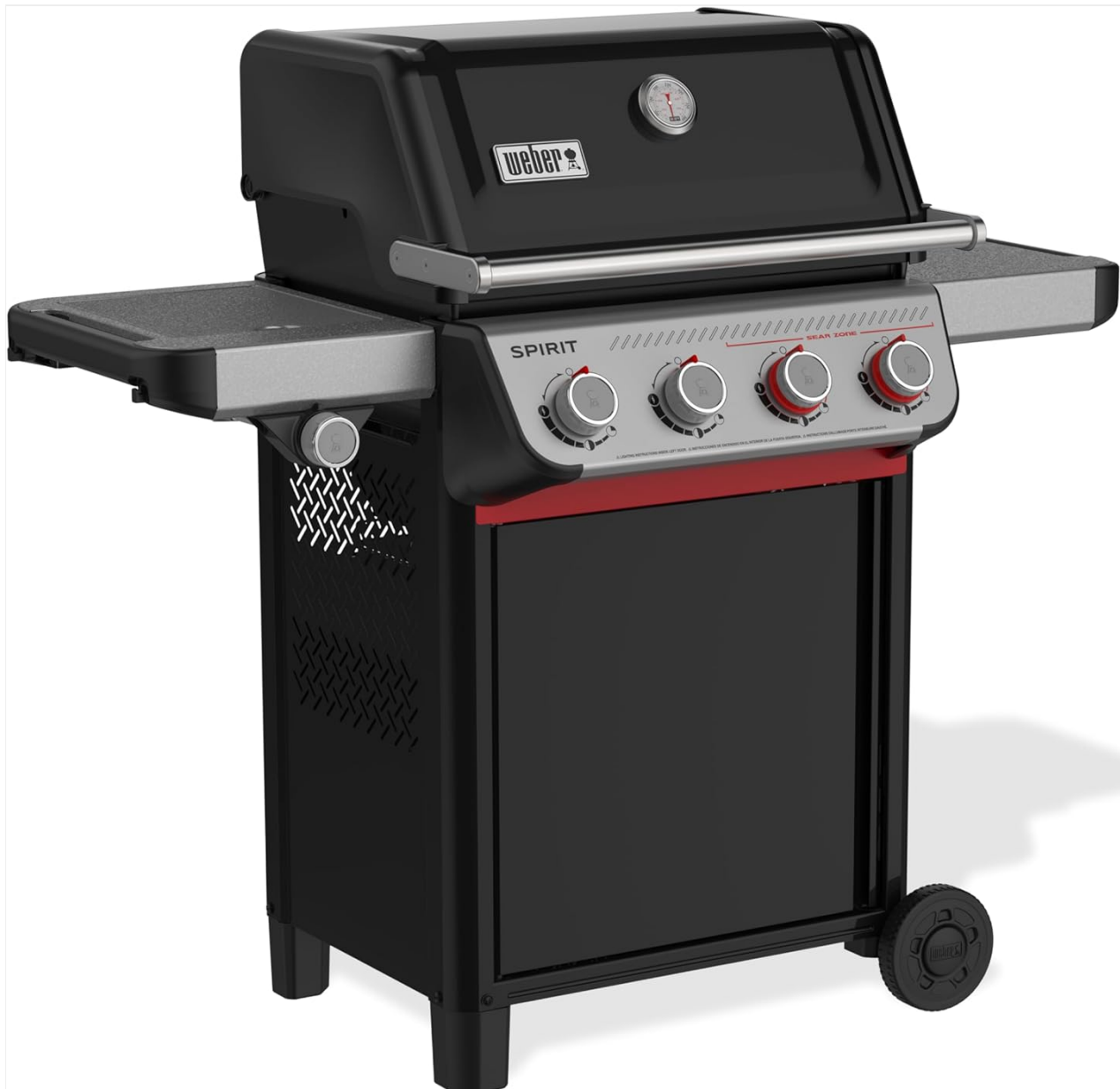
Figure 2: Angled front view highlighting control panel and side tables.