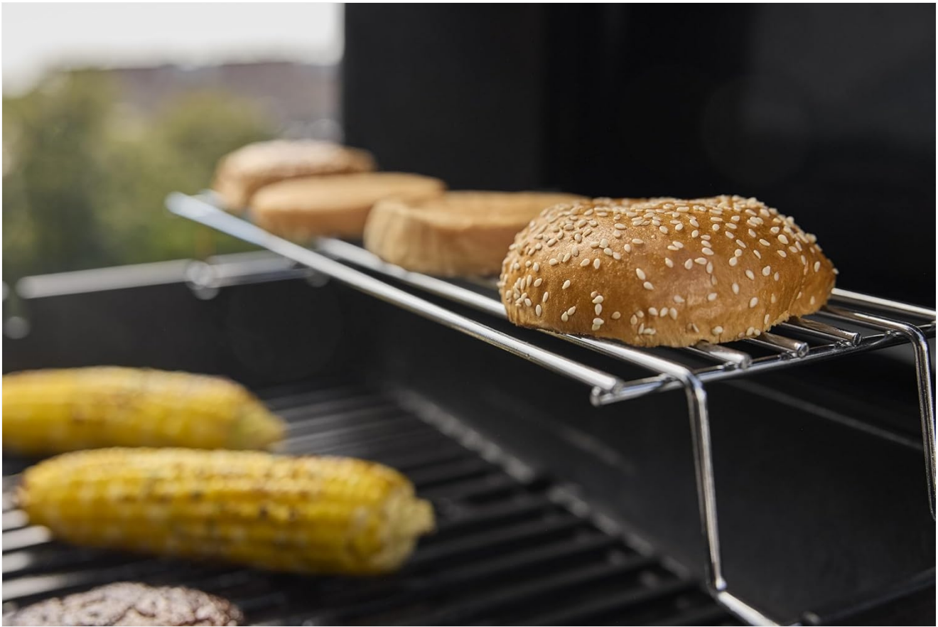
Figure 8: Warming rack in use, indicating areas that require cleaning.