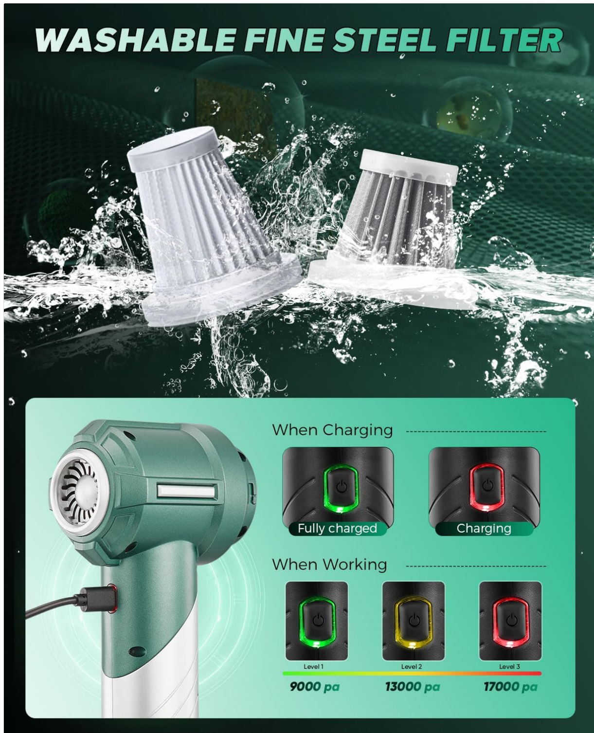
Image: The washable fine steel filter being rinsed under running water for cleaning.