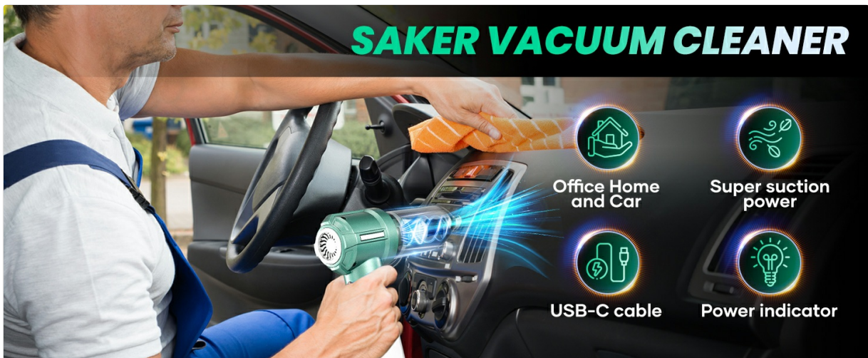
Image: Overview of the Saker HL133, showcasing its USB-C charging port, power indicator, and various cleaning capabilities.