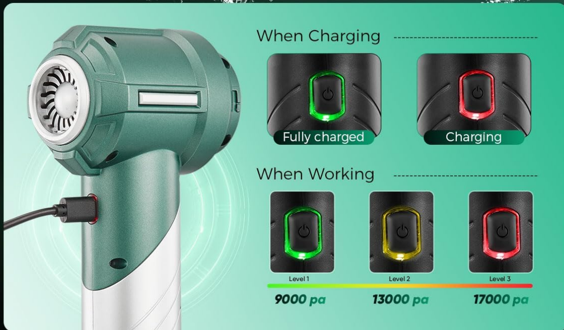
Image: The device's charging status indicators (red for charging, green for fully charged) and power levels during operation.