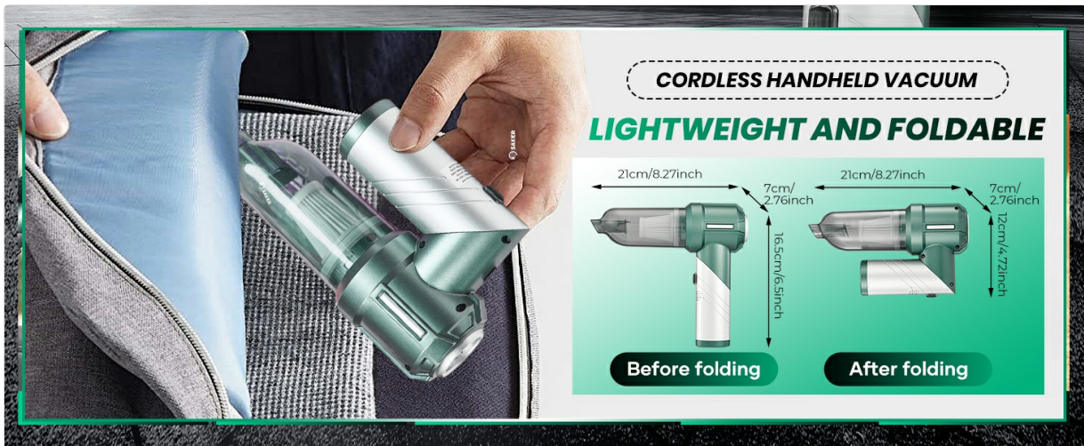
Image: The Saker HL133 demonstrating its foldable design and compact dimensions for storage.