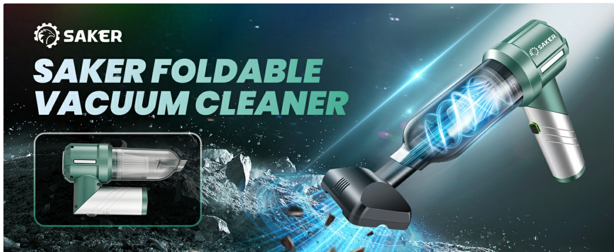
Image: The Saker HL133 being used in vacuum mode with different attachments for various cleaning tasks.

Press the power button to turn the device on. Subsequent presses will cycle through the three power levels (9000 Pa, 13000 Pa, 17000 Pa). Press and hold the power button to turn off the device.