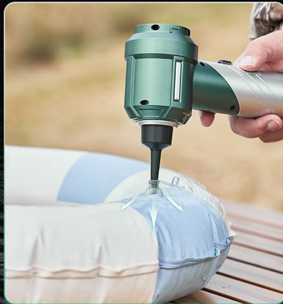
Image: The Saker HL133 utilizing its inflator nozzle to inflate a small inflatable ring.