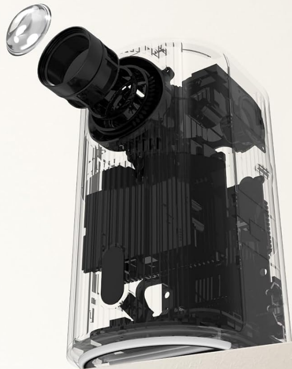
Figure 2: Illustration of the projector's dust-proof optical engine and high-resolution display capabilities.