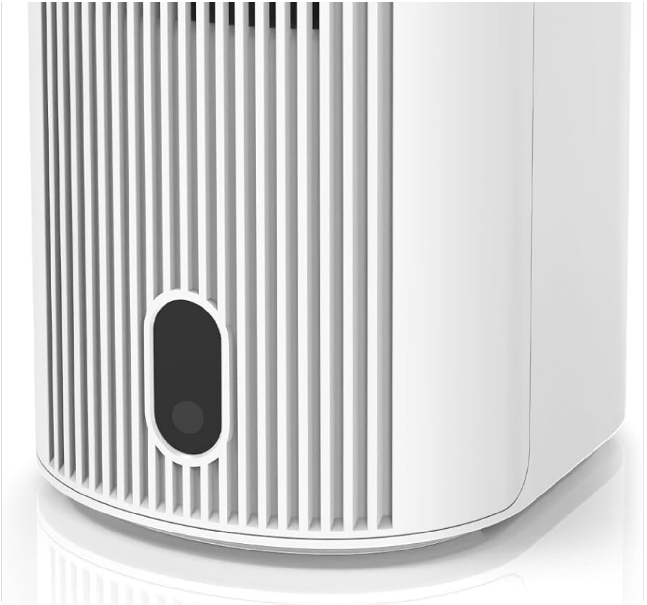
Figure 1: FEARWIKY M-P6 4K Projector - Front View