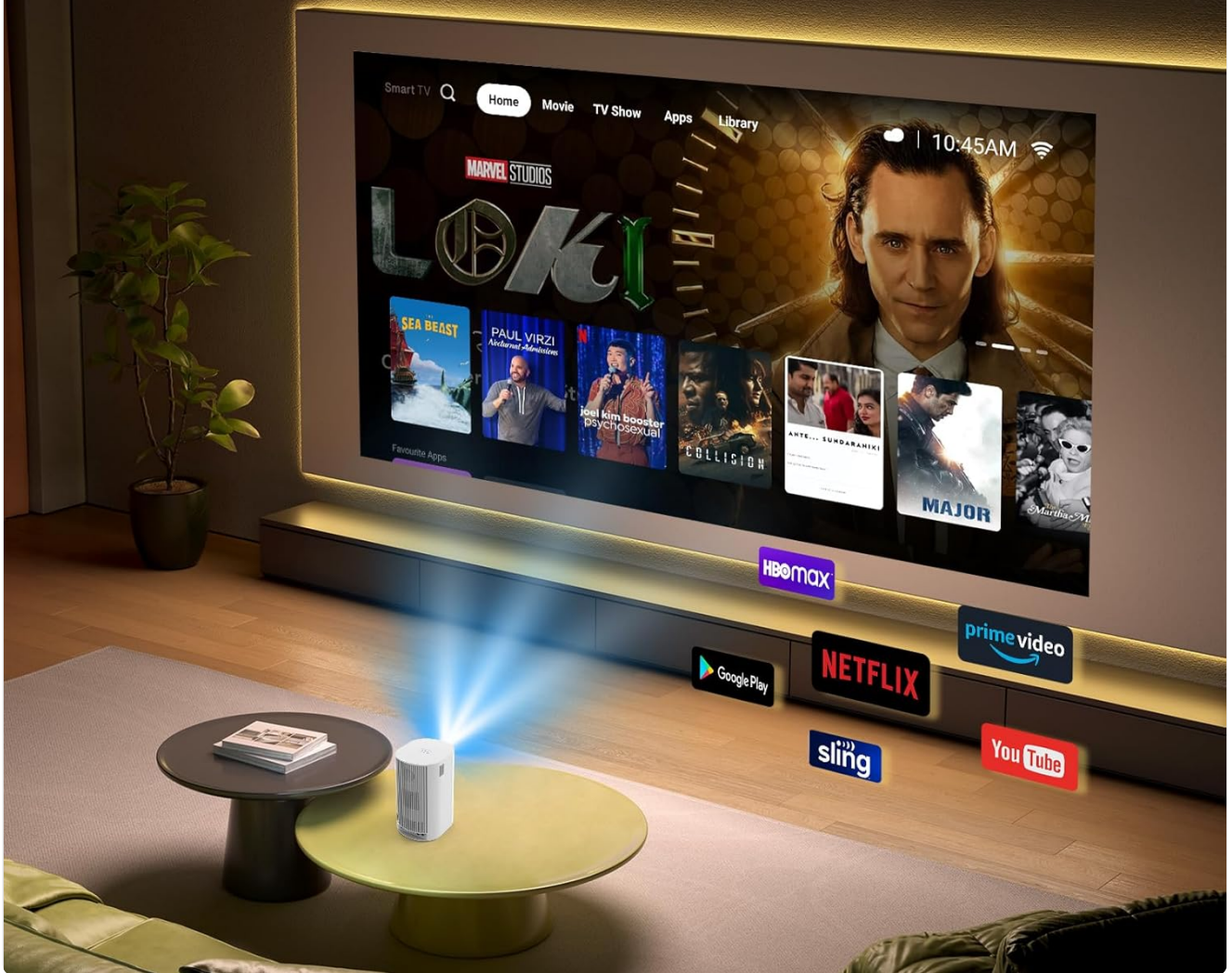
Figure 3: The projector's smart interface showing access to various streaming applications.