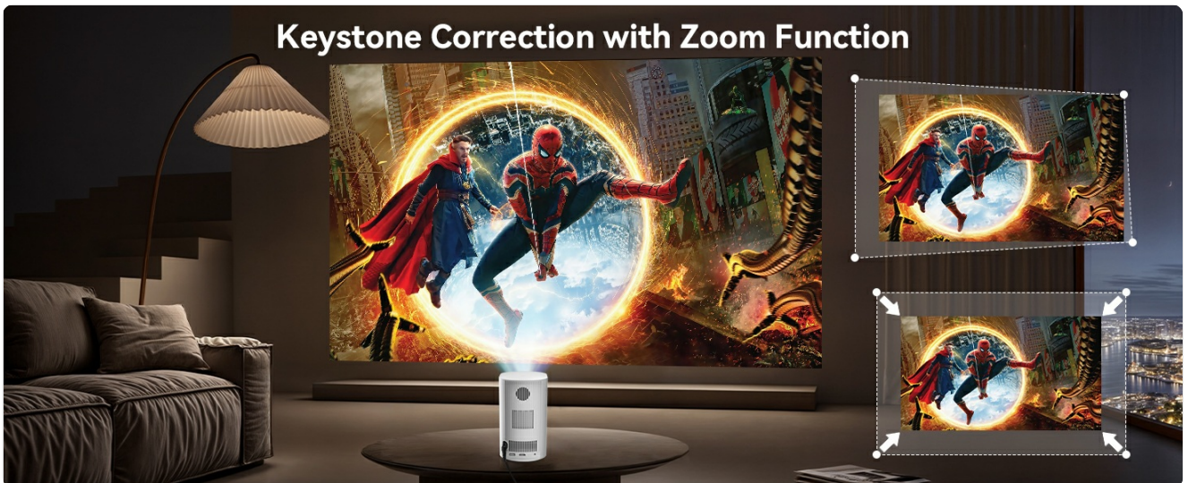
Figure 4: Visual representation of automatic keystone correction and the zoom function, ensuring a perfectly rectangular image from various angles.