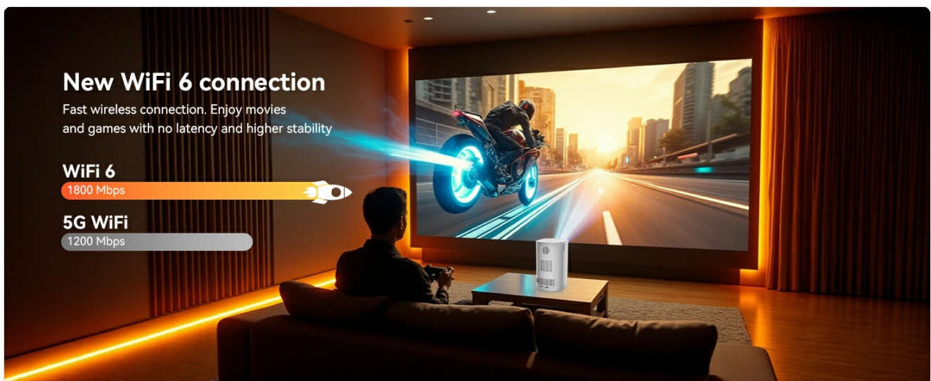
Figure 6: The projector's Wi-Fi 6 connectivity, demonstrating faster data transfer compared to older Wi-Fi standards.