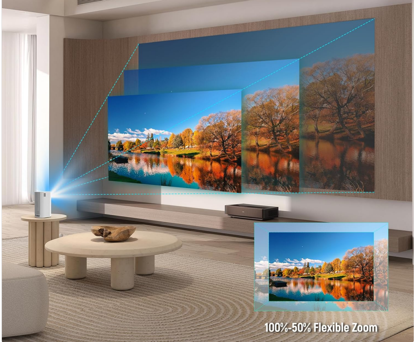
Figure 5: Diagram illustrating the optimal projection distance and the flexible zoom capability of the projector.

The optimal projection size is 60", and the optimal distance between the projector and the screen is 5.58ft.