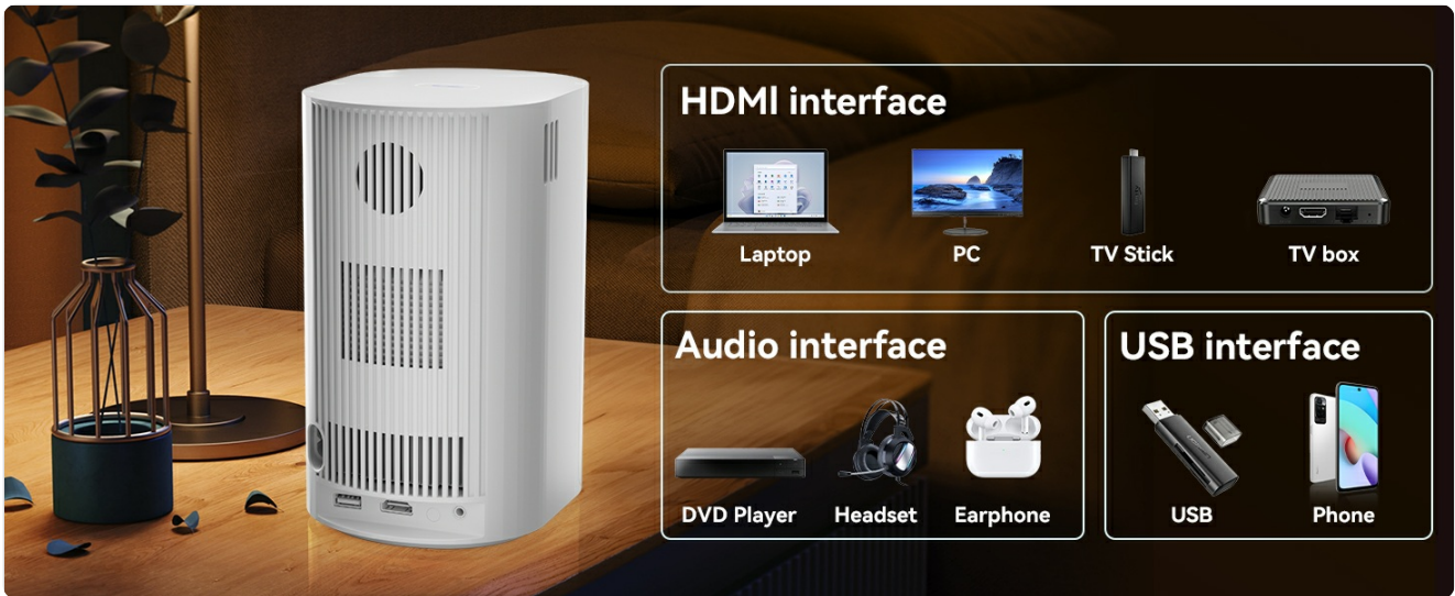
Figure 8: Detailed view of the projector's input/output ports, including HDMI, audio output, and USB, and compatible devices.