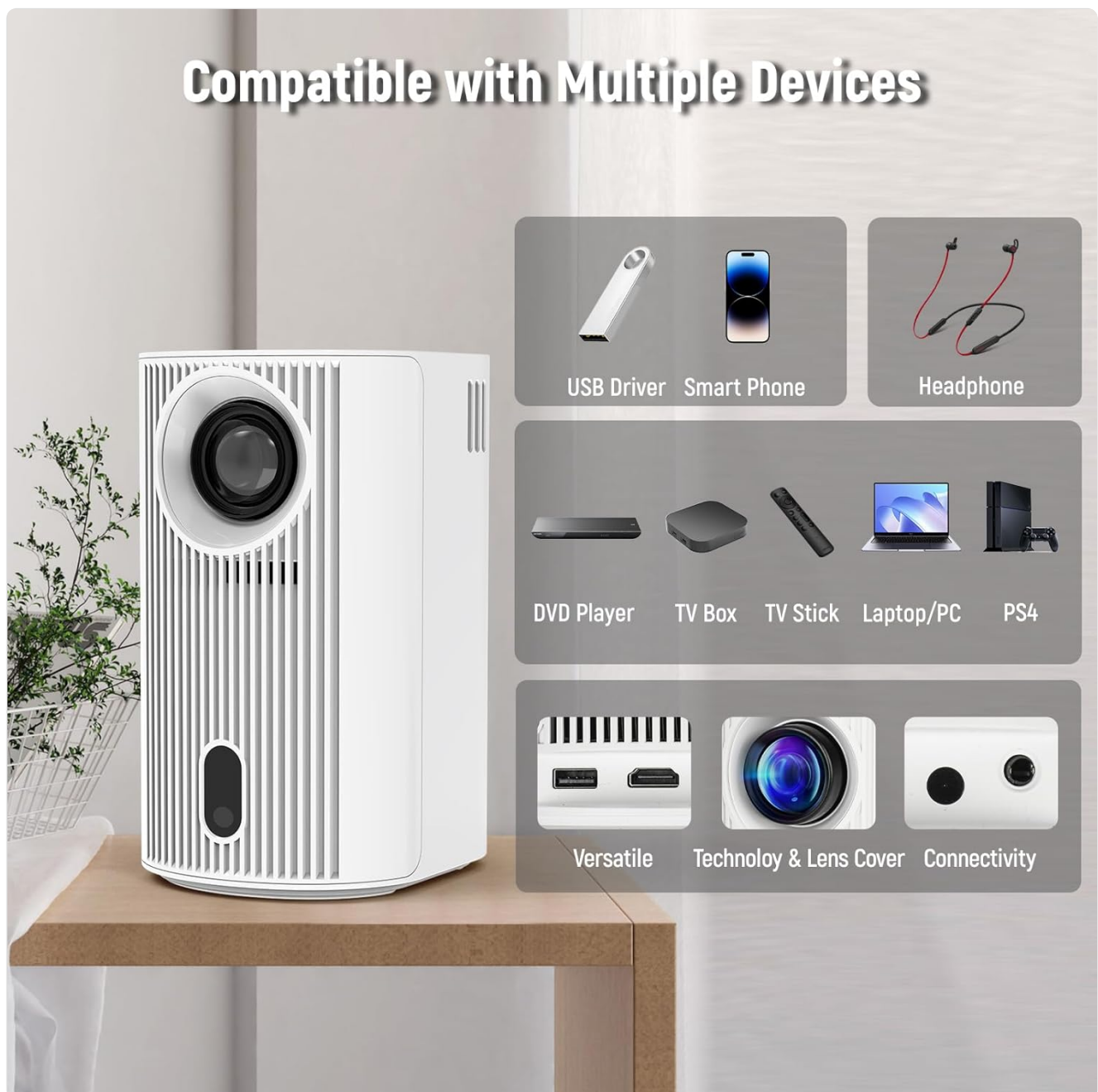
Figure 7: Overview of the projector's various connectivity options, including USB, smartphone, headphone, DVD player, TV Box, TV Stick, laptop, and PS4.