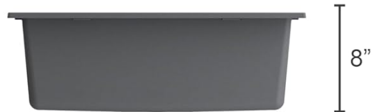
Image: Detailed diagram illustrating the external and internal measurements of the sink.

Made from 80% luxury granite with 20% resin for added strength and durability