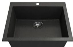
TG2420MT Metallic Black