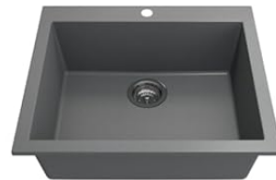
TG2420CG Concrete Gray