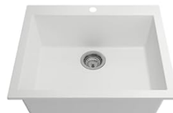
TG2420MW Matte White

Image: The Hyperion 24 sink is available in multiple colors, including the Concrete Gray (TG2420CG) model.