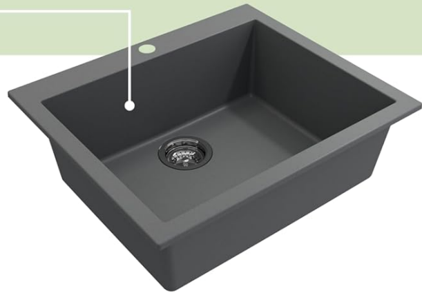
Image: Visual representation of the sink's extreme durability, highlighting resistance to scratches, heat, UV, and stains.

Stain Resistant Non-porous surface resists stains for easy cleaning