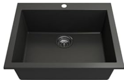
TG2420MB Matte Black

TG2420XX - HYPERION 24 (Available in 4 colors)