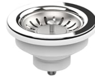
Image: The TERRAlife Hyperion 24 sink shown with the included chrome basket strainer.