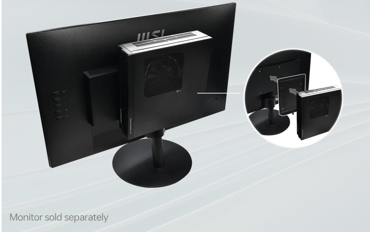
Image 4.1: MSI PRO DP21 mounted behind a monitor using a VESA bracket.

The VESA Mountable design allows you to hook up PRO DP21 anywhere you like that not only improves the flexibility while working with it but also let users have a good space management at home or in the office.