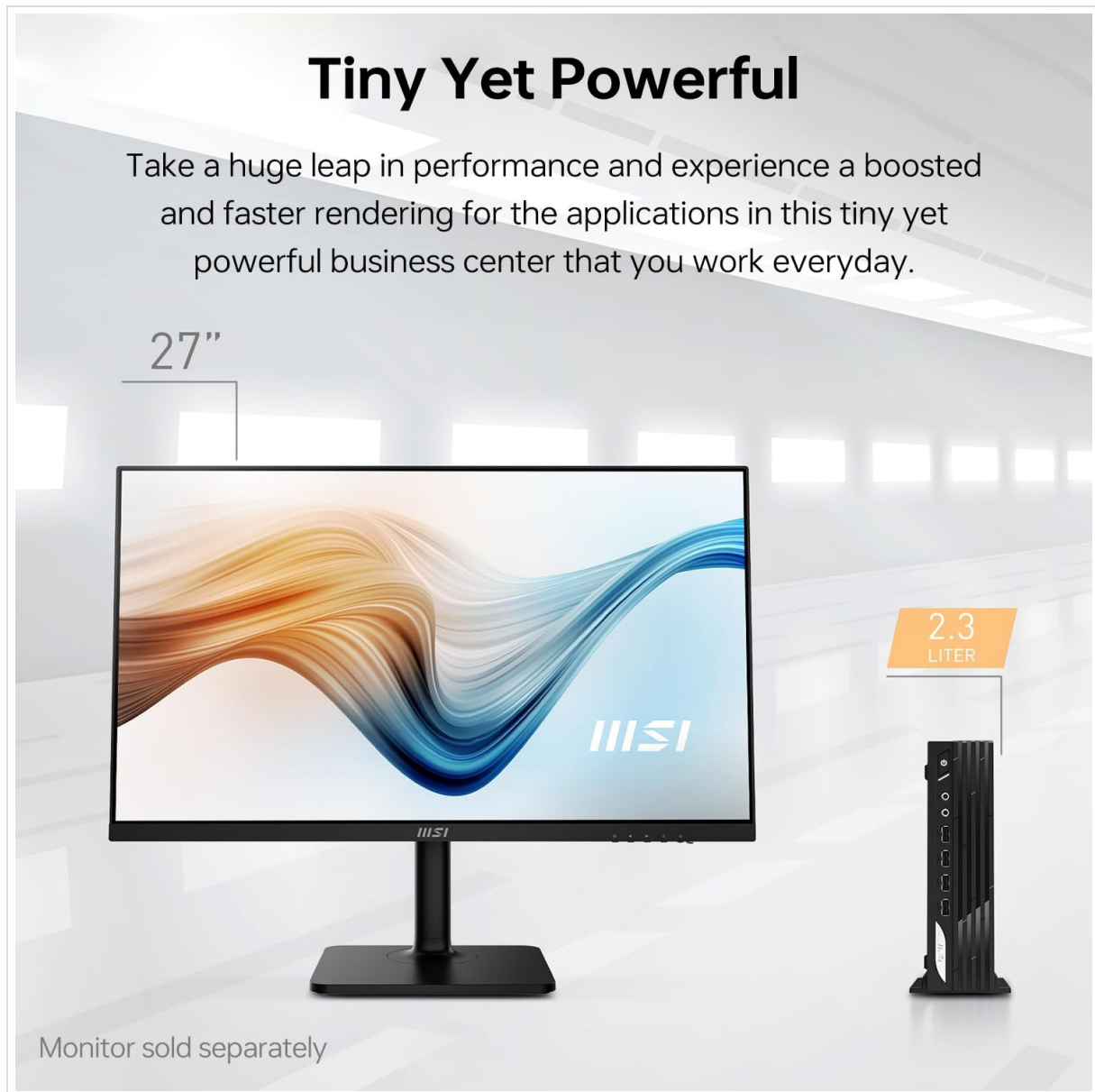
Image 1.2: Size comparison of the MSI PRO DP21 Mini PC with a 27-inch monitor.

The image displays two MSI PRO DP21 mini desktop computers. One unit is positioned horizontally, showing its front panel with power button, audio jacks, and USB ports. The other unit is standing vertically, revealing its rear panel with various connectivity options. Both units are black with a sleek, compact form factor, highlighting the product's small footprint.