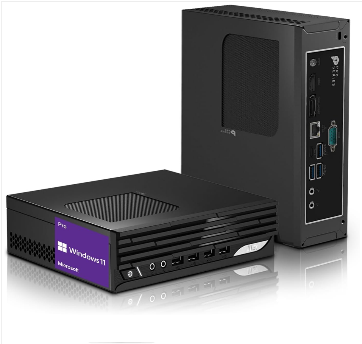
Image 1.1: The MSI PRO DP21 Mini Desktop Computer, showcasing its compact design.

This manual provides essential information for setting up, operating, and maintaining your MSI PRO DP21 Mini Desktop Computer. Please read this guide thoroughly before using the product to ensure proper functionality and safety.