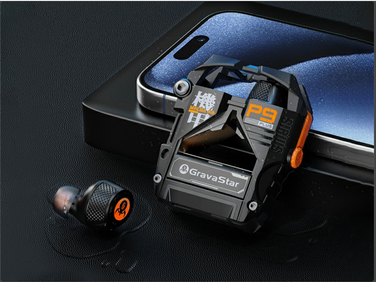
Image: The GravaStar Sirius Plus earbuds and their charging case placed beside a smartphone, illustrating their connectivity.