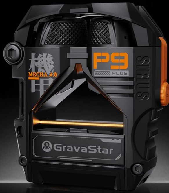
Image: The GravaStar Sirius Plus charging case illustrating its 28-hour playtime and fast charging capabilities.