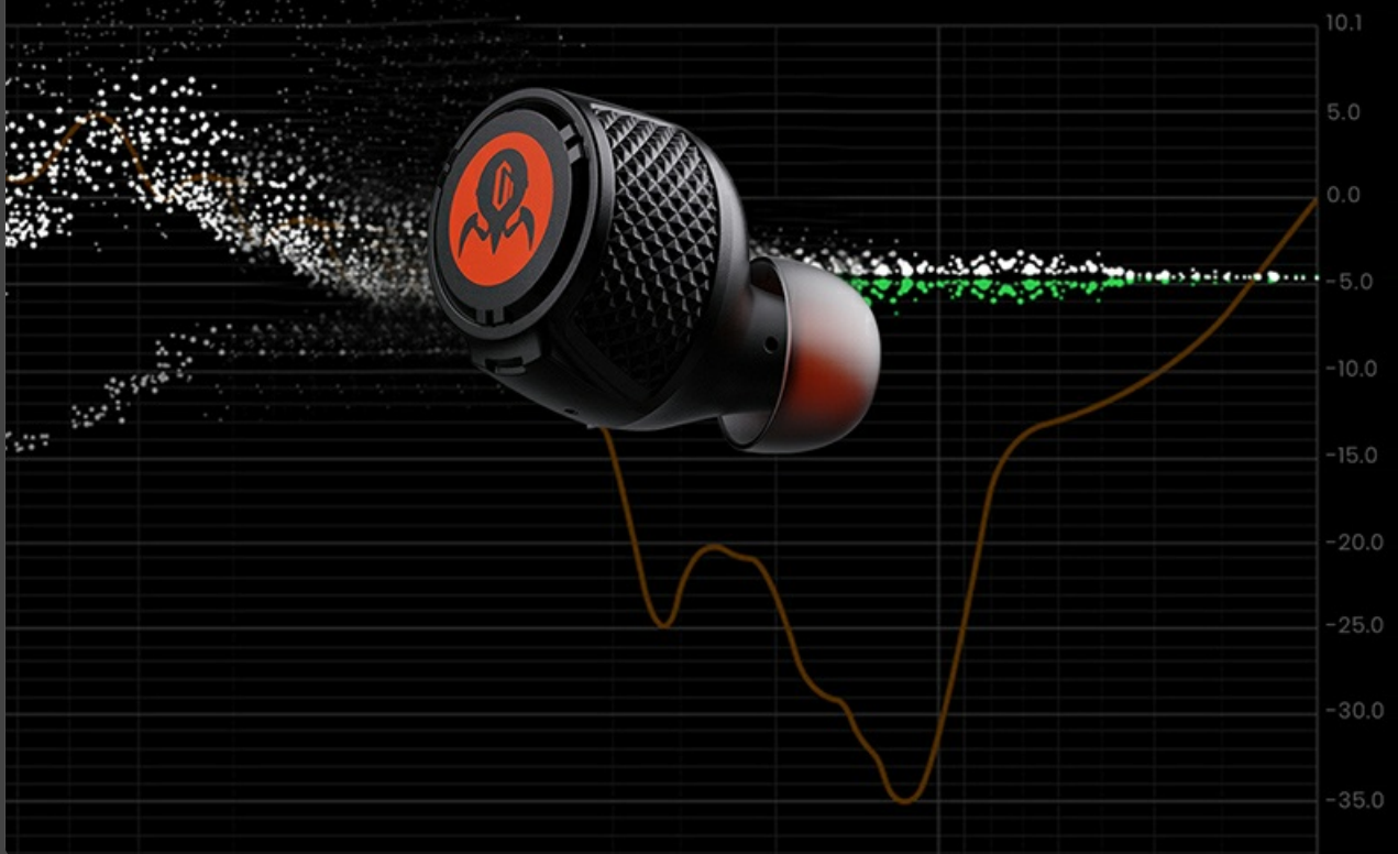
Image: A detailed graph illustrating the noise reduction capabilities of the GravaStar Sirius Plus earbuds' Active Noise Cancellation (ANC).