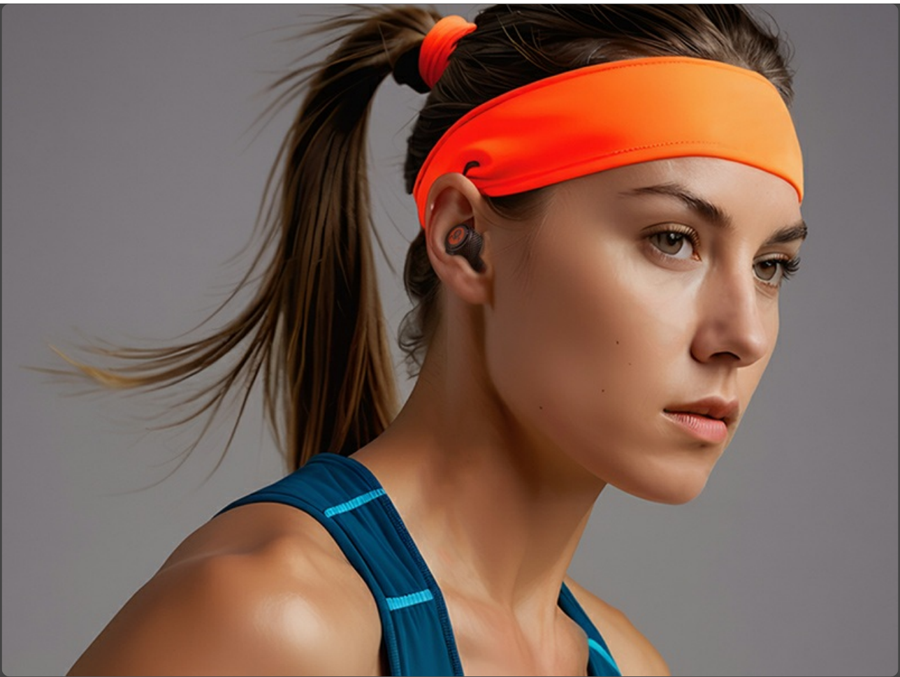
Image: A woman wearing GravaStar Sirius Plus earbuds, highlighting their secure and comfortable fit during physical activity.