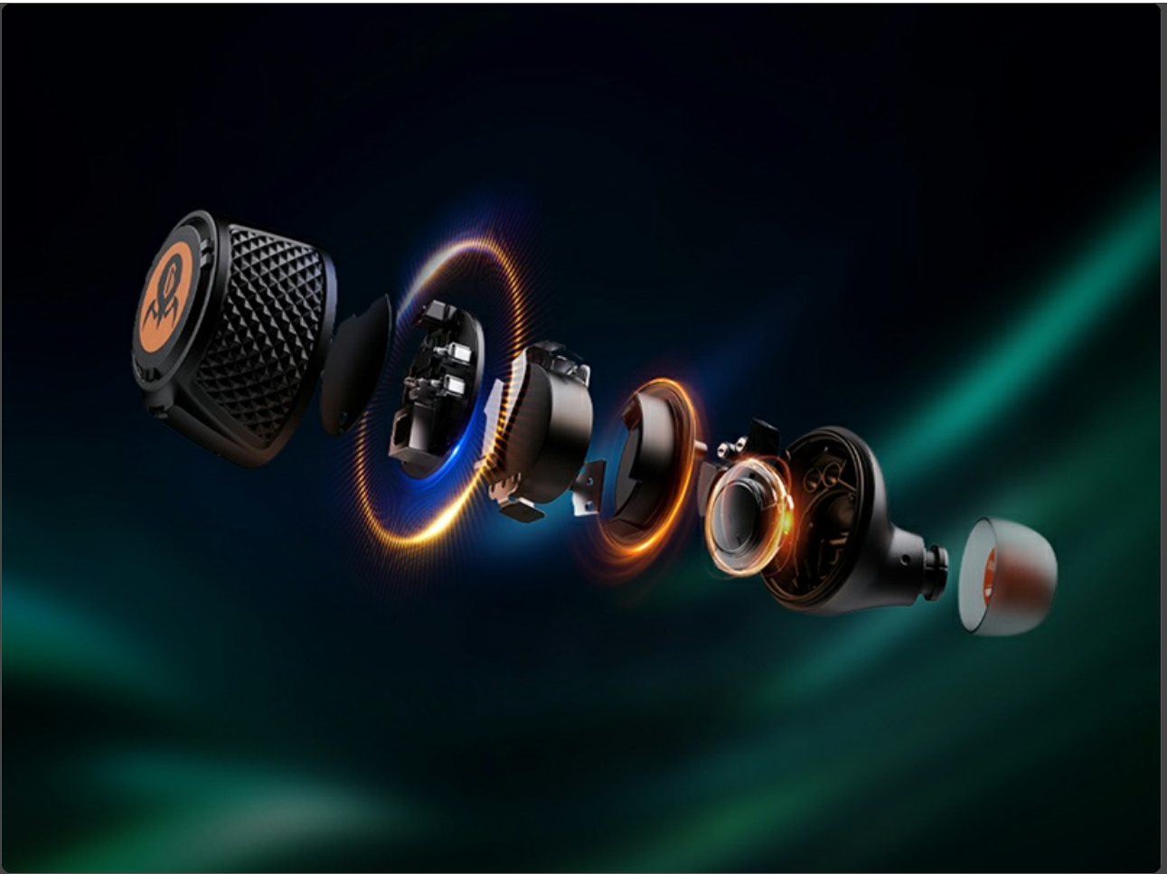
Image: A detailed exploded diagram of the GravaStar Sirius Plus earbud, illustrating its internal acoustic structure and components.