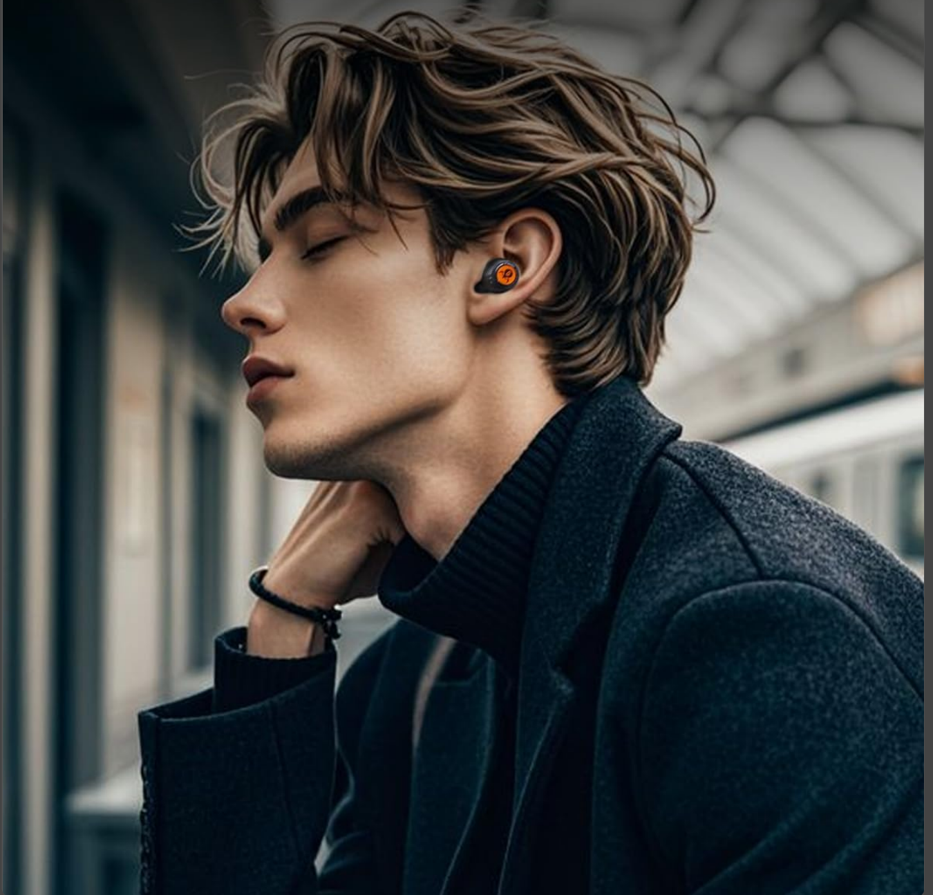
Image: A person wearing the GravaStar Sirius Plus earbuds, demonstrating their ergonomic design for comfortable all-day use.