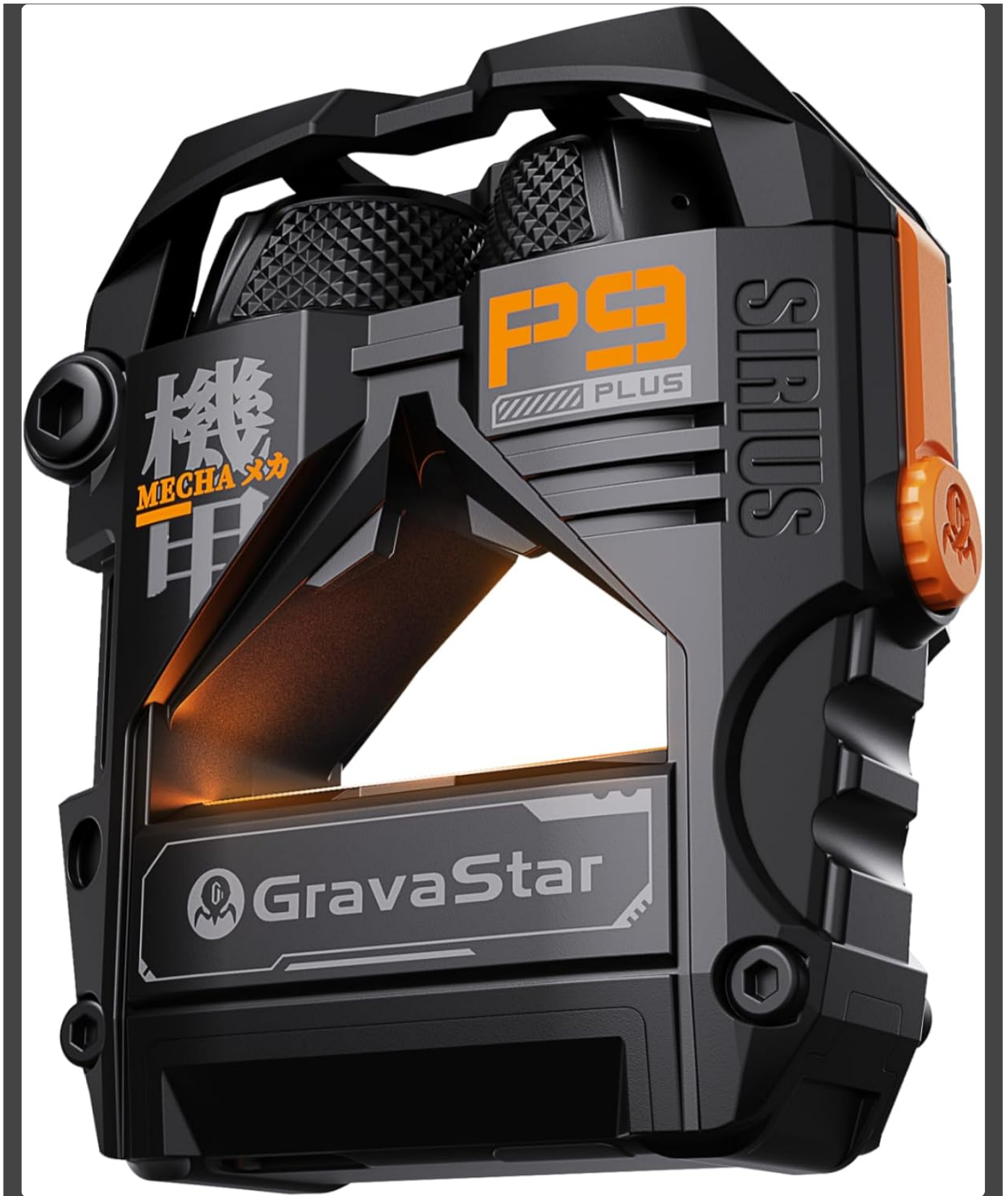
Image: The GravaStar Sirius Plus earbuds and their distinctive charging case, showcasing the product's unique aesthetic.