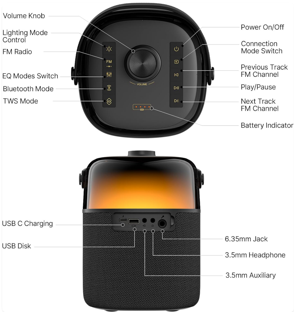
Image: Top and rear panel controls and ports of the PartyFree S2 speaker.

Familiarize yourself with the various parts and controls of your PartyFree S2 speaker for optimal use.