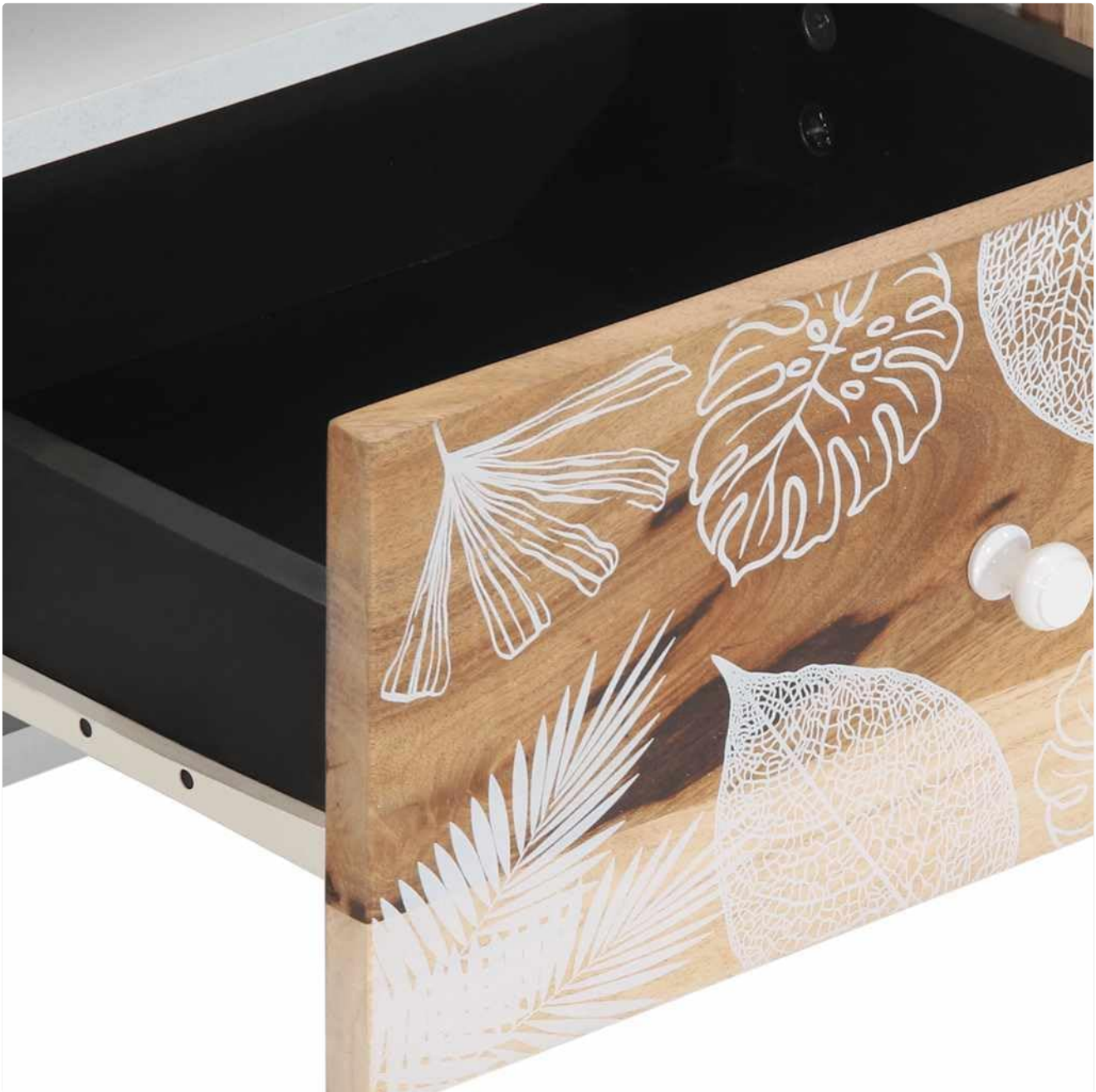
Figure 3: Detail of the drawer interior.