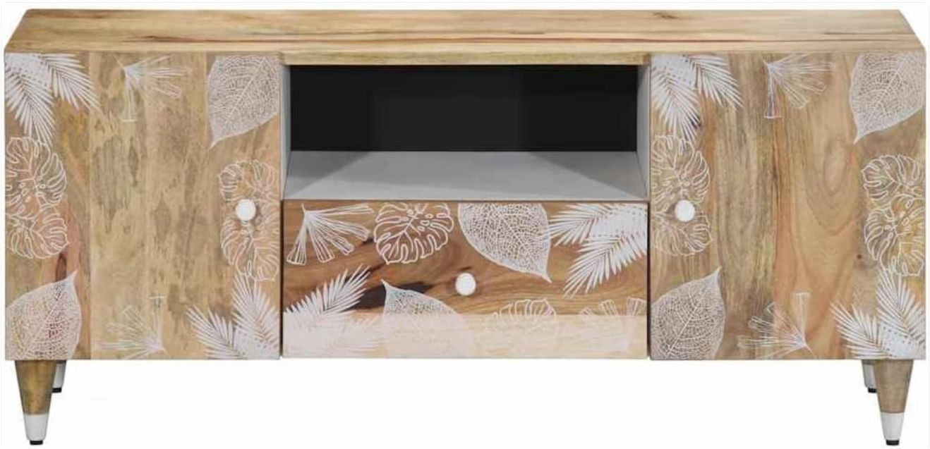
Figure 1: Front view of the assembled vidaXL TV Cabinet.

Thank you for choosing the vidaXL TV Cabinet, Model 4018678. This elegant and functional TV cabinet is crafted from robust solid mango wood, engineered wood, and metal, designed to provide ample storage and a stable surface for your entertainment devices. Its unique grain patterns ensure that each piece is distinct. This manual provides essential information for safe assembly, proper use, and effective maintenance to ensure the longevity of your furniture.