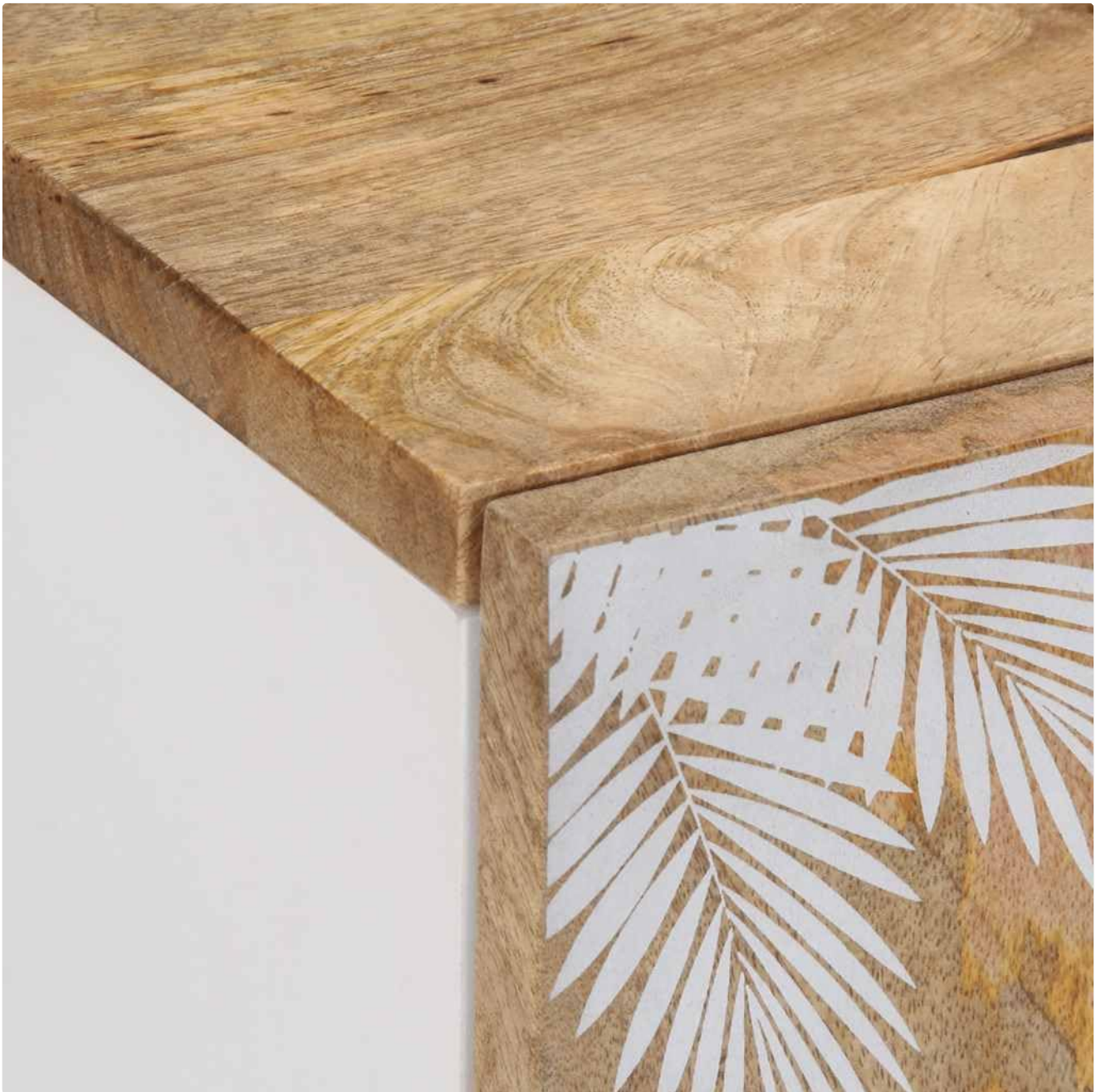
Figure 4: Detail of the mango wood surface and pattern.