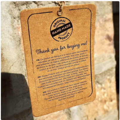
Figure 5: Original Hand Made Product tag, highlighting the unique nature of each item.

vidaXL products are manufactured with quality and care. For any questions regarding assembly, missing parts, or product defects, please refer to your purchase documentation for warranty details and contact information for vidaXL customer support. Please have your model number (4018678) and purchase date ready when contacting support.