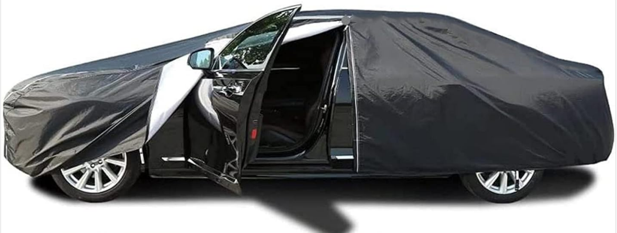
Image: Close-up view of the external Oxford cloth material, highlighting its waterproof properties, alongside a car with the cover partially opened to show driver's door access.