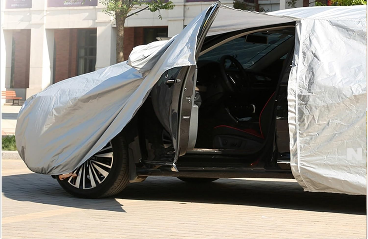
Image: A car covered with the product, showing the zipper door design on the driver's side, allowing entry without full cover removal.