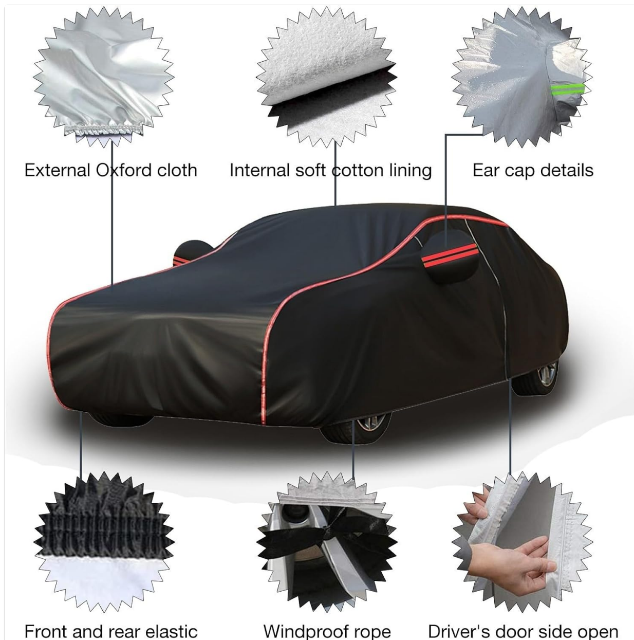
Image: Detailed view of the car cover highlighting its construction, including the external Oxford cloth, internal soft cotton lining, ear cap details for mirrors, elasticized hems, windproof rope attachment points, and the driver's side access zipper.