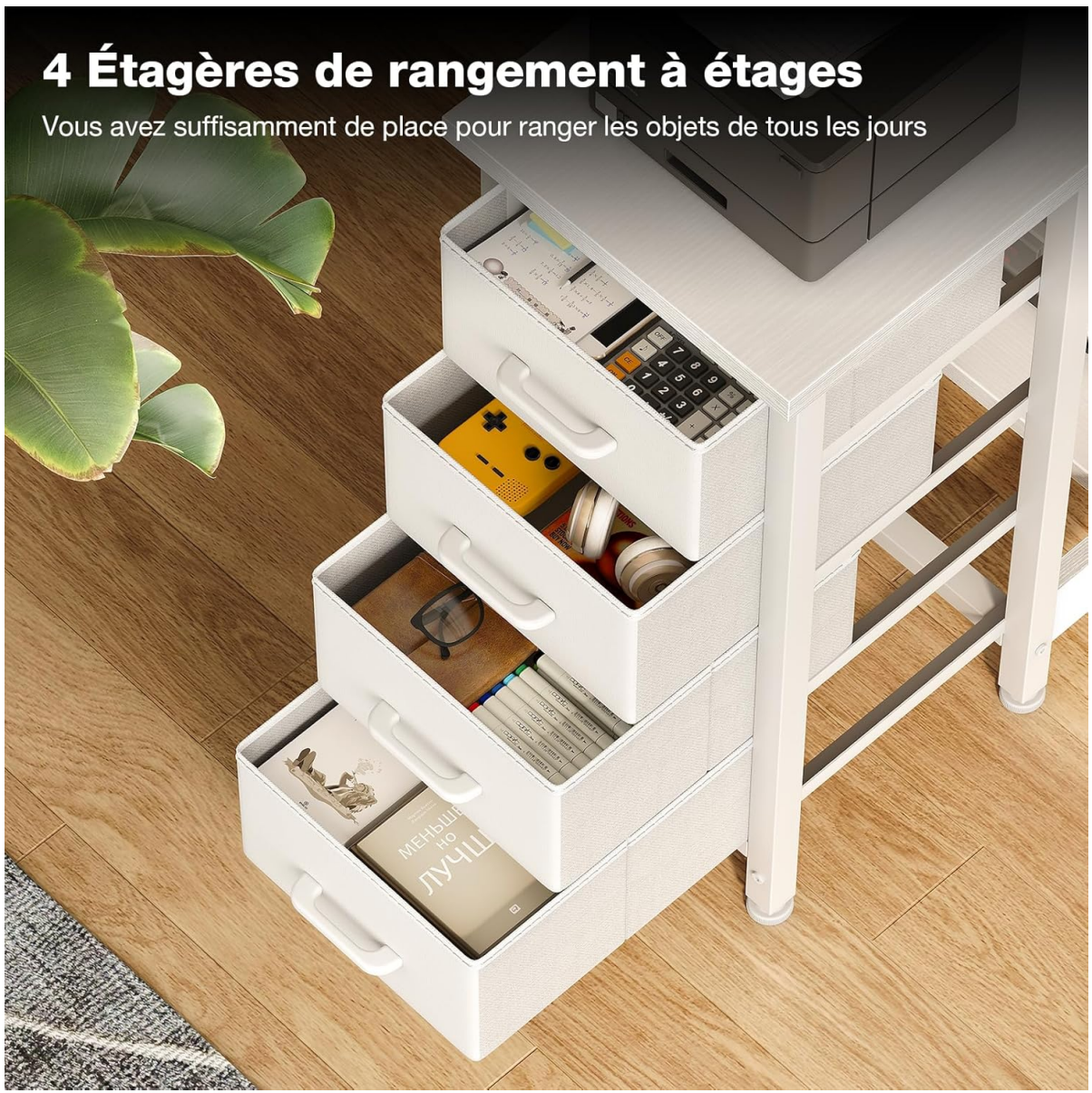
Image 2.2: A detailed view of the four fabric drawers, showcasing their capacity for organizing various office items.

Vous avez suffisamment de place pour ranger les objets de tous les jours