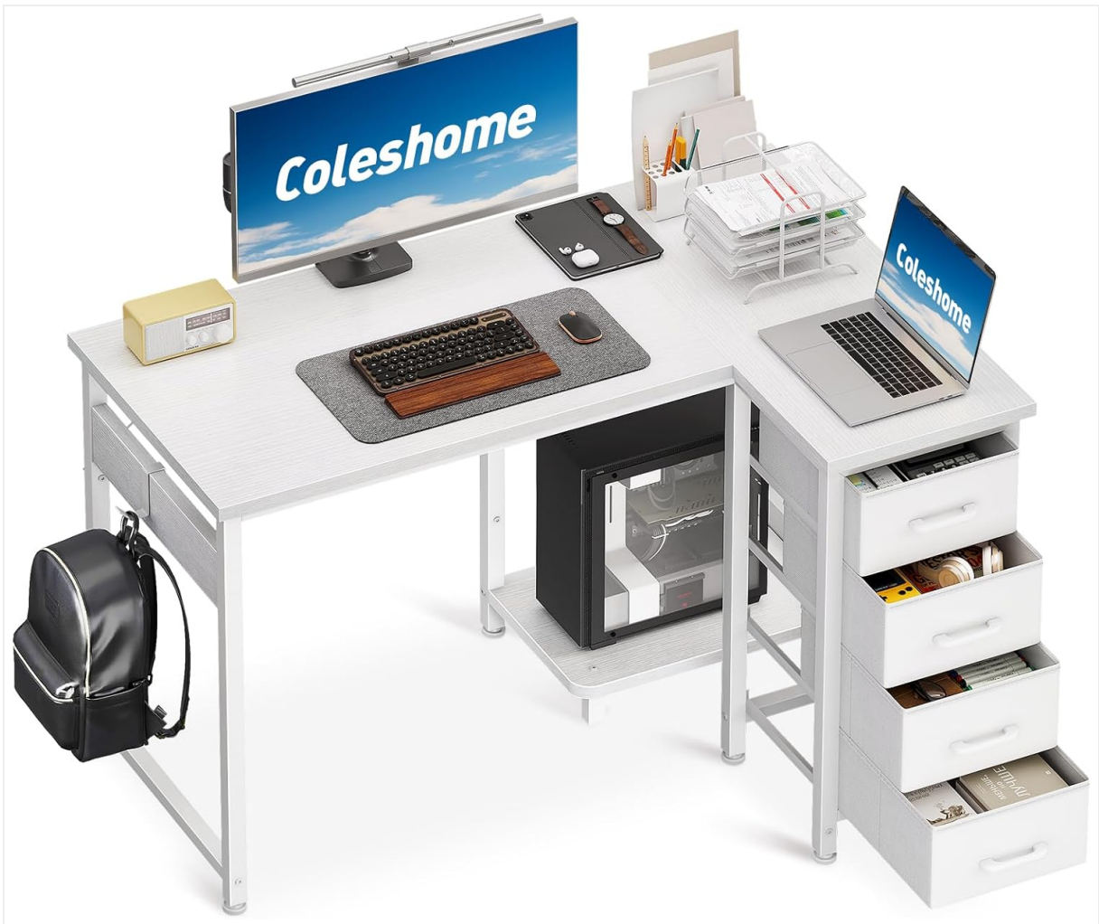
Image 1.1: The Coleshome L-Shaped Corner Desk, featuring a spacious desktop, integrated PC compartment, and four fabric drawers, designed for an organized workspace.