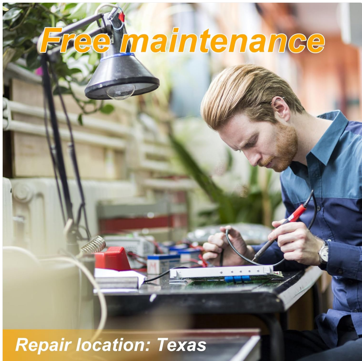
Image 9.1: Illustration indicating free maintenance and repair services available in Texas.

For any technical assistance, troubleshooting beyond this manual, or warranty inquiries, please contact FLLYROWER customer support. Repair services are available at our location in Texas.