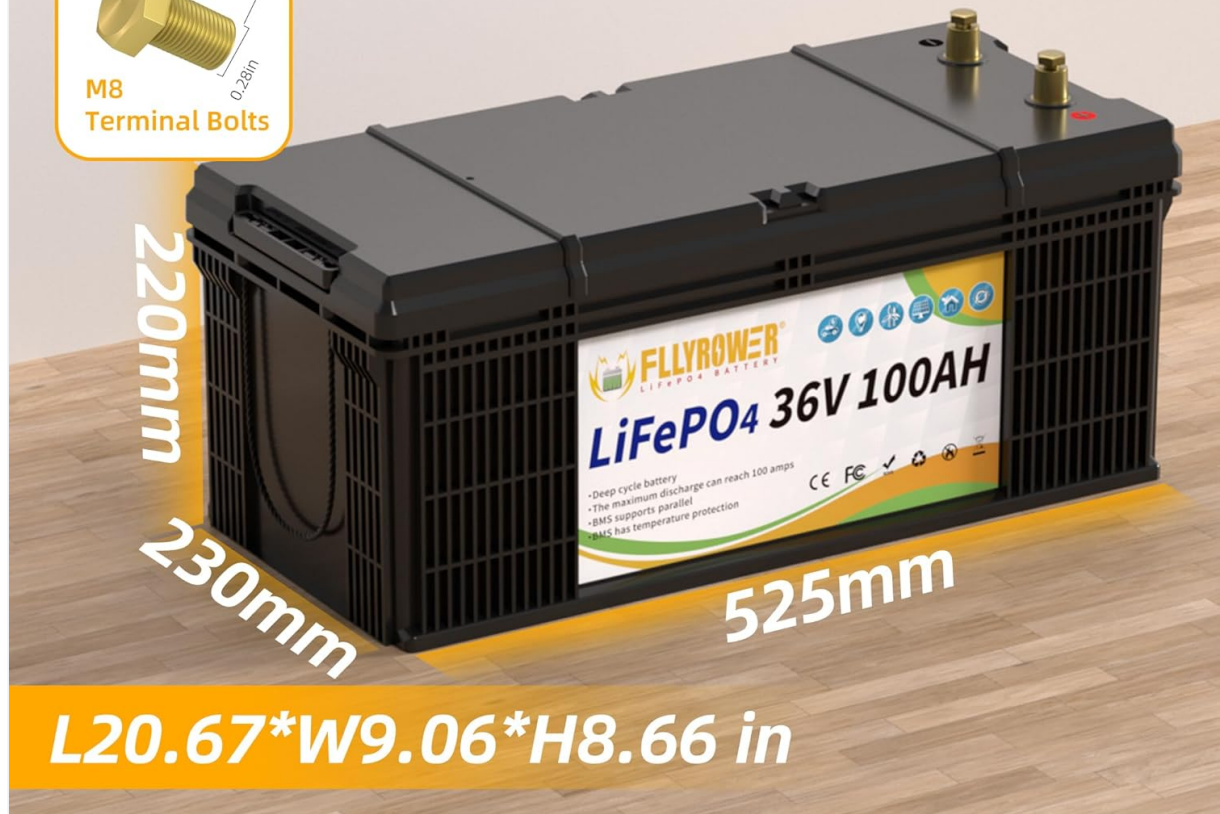
Image 4.1: Dimensions of the 36V 100AH battery and detail of the M8 terminal bolts for connection.