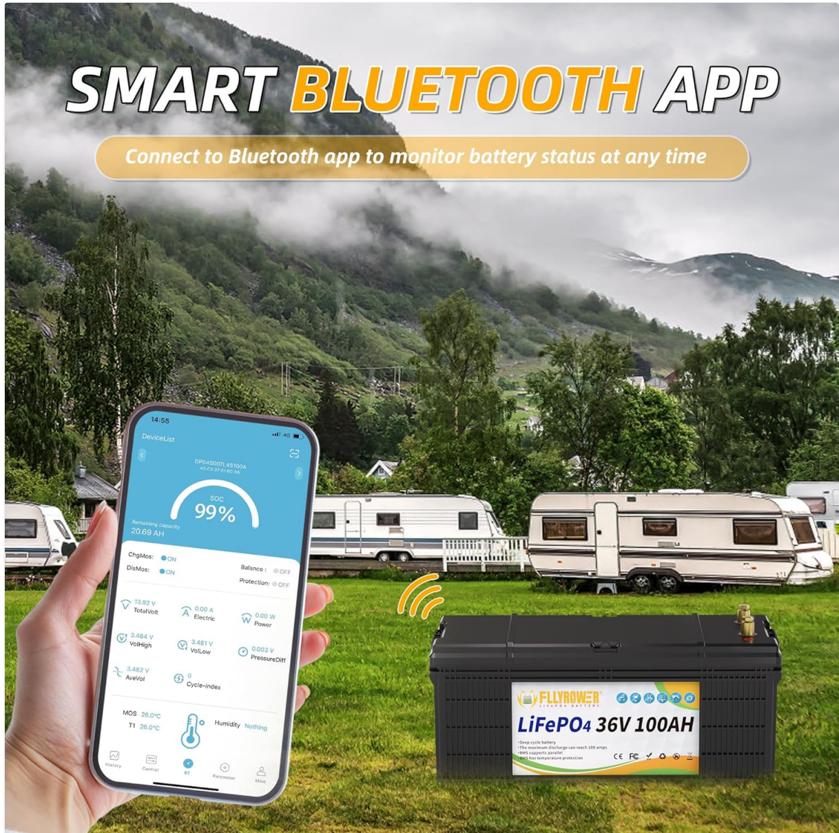
Image 5.1: A smartphone screen showing the FLLYROWER Bluetooth app interface, used to monitor battery status such as charge percentage, voltage, and protection status.

Download the FLLYROWER Bluetooth app to monitor your battery's status in real-time. The app provides information such as state of charge (SOC), voltage, current, temperature, and cycle count. This allows for proactive management of your battery's performance.