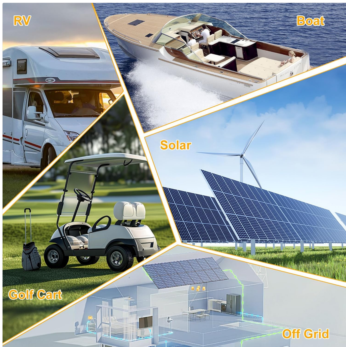
Image 1.1: FLLYROWER LiFePO4 battery applications including RV, boat, golf cart, solar, and off-grid systems.