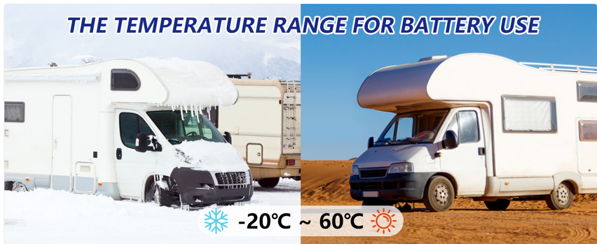
Image 6.1: Illustration of the recommended operating and storage temperature range for the battery, from -20°C to 60°C.