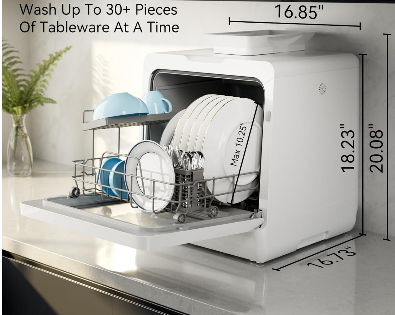
Figure 1.2: Compact size with large capacity, showing dimensions and dish placement.

Wash Up To 30+ Pieces Of Tableware At A Time