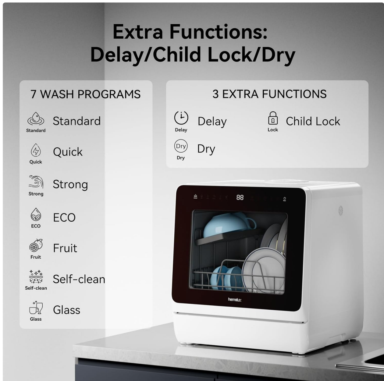
Figure 4.1: Overview of washing programs and extra functions.