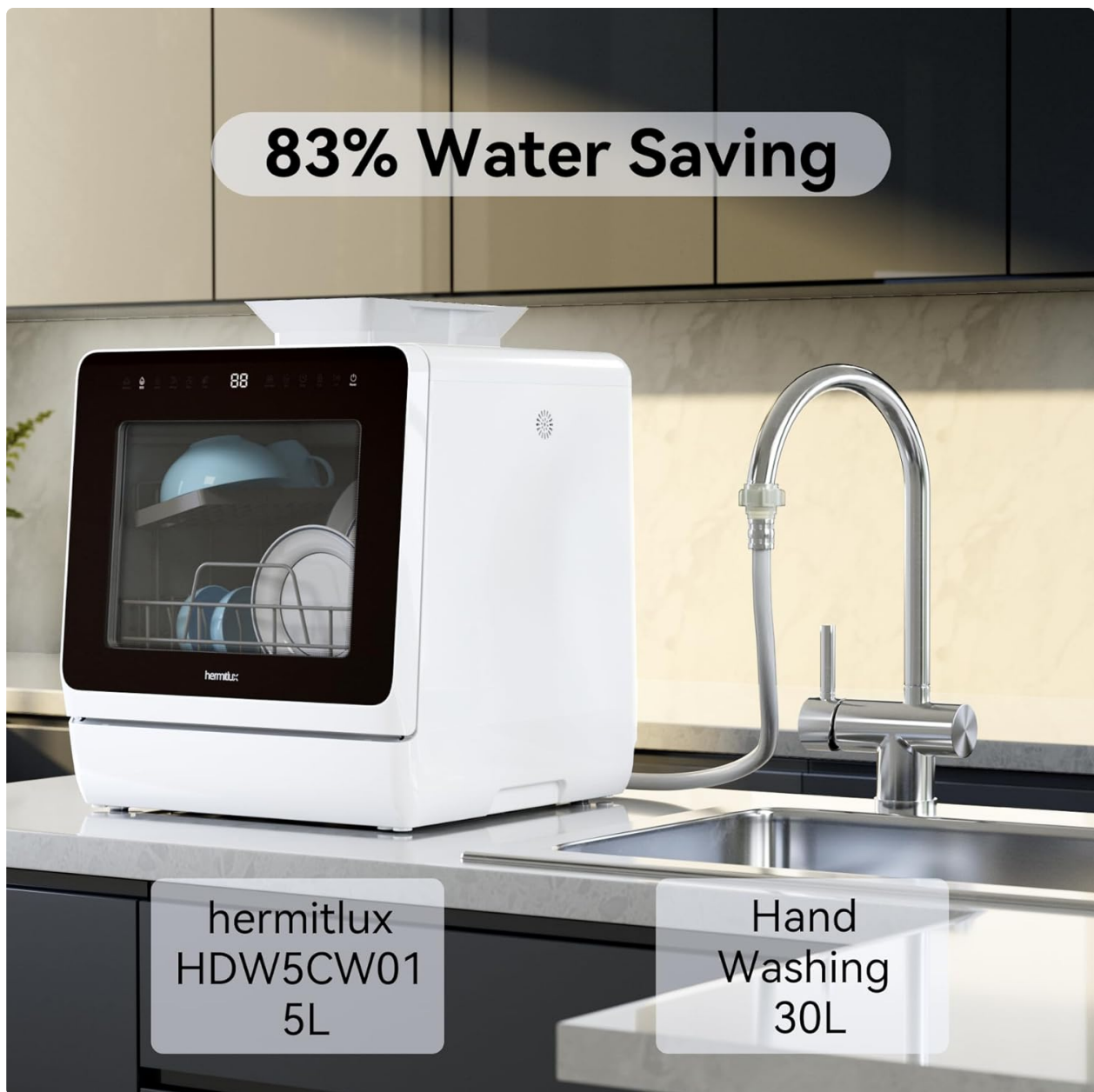
Figure 1.3: Water saving efficiency compared to traditional handwashing.