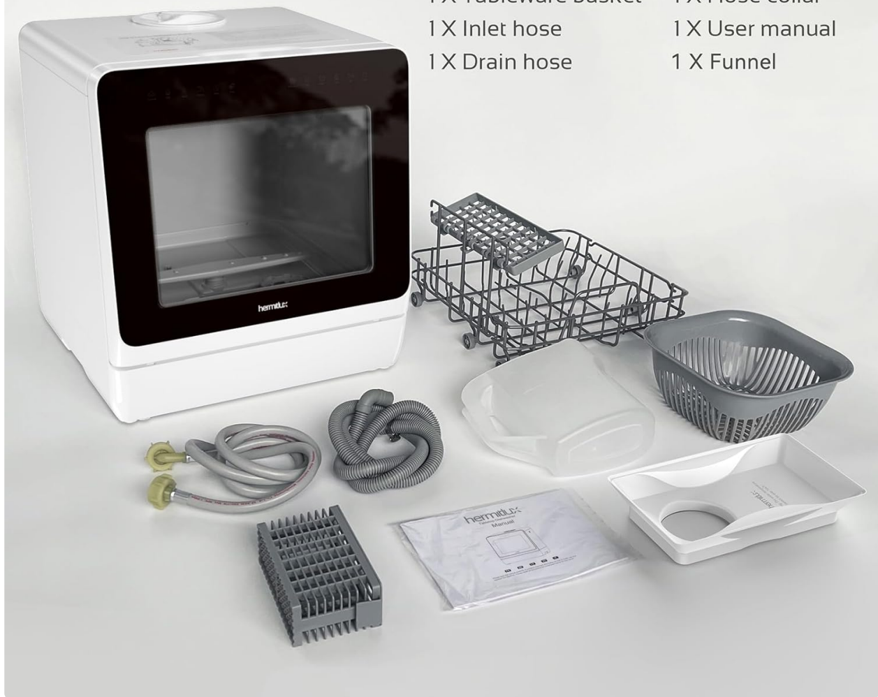
Figure 2.1: All components included in the product packaging.