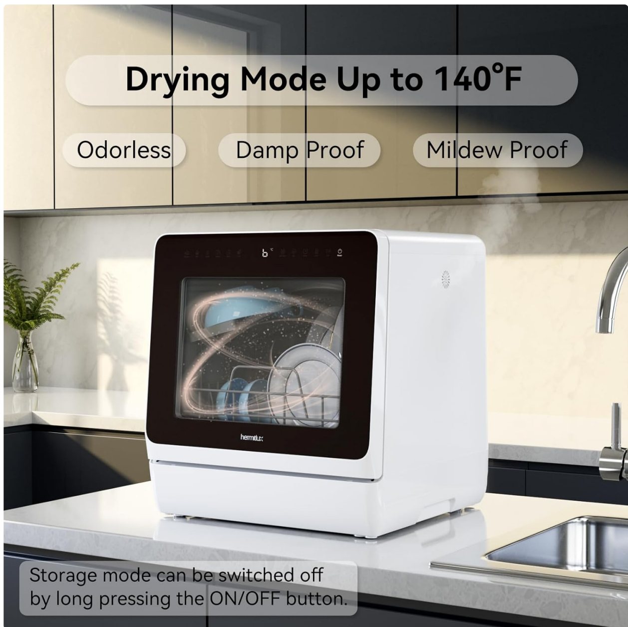
Figure 4.3: Benefits of the drying and ventilation features.