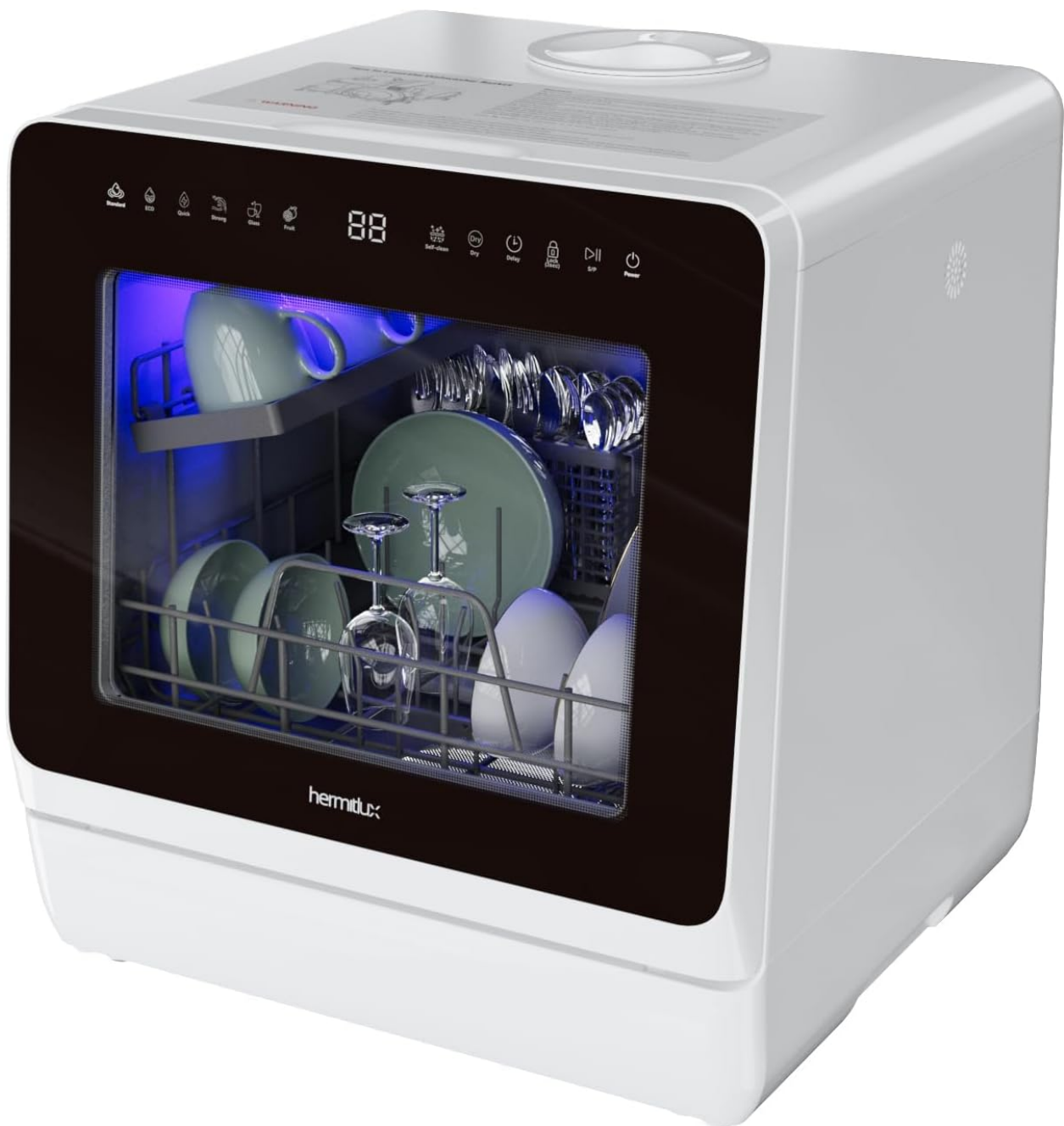
Figure 1.1: Hermitlux Countertop Dishwasher in operation.