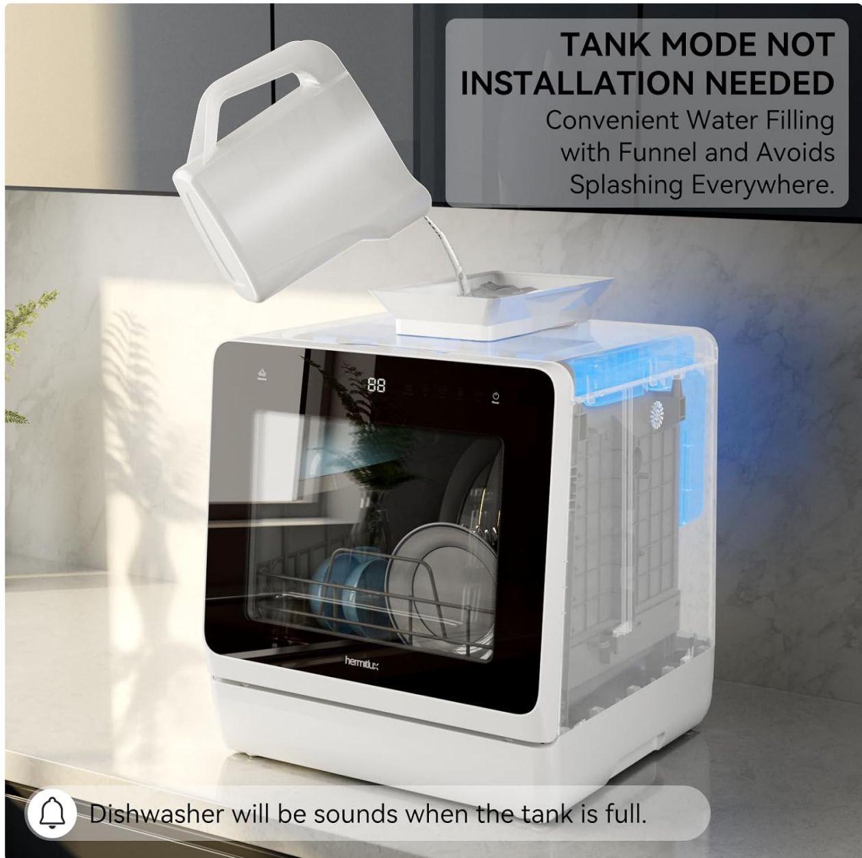
Figure 3.1: Illustration of water tank filling and faucet connection.