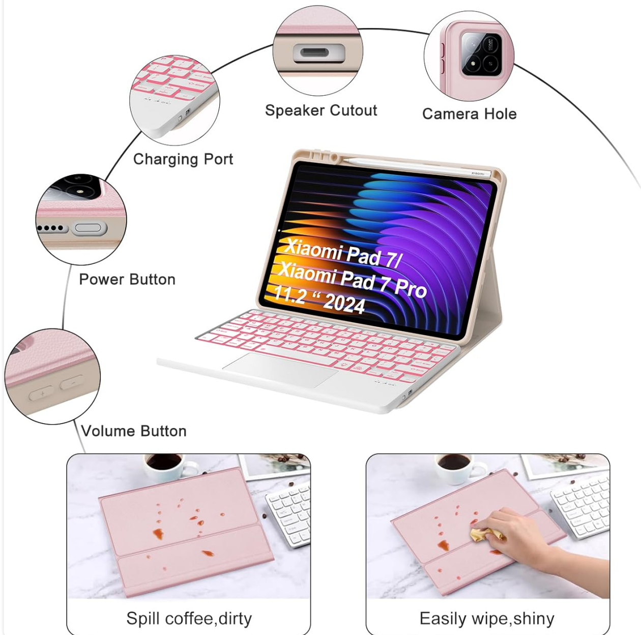
Figure 5.1: Stain-Resistant Feature.