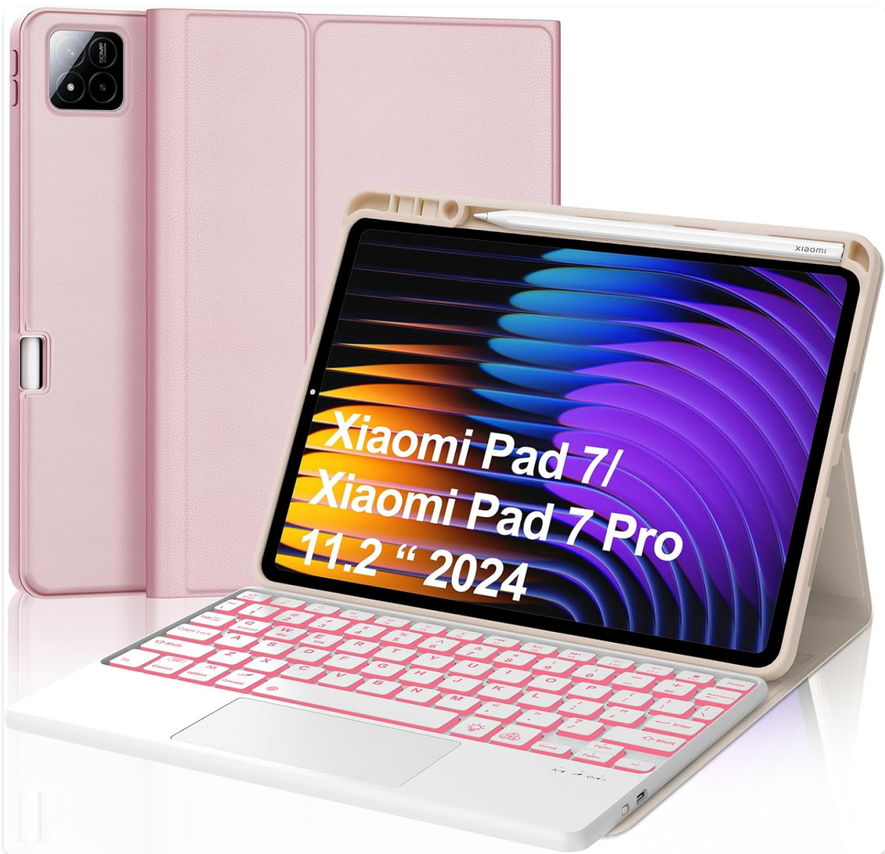
Figure 1.1: IVEOPPE Keyboard Case with Xiaomi Pad 7/Pad 7 Pro.