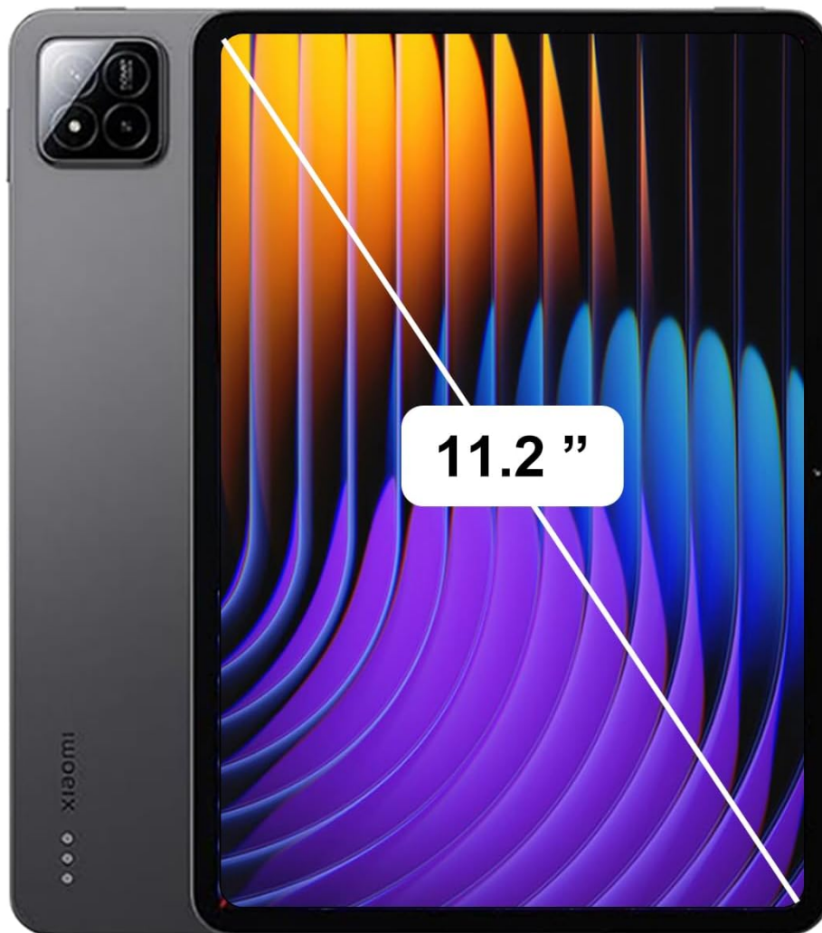
Figure 2.1: Device Compatibility for the Keyboard Case.