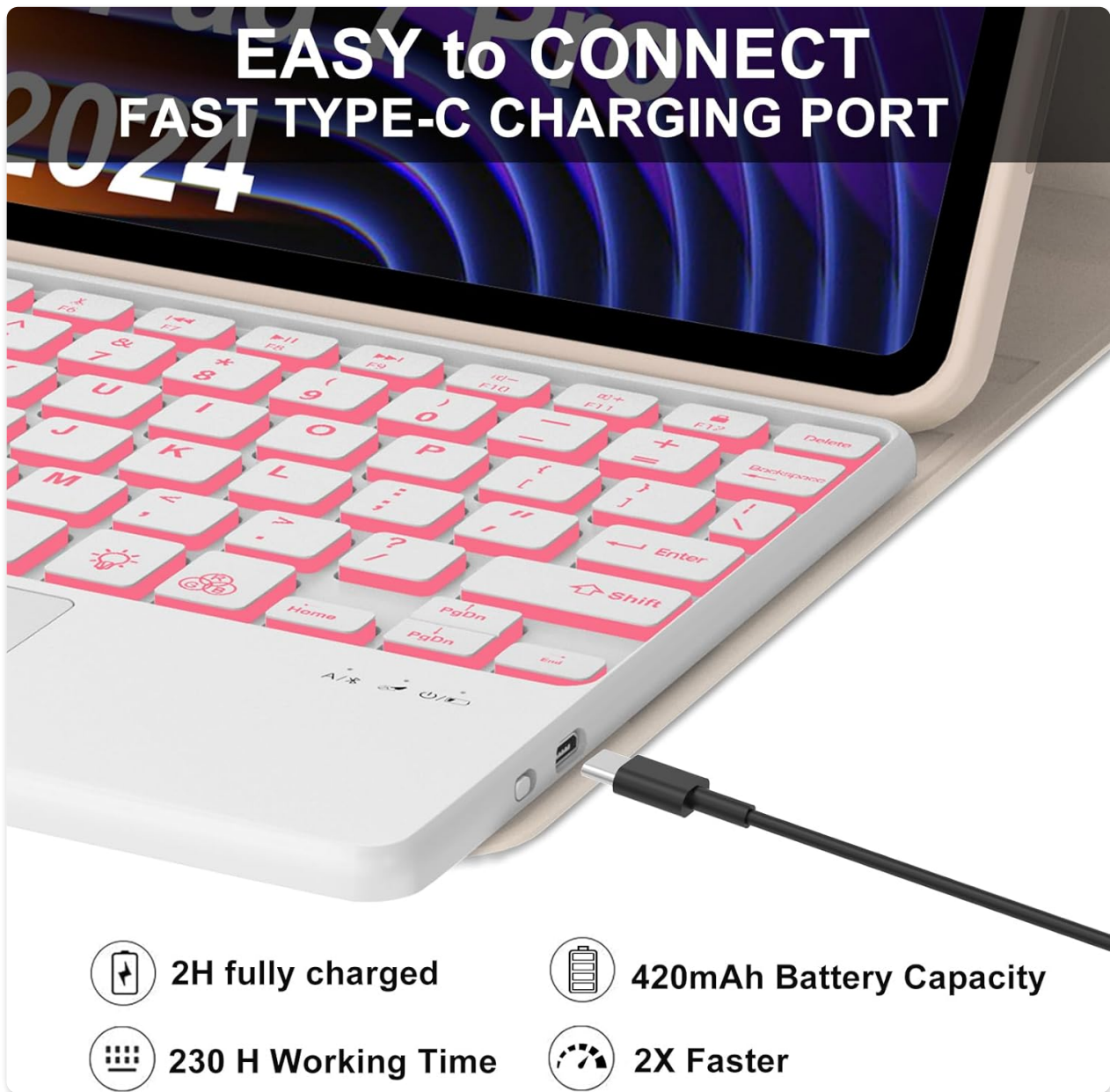
Figure 3.1: Charging the Keyboard.