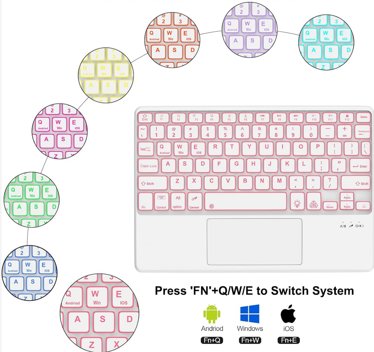
Figure 4.2: Backlit Keyboard and System Switching.