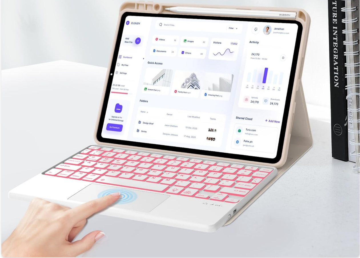
Figure 4.1: Using the Multi-Touch Trackpad.