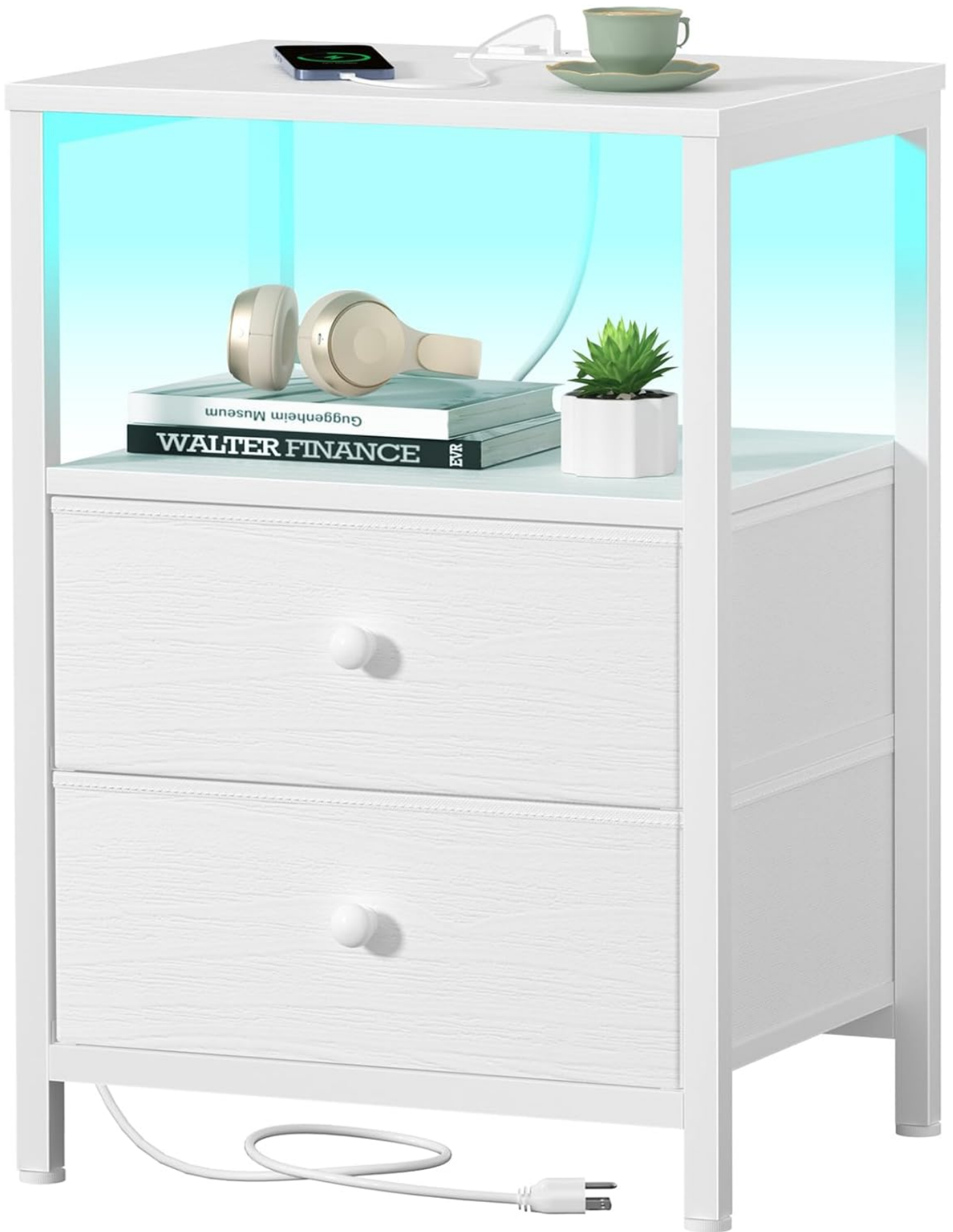
Image: The BOLUO White Nightstand, featuring LED lighting, two fabric drawers, and a top surface with a charging station.