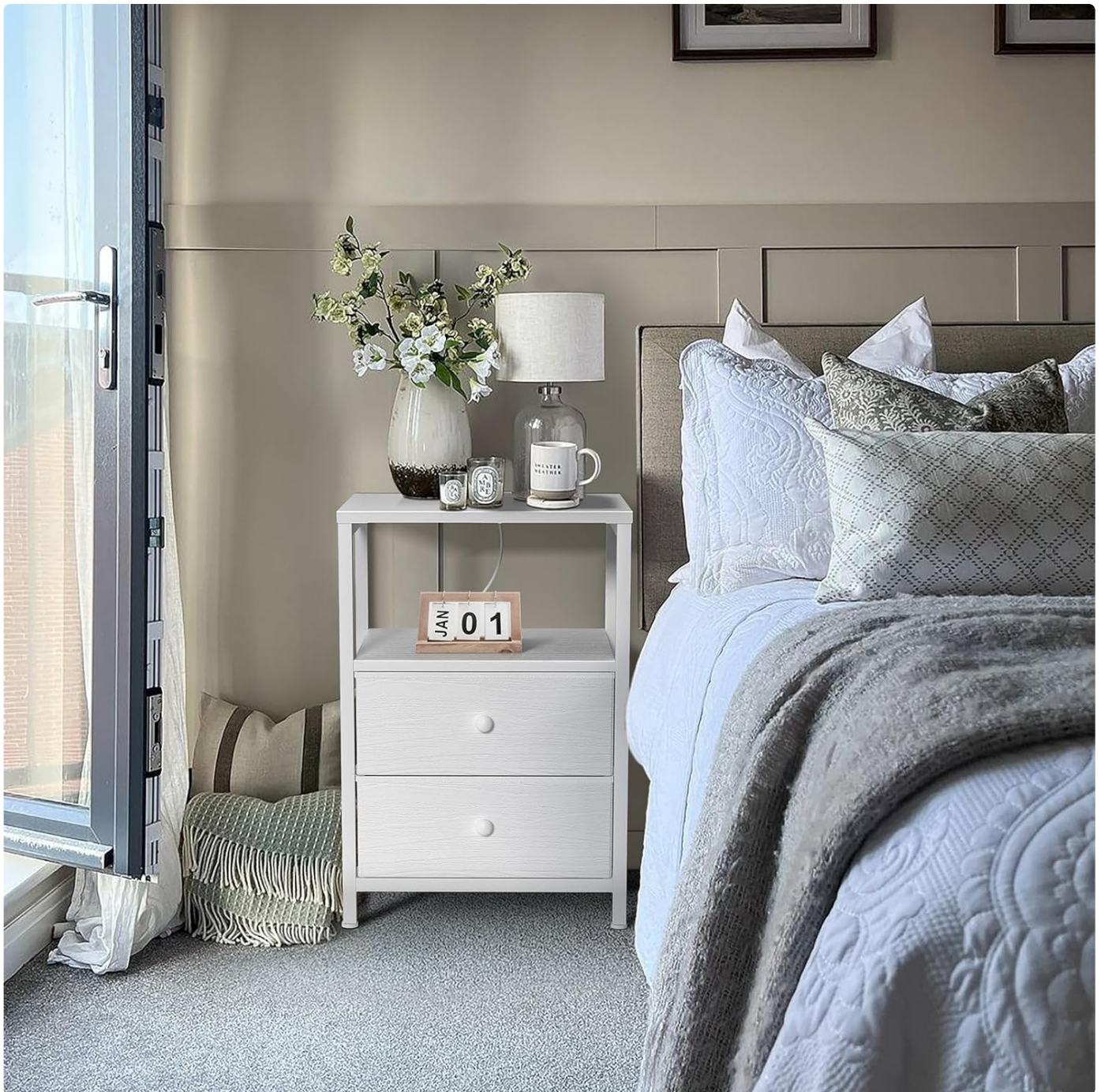
Image: The BOLUO White Nightstand positioned next to a bed in a modern bedroom, illustrating its compact size and aesthetic.