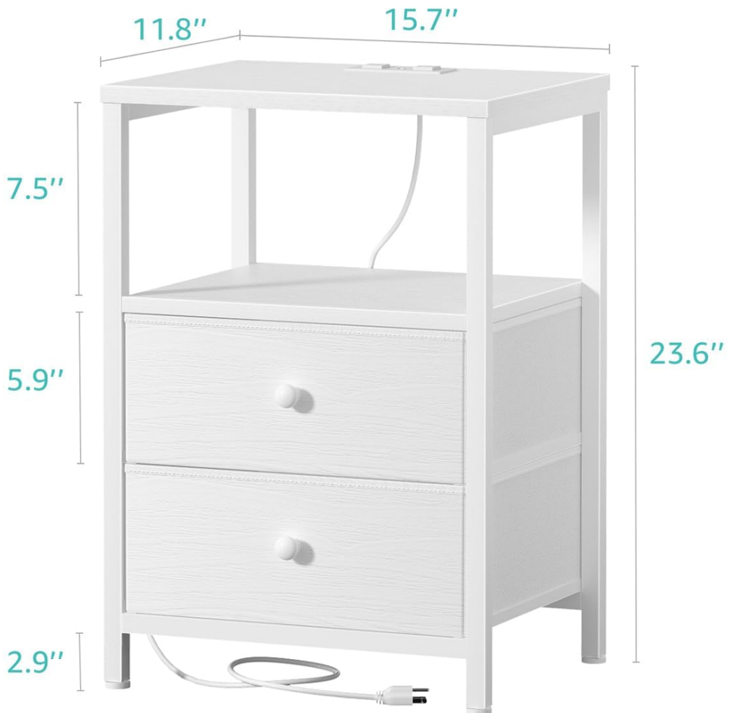
Image: A diagram illustrating the dimensions of the BOLUO White Nightstand, including height, width, and depth, along with weight capacities for the top and drawers.