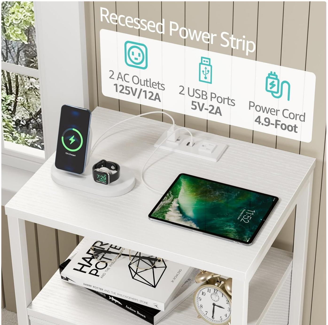
Image: A detailed view of the recessed power strip on the nightstand's top surface, showing two AC outlets and two USB ports, with devices charging.