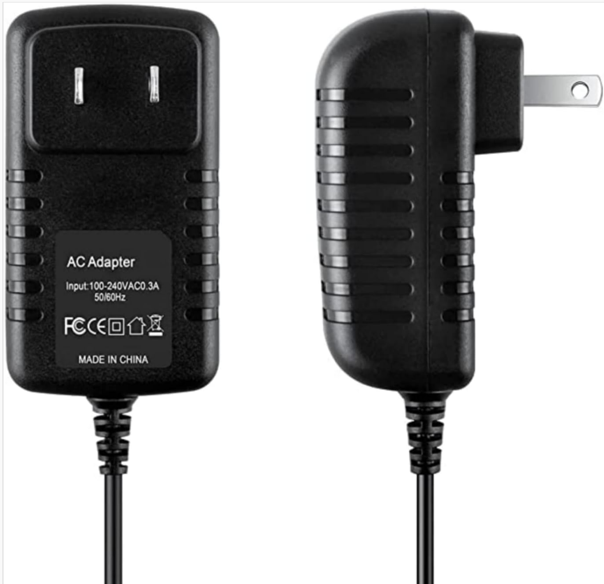
Image: Front and side view of the onerbl AC-DC adapter.