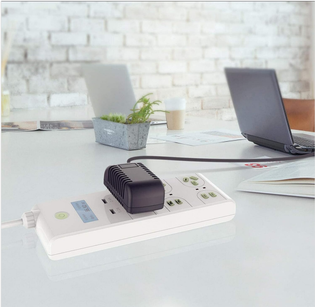
Image: The adapter connected to a power source.