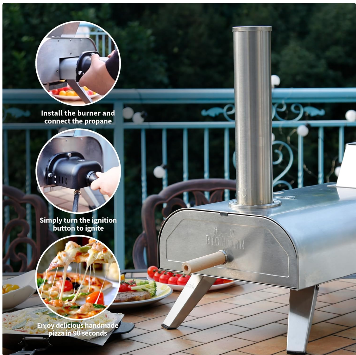
Figure 4.2: Gas burner installation and ignition steps.

Your browser does not support the video tag.