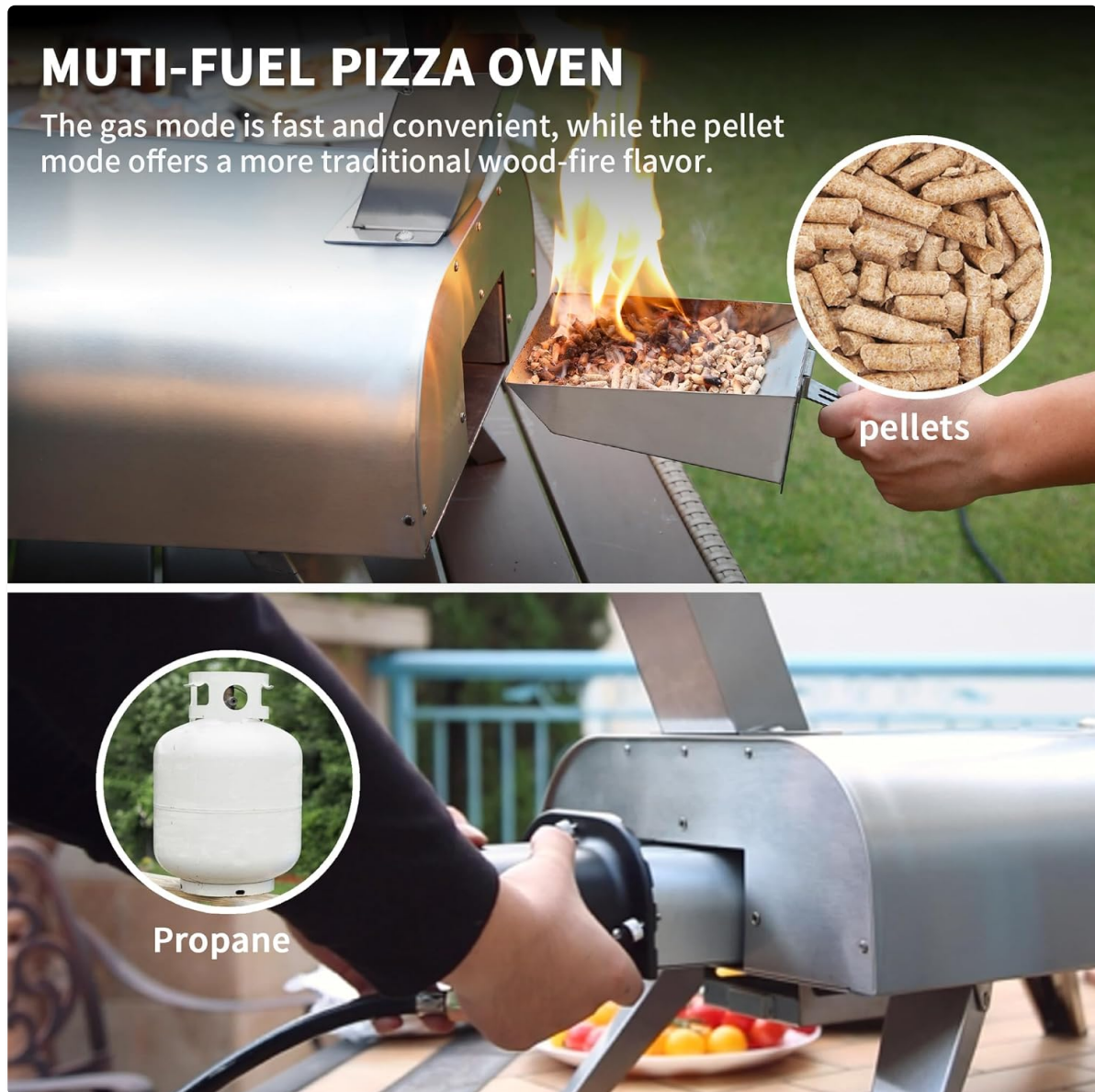
Figure 5.1: Multi-fuel options: wood pellets or propane gas.