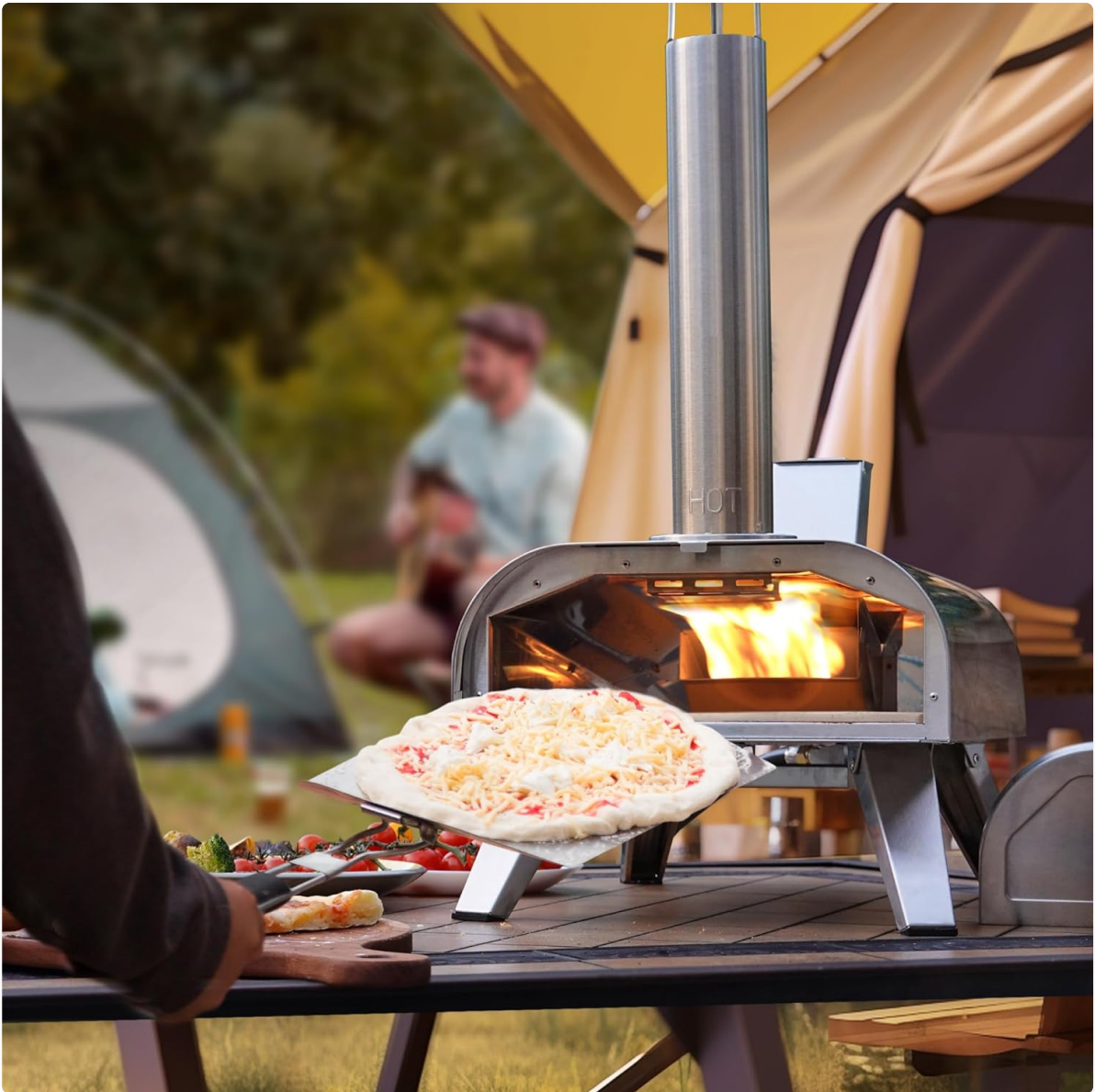
Figure 5.3: The oven's versatility for cooking various dishes.