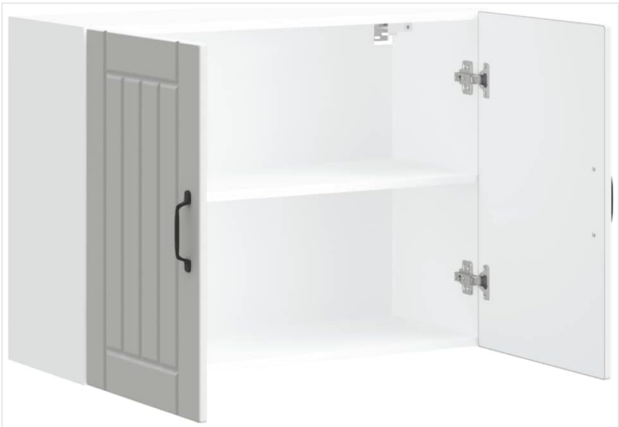
Figure 3: Interior View. The cabinet is shown with its doors open, revealing two internal shelves for storage and the robust hinges that support the doors.