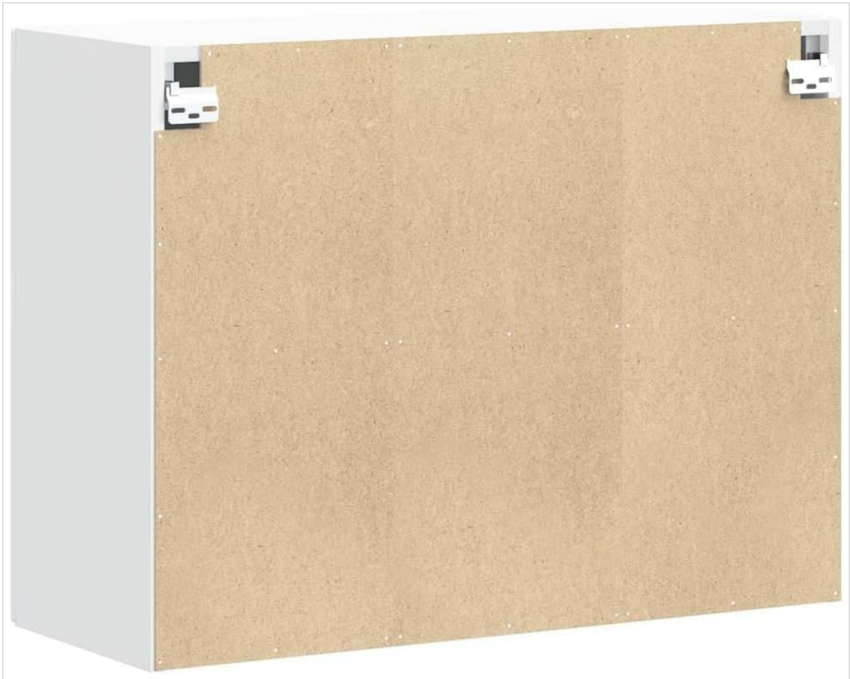
Figure 2: Rear View with Mounting Hardware. This image displays the back of the cabinet, highlighting the pre-installed brackets designed for wall attachment. Note that wall fixings are not supplied.