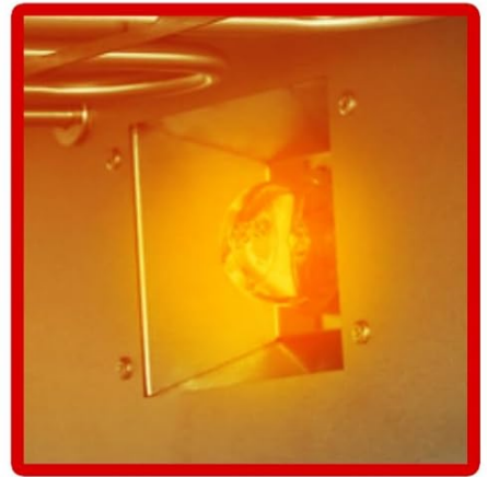
Illuminated Interior for Precision Baking