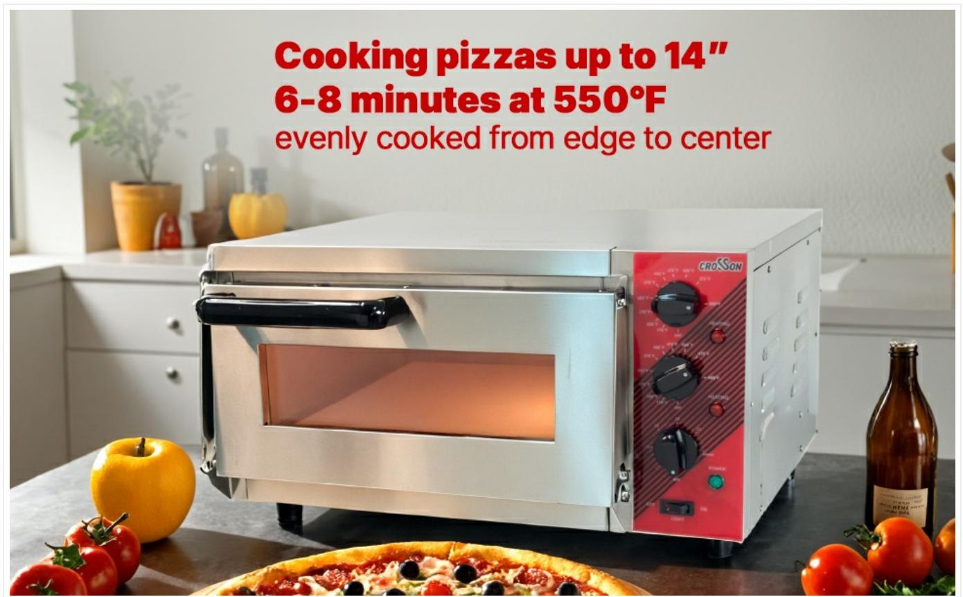
Figure 5: The oven efficiently cooks pizzas up to 14 inches, achieving even cooking from edge to center in approximately 6-8 minutes at 550°F.