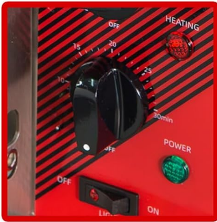
30-Minute Timer for Multitasking