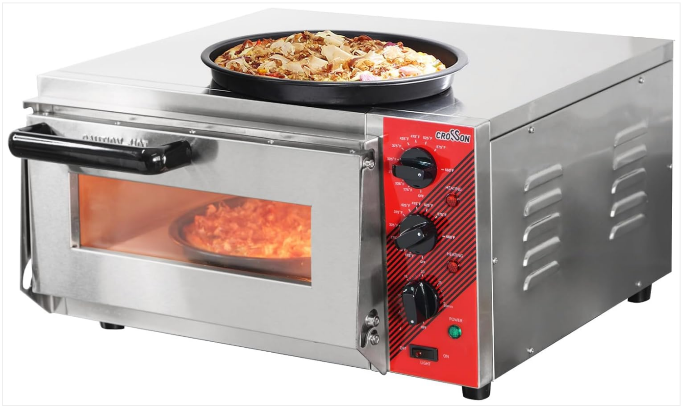
Figure 1: Front view of the CROSSON Electric 14-inch Pizza Oven. The oven features a stainless steel exterior, a glass door, and control knobs on the right side. A pizza is visible cooking inside, and another pizza is placed on top of the oven.