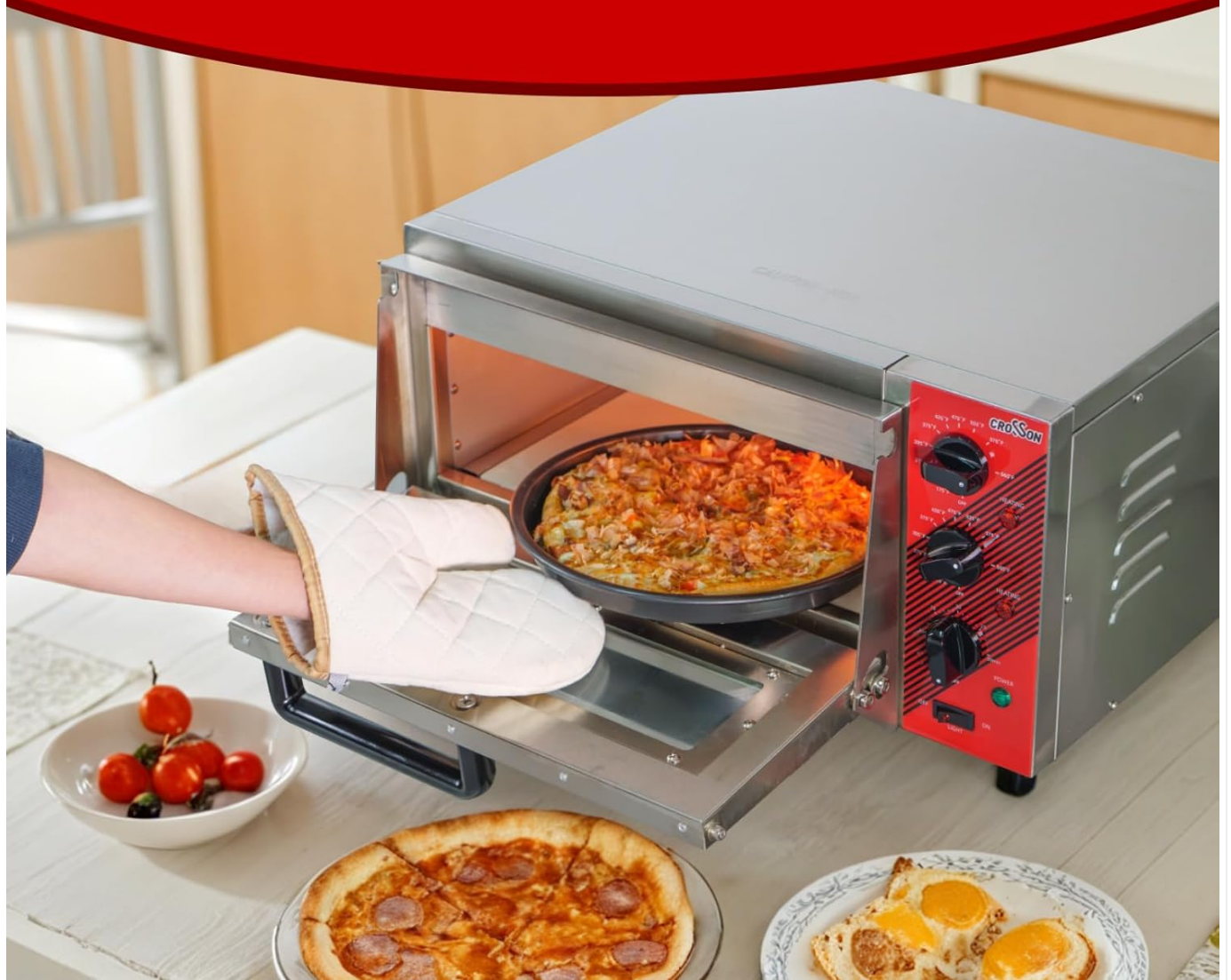
Figure 4: Carefully placing a pizza onto the pizza stone inside the oven. The oven is designed to accommodate up to a 14-inch pizza.

Accommodate up to a 14-inch pizza ensuring that every slice is cooked evenly from edge to center