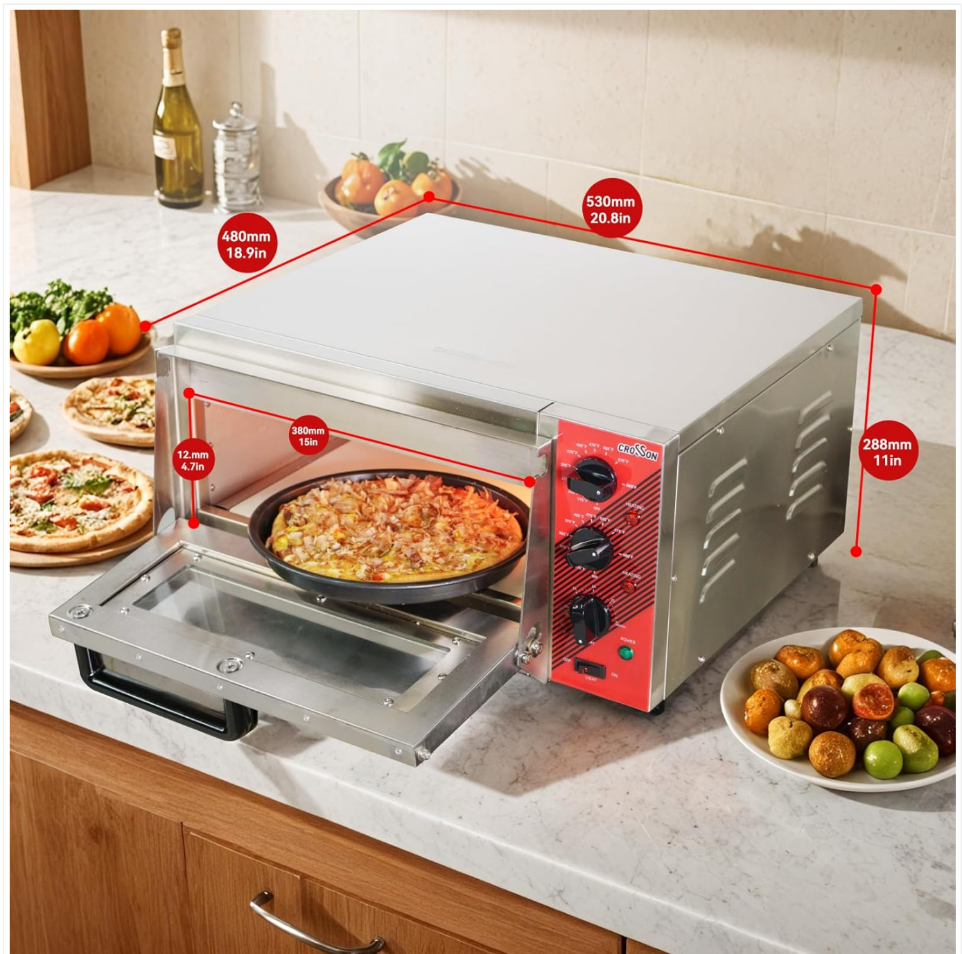
Figure 3: Product dimensions for proper placement: 19"D x 21"W x 11"H (480mm D x 530mm W x 288mm H).