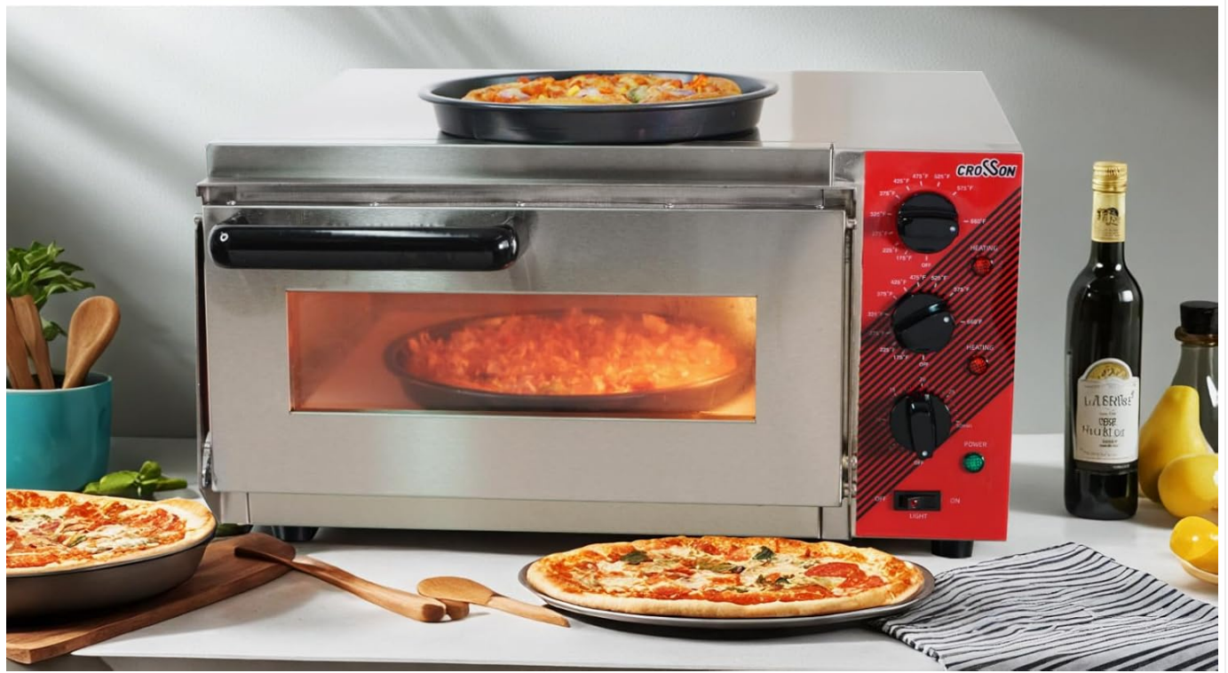
Figure 2: Detailed view of key features including the 30-minute timer knob, the dual heating elements inside the oven, and the interior light for visibility.