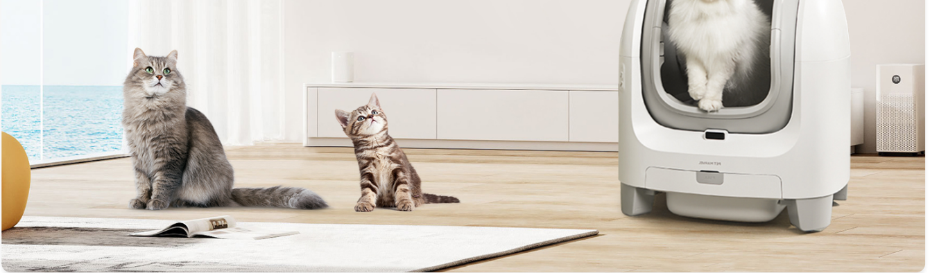
Image: PET MARVEL offers professional after-sales service and support.

Not Recommended for Pets Under 3 Months Old