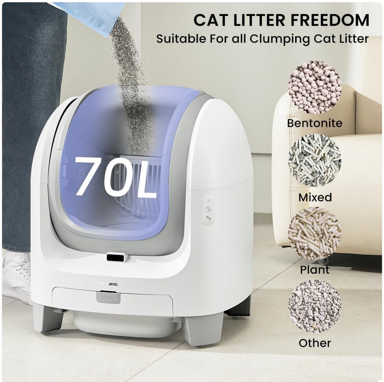
Image: The litter box demonstrating compatibility with various cat litter types.