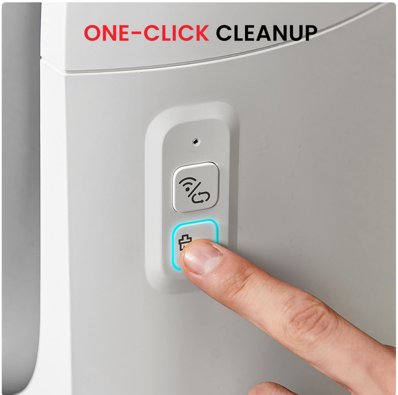
Image: Demonstrating the one-click cleanup button on the litter box.

Video: An overview of the PET MARVEL 70L self-cleaning cat litter box, showcasing its automatic cleaning capabilities and features.