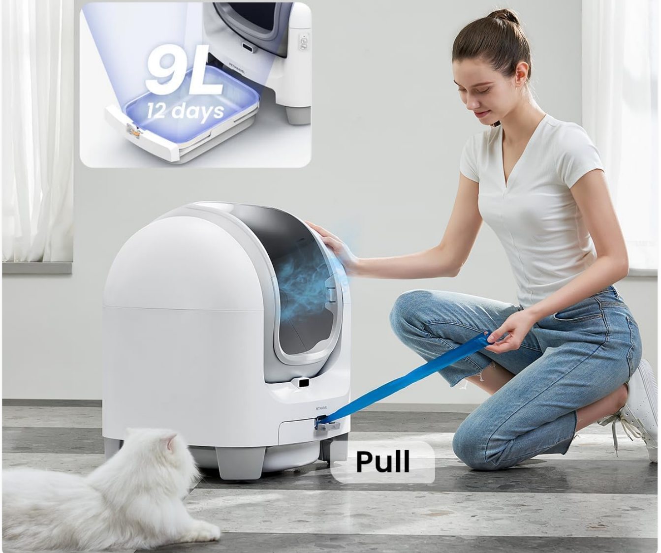
Image: The litter box highlighting its 9L litter capacity, sufficient for up to 12 days.

The 9L Large Litter Box Makes Short Trips Stress-free for Owners