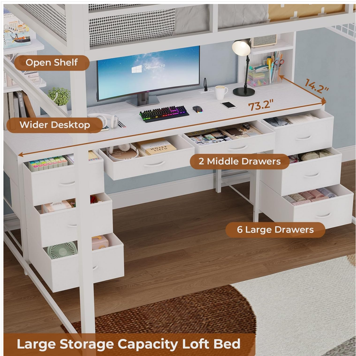
Figure 7: The large storage capacity of the loft bed, showcasing the desk and fabric drawers.