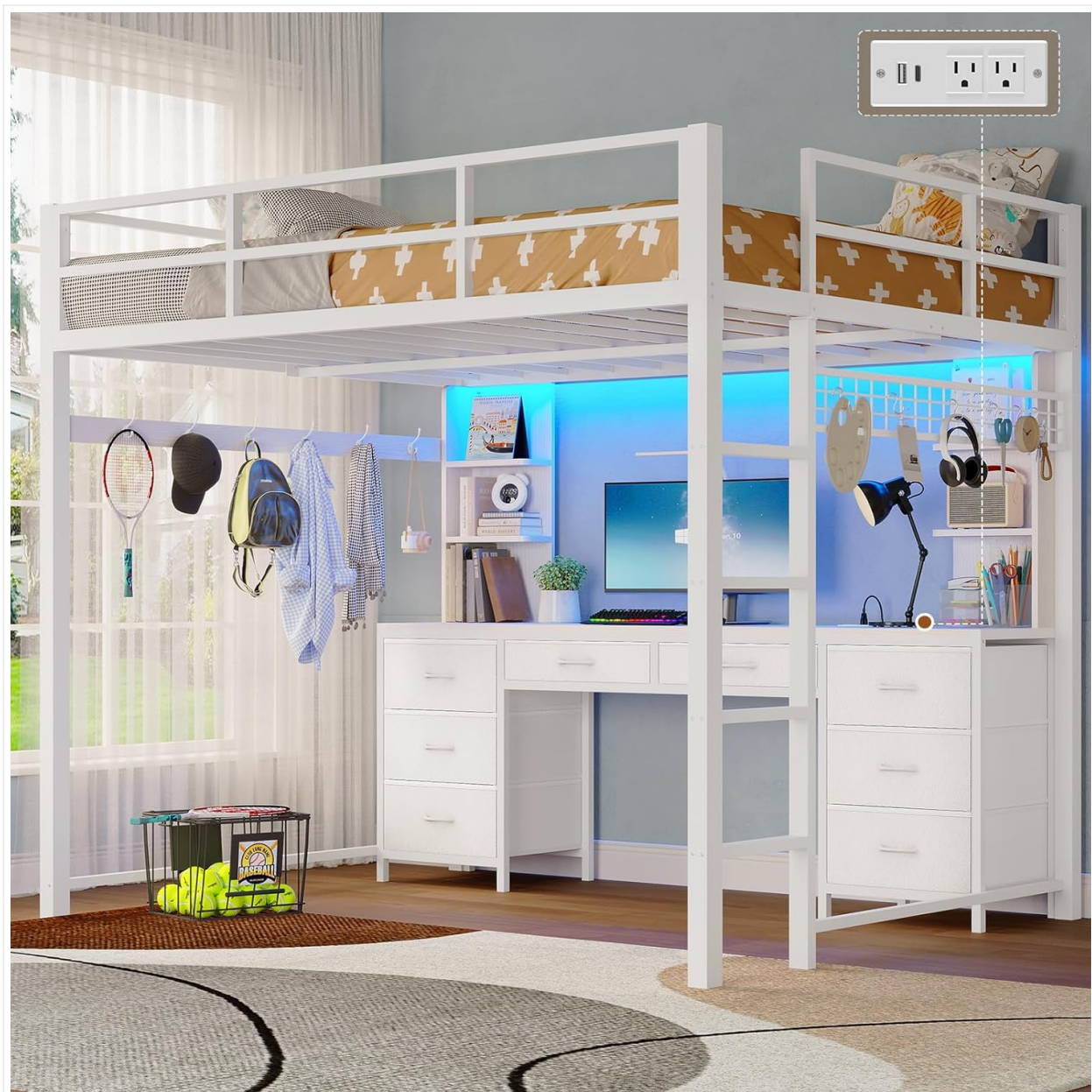
Figure 1: BTHFST Full Metal Loft Bed, Full White model.