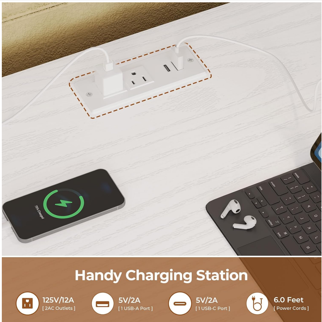
Figure 5: The handy charging station with 2 AC outlets, 1 USB-A, and 1 USB-C port.