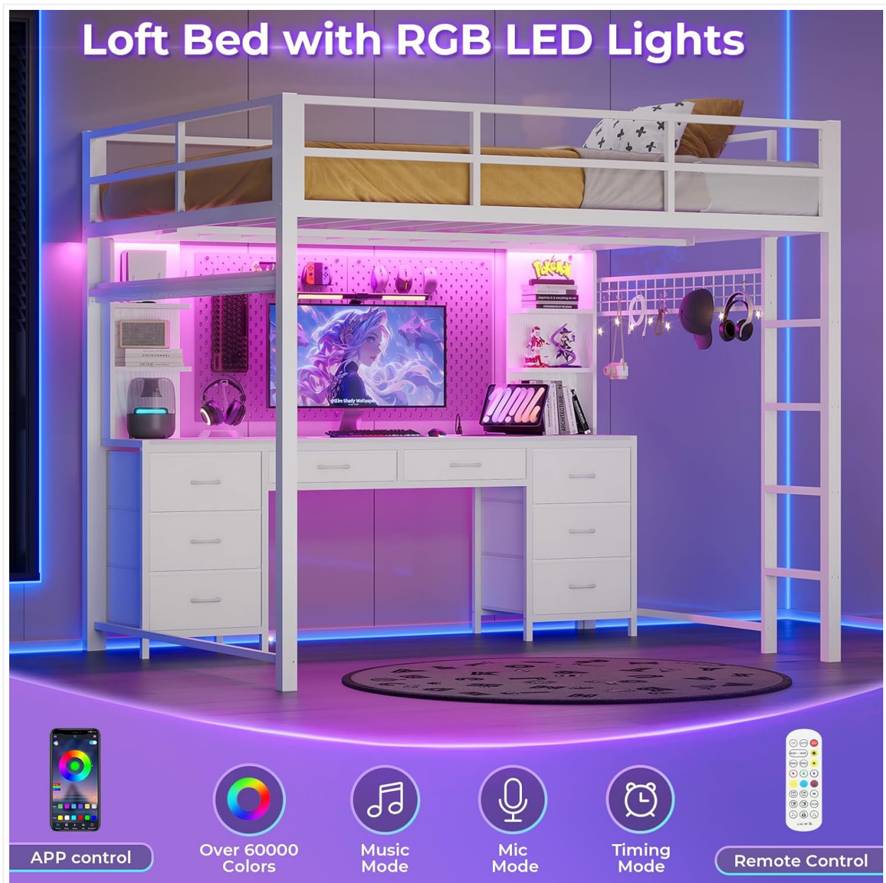
Figure 6: The loft bed featuring customizable RGB LED lights with APP and remote control.