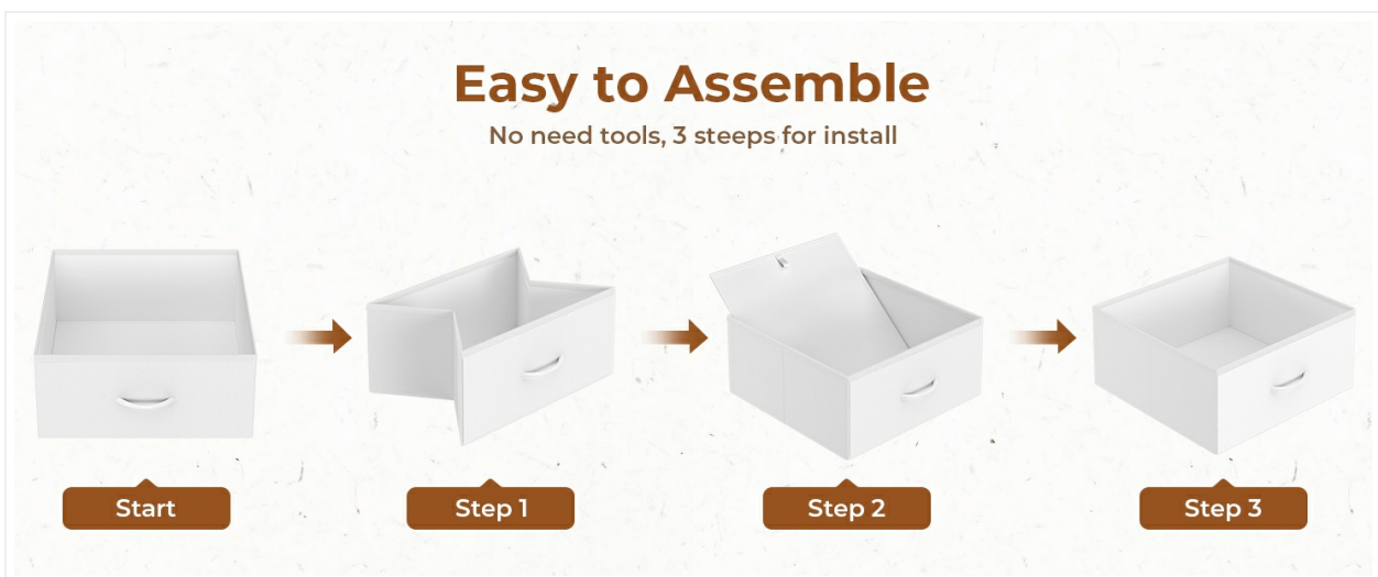
Figure 3: Simple 3-step assembly process for the fabric drawers.