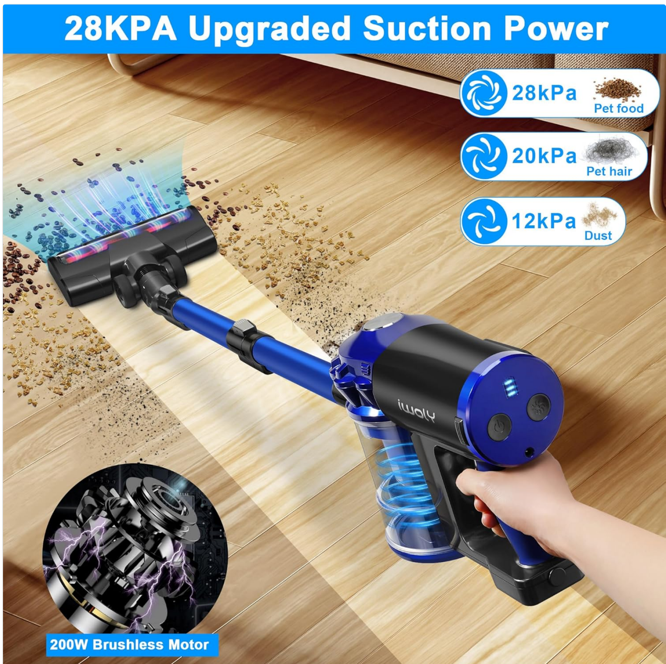
Image: A visual representation of the vacuum's suction capabilities, showing different suction levels for dust, pet hair, and pet food.

The iwoly D300 offers up to 28,000Pa of suction power in Max mode, suitable for various debris types including pet hair and fine dust.