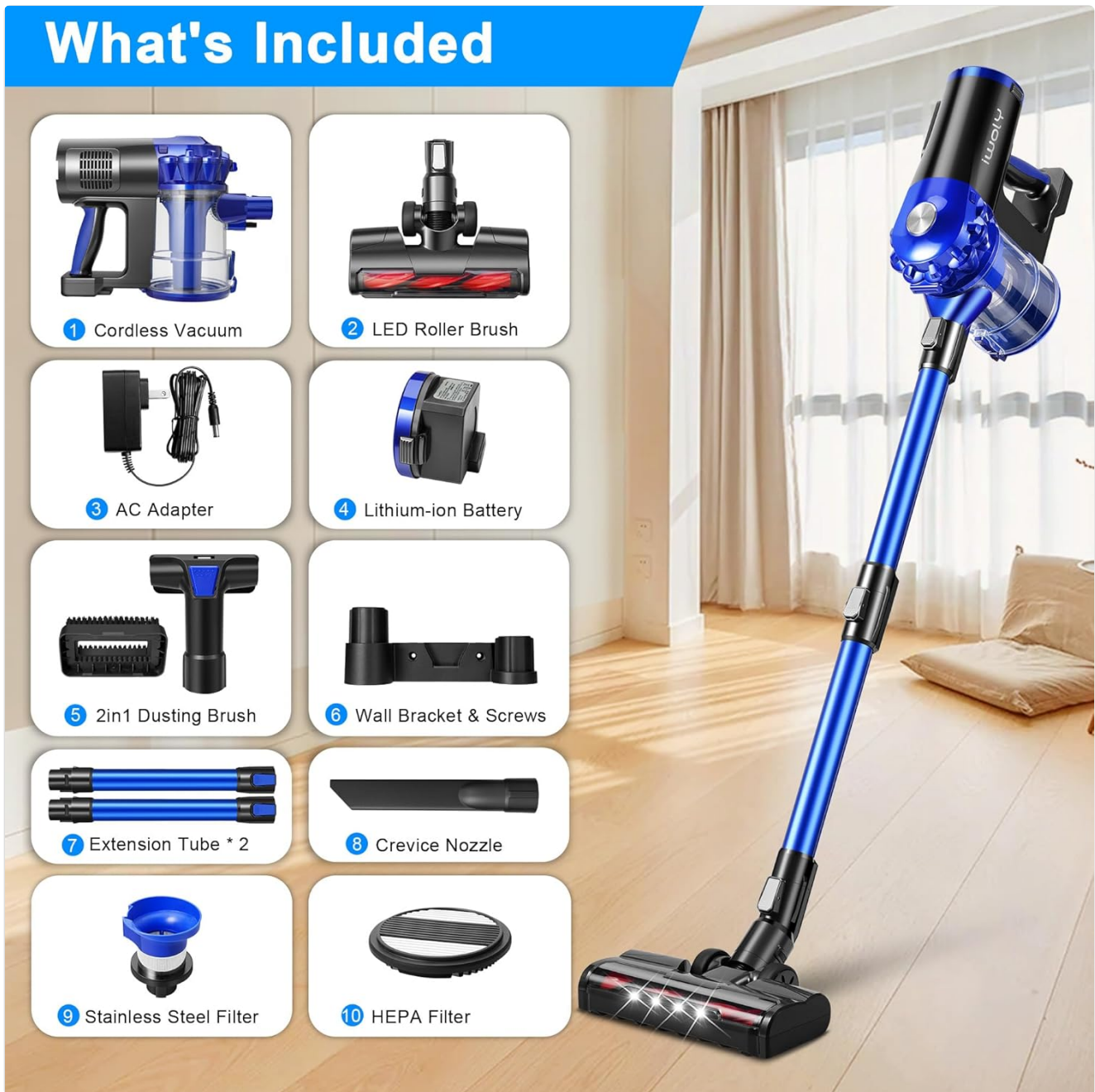
Image: A visual representation of all parts included with the iwoly D300 Cordless Vacuum Cleaner, such as the main unit, various brushes, filters, and charging accessories.