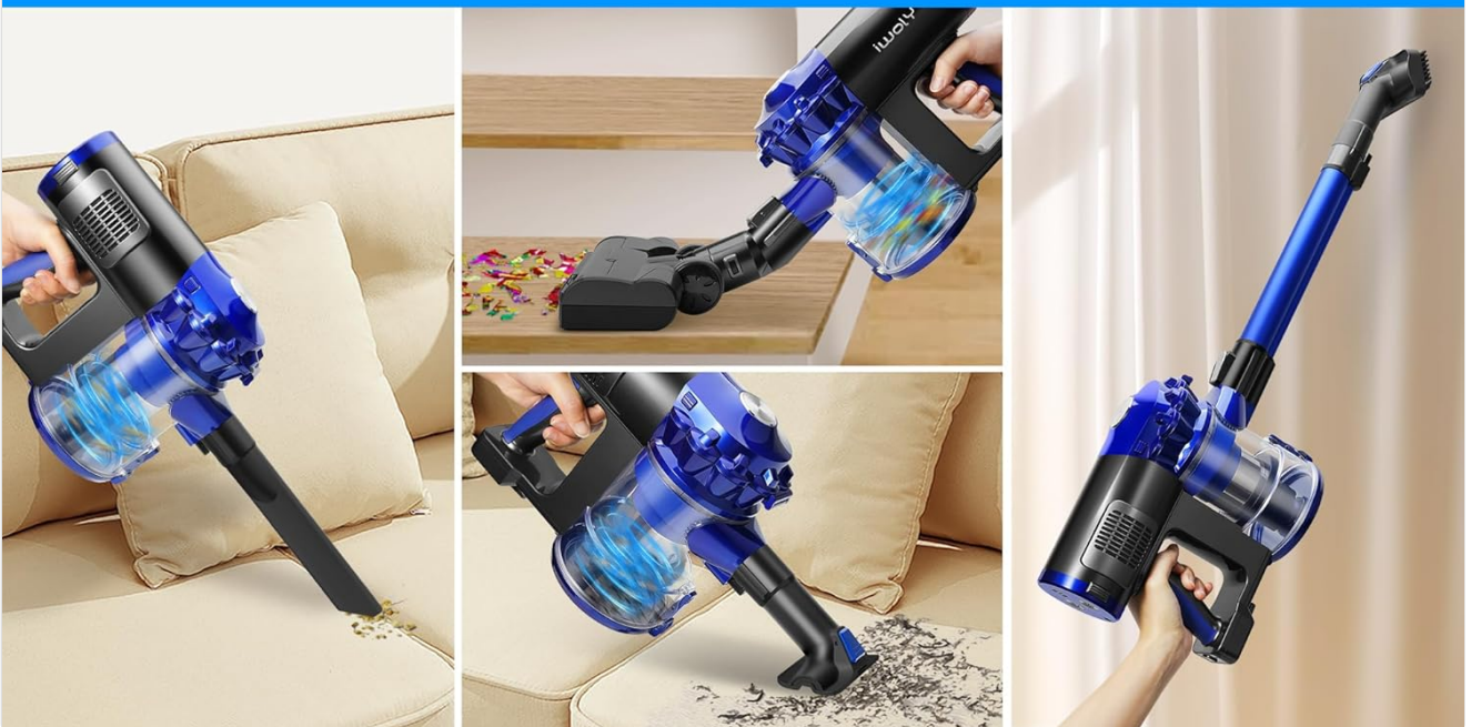
Image: The iwoly D300 in action, highlighting its LED headlights for dark areas and its use with different attachments for cleaning sofas, stairs, and general floor surfaces.

Purify Your House For A More Comfortable Life