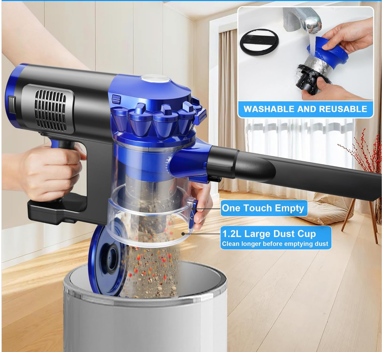
Image: A user demonstrating how to empty the 1.2L dust cup with a single touch and how to wash the components under running water.