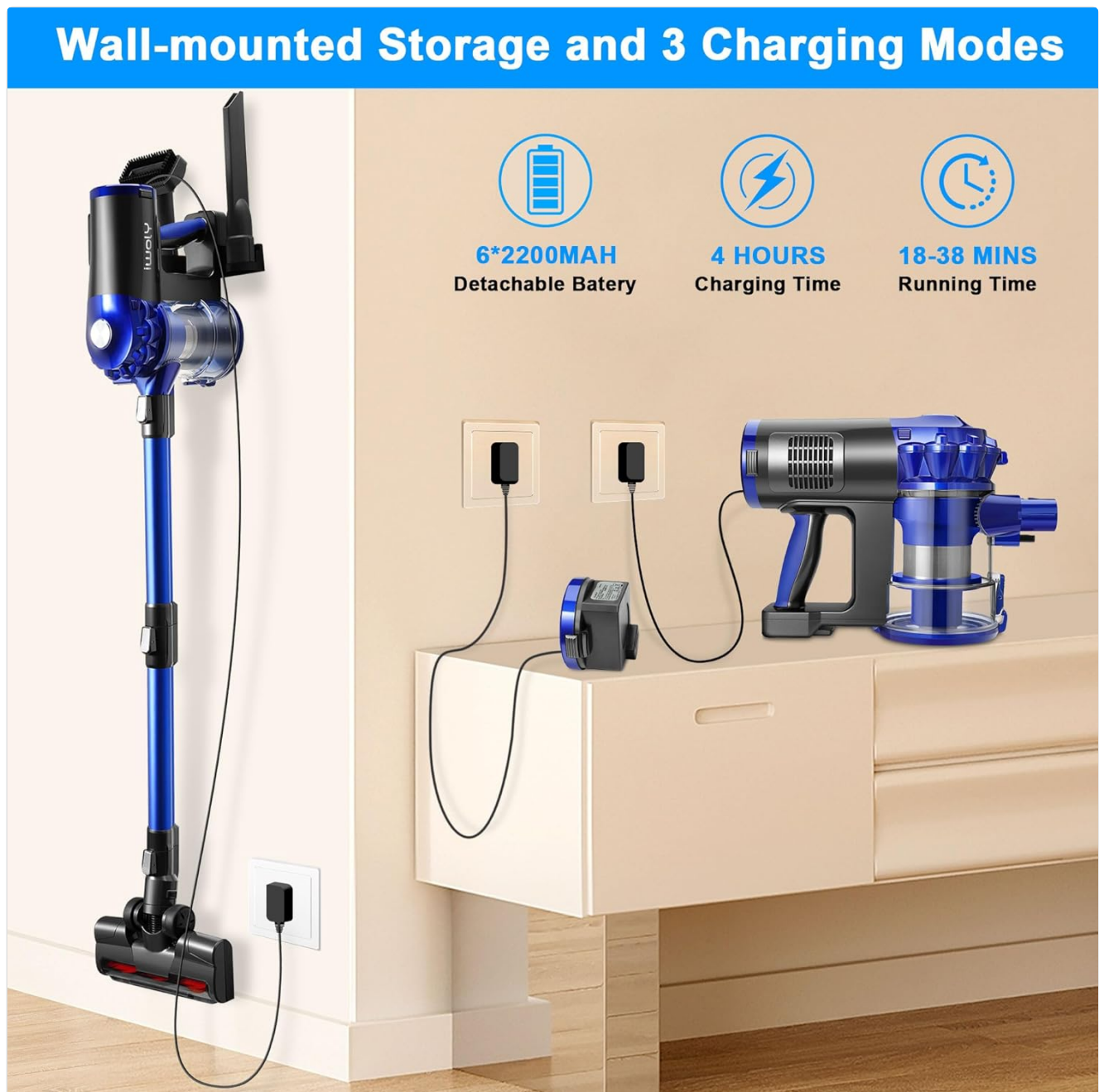
Image: The iwoly D300 vacuum cleaner stored on its wall mount, demonstrating direct charging and separate battery charging options.