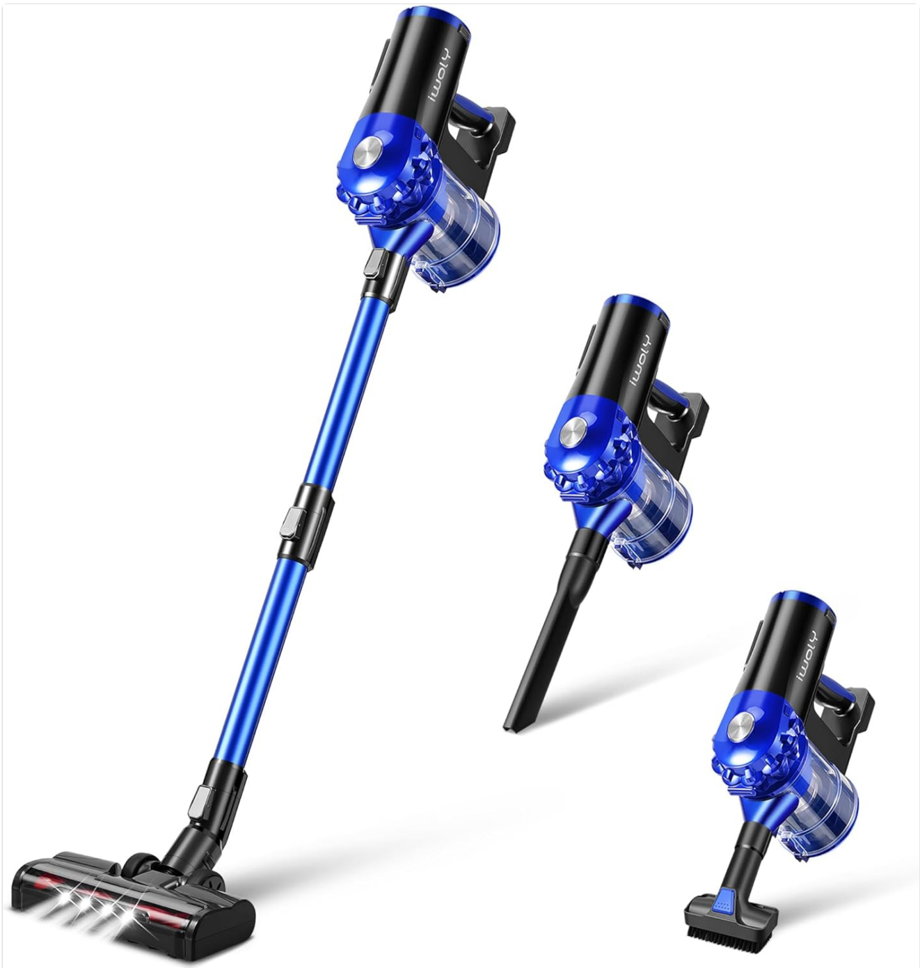
Image: The iwoly D300 Cordless Vacuum Cleaner shown in its full stick configuration and as a compact handheld unit with different attachments.