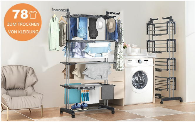
Image: Detailed view of key features including height adjustment, folding capability, rotating hanger, sock clips, lockable wheels, and stainless steel construction.