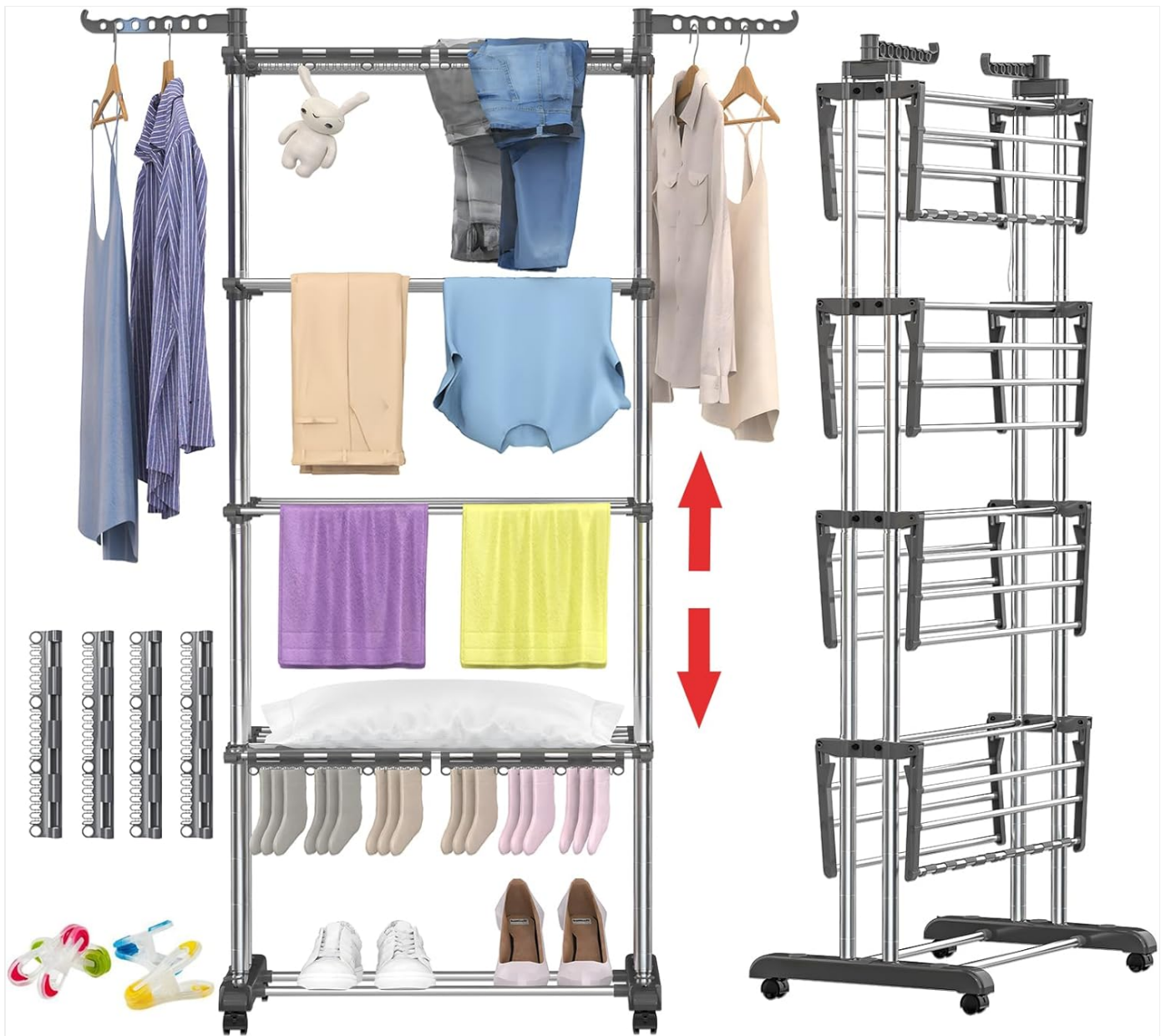
Image: The johjee 5-Tier Foldable Clothes Drying Rack fully extended and loaded with various clothing items, demonstrating its capacity and design.