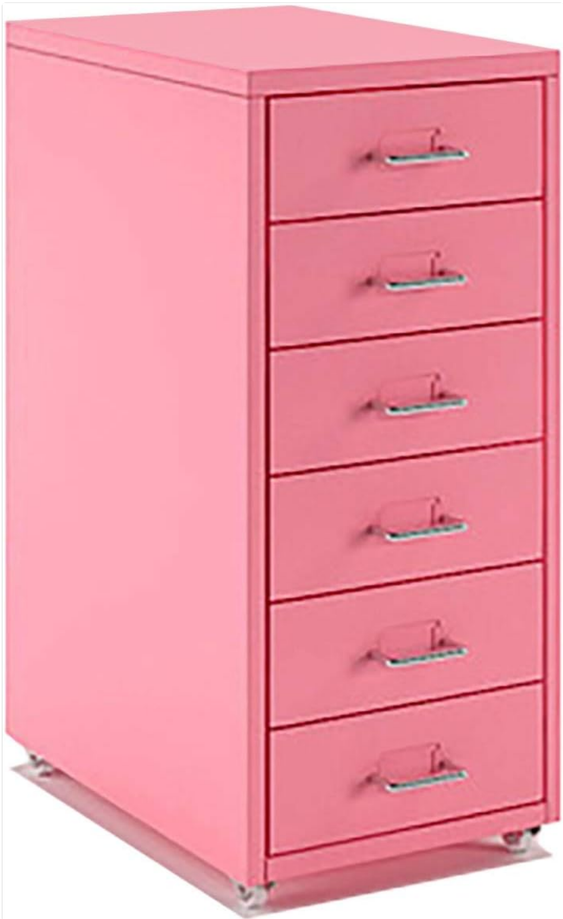
Image: Front view of the pink metal cabinet with six drawers, highlighting its sleek design and integrated wheels.