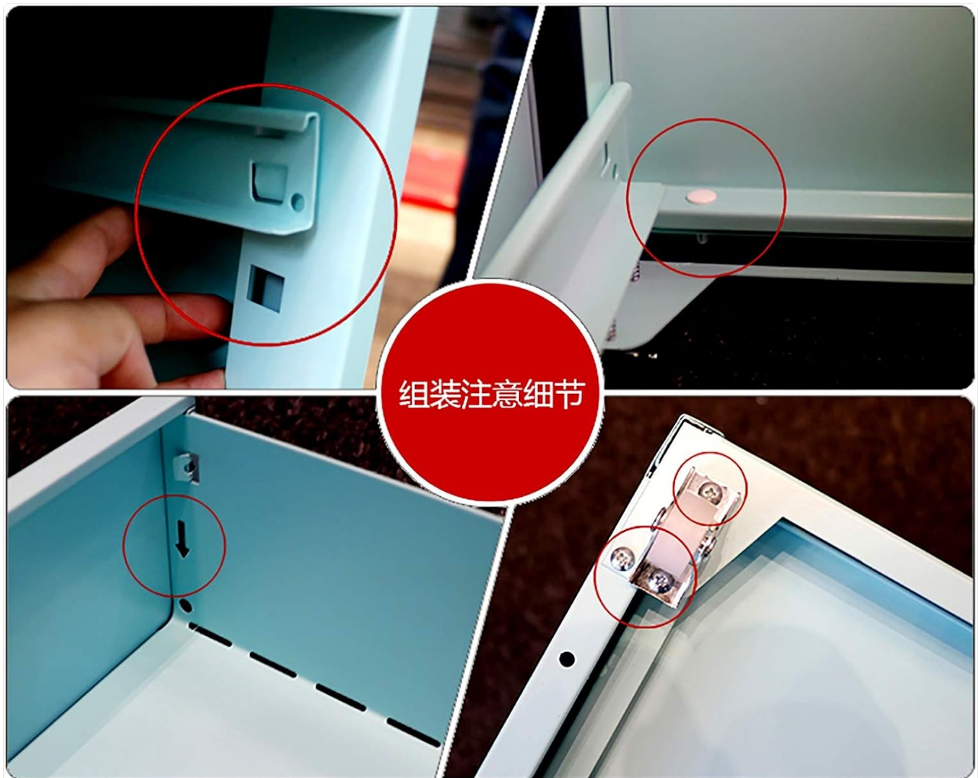
Image: Detailed view of the anti-drop (01) and anti-sinking (02) buckles located within the drawer mechanism, ensuring drawer stability.

The cabinet is equipped with anti-drop and anti-sinking buckles to prevent drawers from accidentally falling out or tilting when fully extended. These features are typically pre-installed.