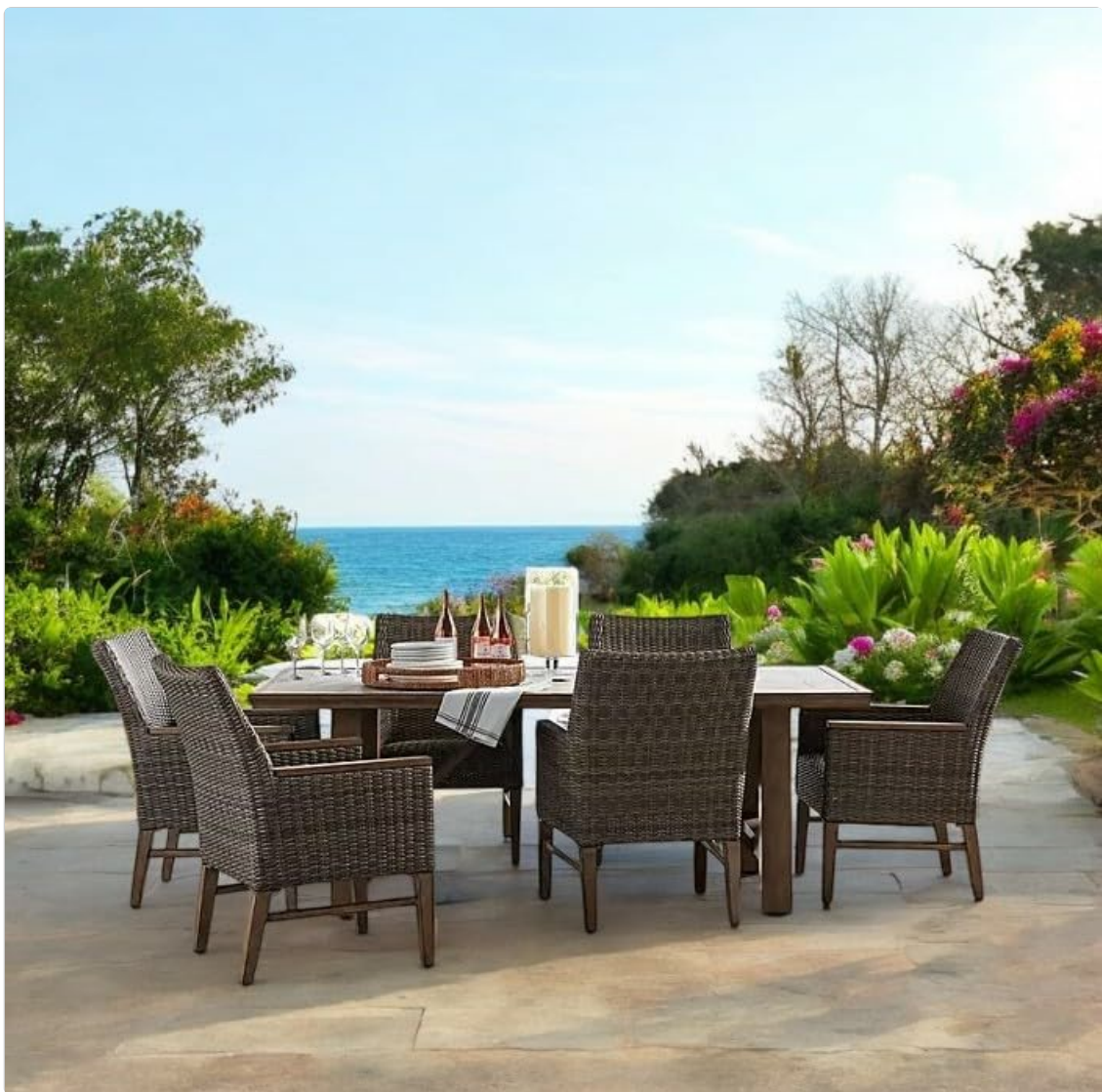
Image: The complete 7-piece outdoor dining set, featuring a rectangular table and six chairs, set up in an outdoor patio area.