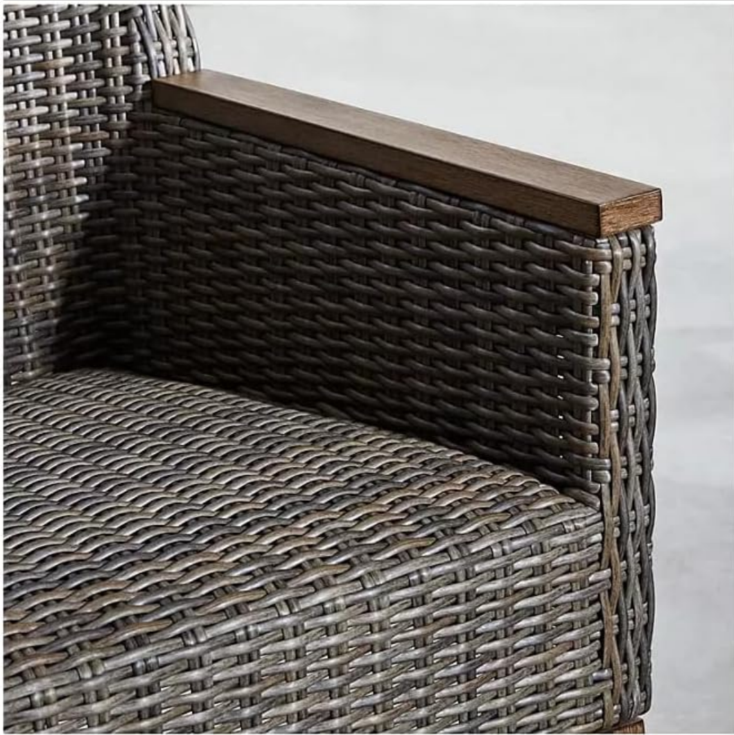
Image: A detailed view of a chair's armrest, highlighting the woven wicker texture and the smooth wooden top of the armrest.