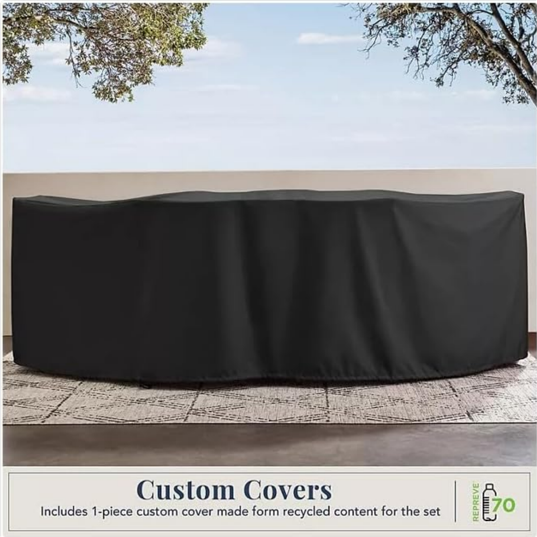
Image: The 7-piece dining set fully covered by its custom-fit black protective cover, designed to shield it from the elements.