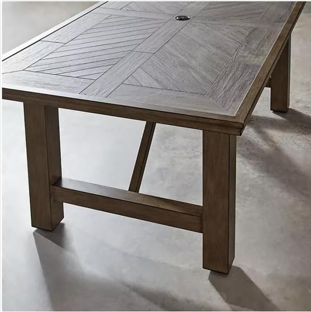
Image: A close-up view of the dining table's surface, showcasing its wood-grain pattern and the central umbrella hole with a decorative cover.