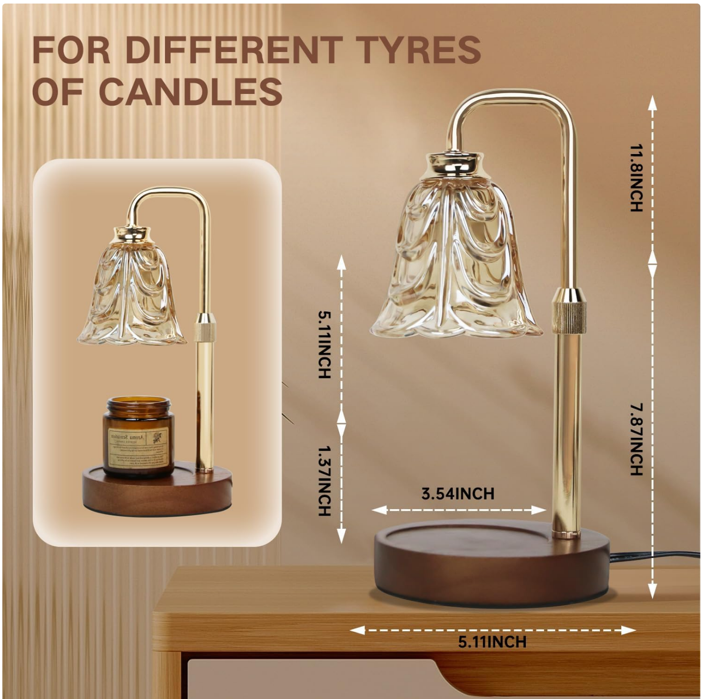
Image: Technical drawing illustrating the dimensions of the candle warmer lamp.