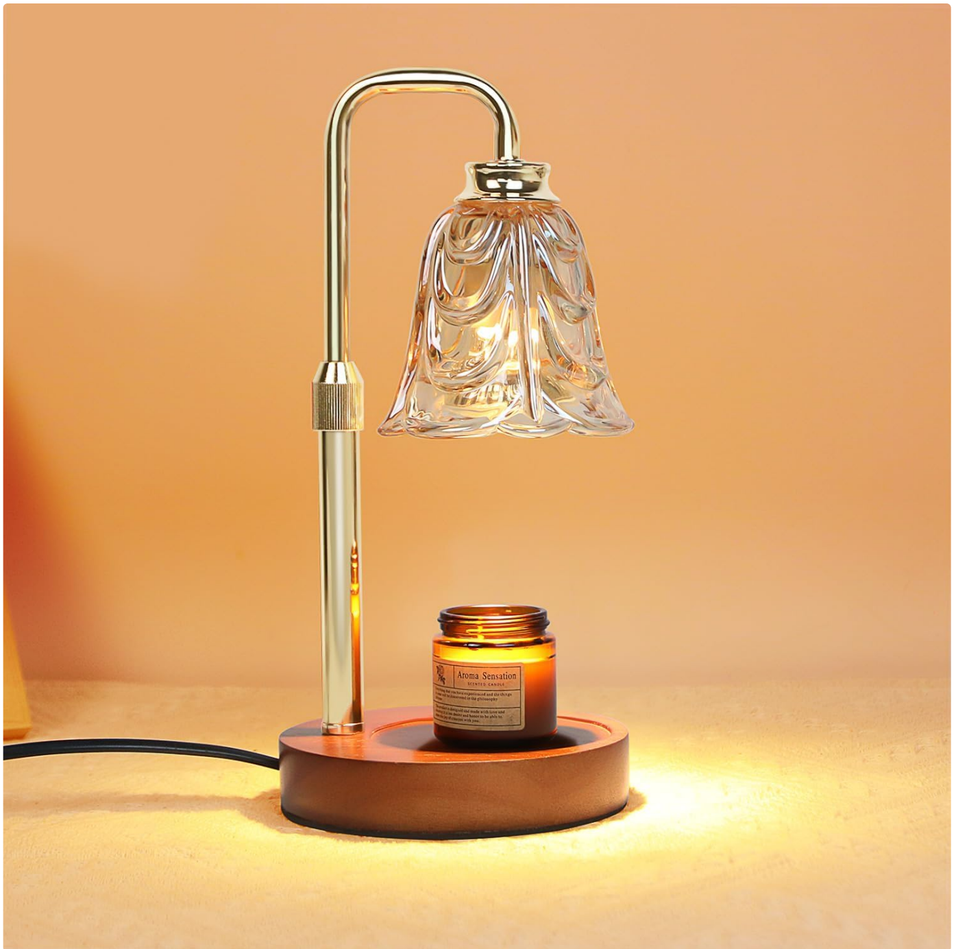
Image: The Droyek Candle Warmer Lamp set up with a candle, demonstrating proper placement.