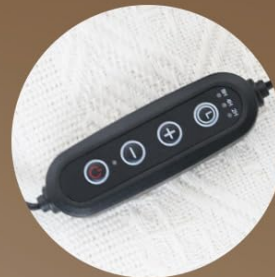
Timing Dimming Controller