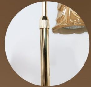
Metal Lamp Pole