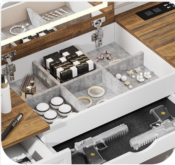
9-compartment Storage Space