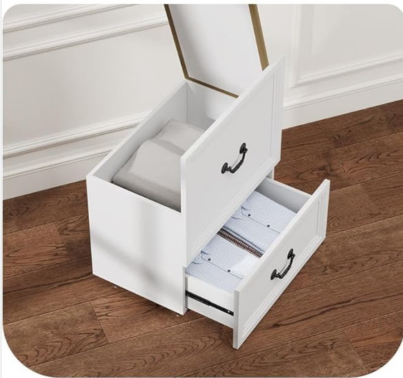
Stool with Hidden Storage Space and drawers