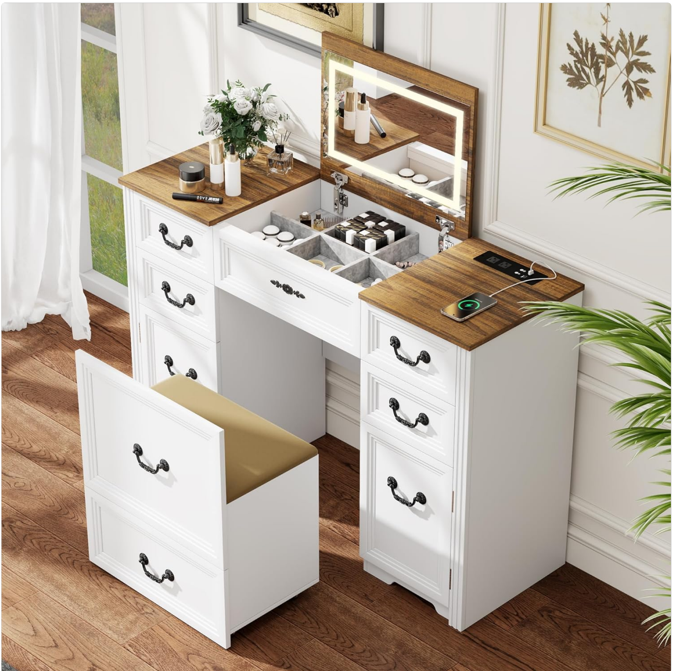
Figure 1: An overview of the HWB Farmhouse 3-in-1 Vanity Desk, showcasing its primary configuration as a makeup vanity with the mirror flipped up and the accompanying stool.