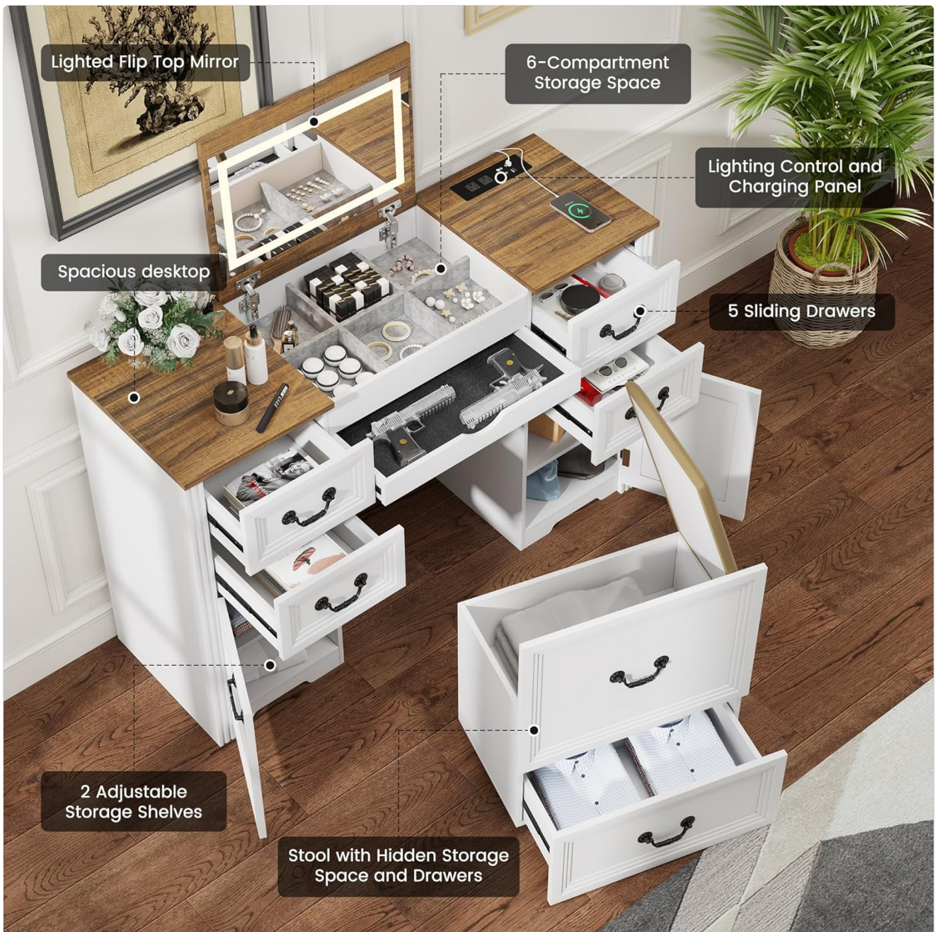
Figure 3: This image highlights key features of the vanity desk, including the lighted flip-top mirror, 6-compartment storage, lighting control and charging panel, 5 sliding drawers, 2 adjustable storage shelves, and the stool with hidden storage.