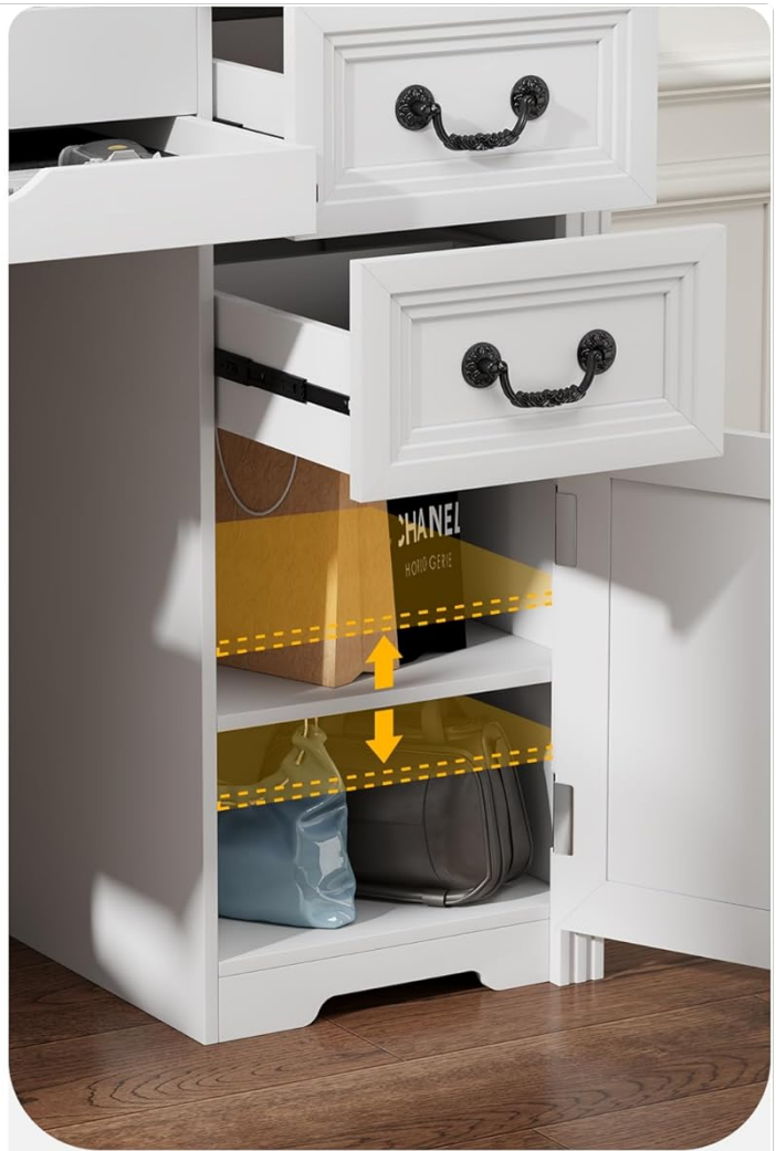
Adjustable Storage shelves

The boards in the shelves can be adjusted in height and can be used to place items of different heights.