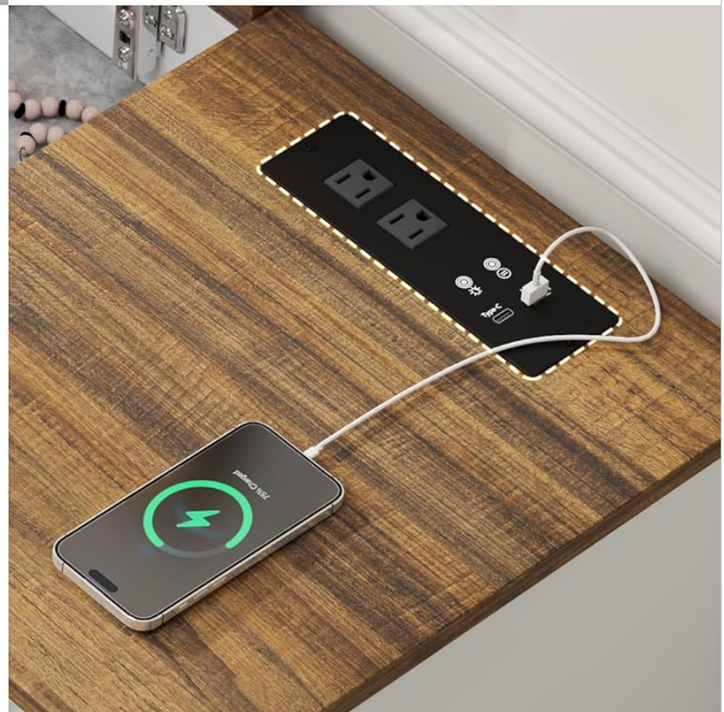
Figure 7: A detailed view of the desk's thick table top, emphasizing the integrated charging station with a phone connected, and the overall sturdy construction.