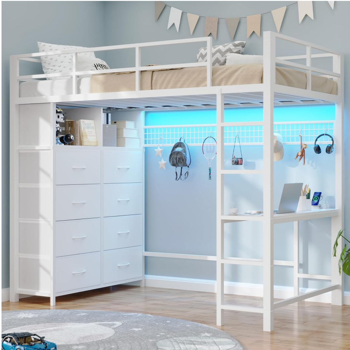
Overall view of the BTHFST Twin Loft Bed, showcasing the elevated bed, integrated desk, and storage dresser.

This loft bed includes a practical L-shaped desk and an integrated storage unit with 8 fabric drawers and open shelves.