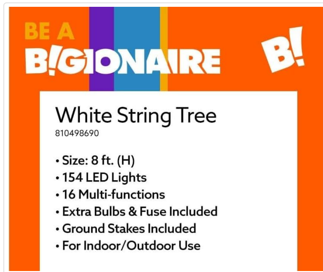
Image 2: Detail of product features including size, number of lights, multi-functions, and included accessories.