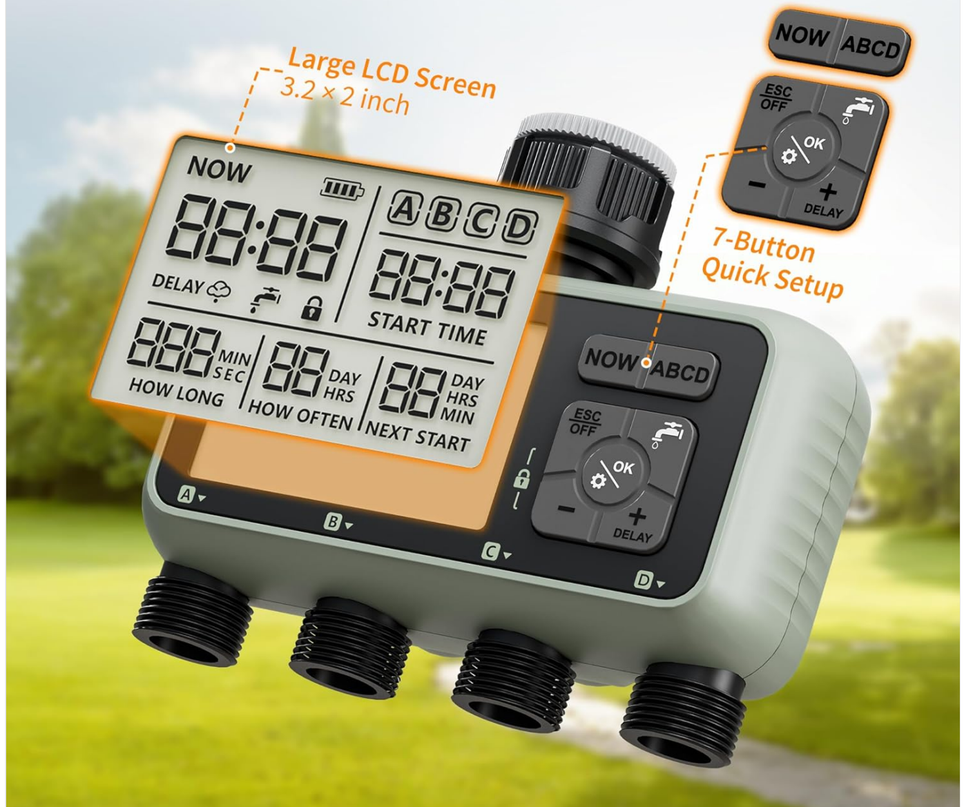
Figure 7: Display showing the Rain Delay feature, indicating that the next watering schedule will be skipped. This feature aids in water conservation and allows for postponed schedules.