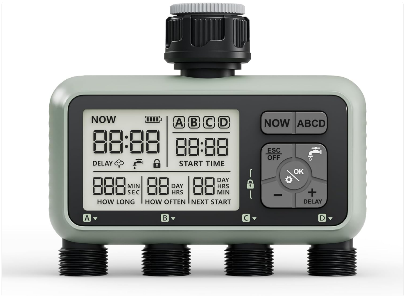
Figure 1: Front view of the Diivoo 4 Zone Sprinkler Timer, showing the large LCD display, control buttons, and four hose outlets.