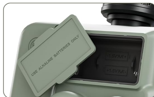
2 × AA Batteries (Not Included)