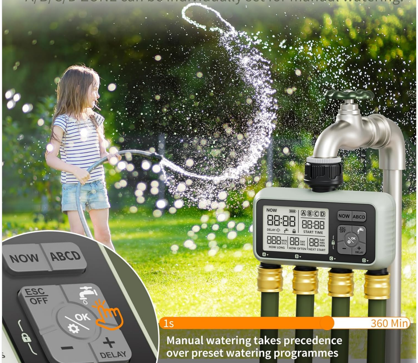
Figure 5: Display showing options for setting Start Time, Watering Duration (1s to 360min), and Watering Frequency (Every 1H-23H or Every 1-15 Days).

A/B/C/D ZONE can be individually set for manual watering.