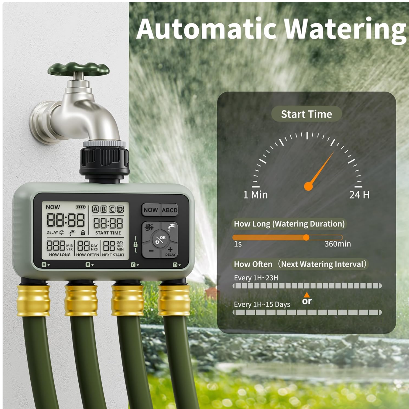
Figure 3: Close-up of the large LCD screen and the 7-button quick setup panel.

The large LCD display shows various information including the current time, battery level, active zone indicators (A, B, C, D), start time, watering duration, watering frequency, and next start time. The control panel features buttons for navigation and setting adjustments: