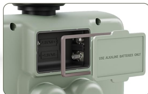
Battery cover with seal ring isolated moisture