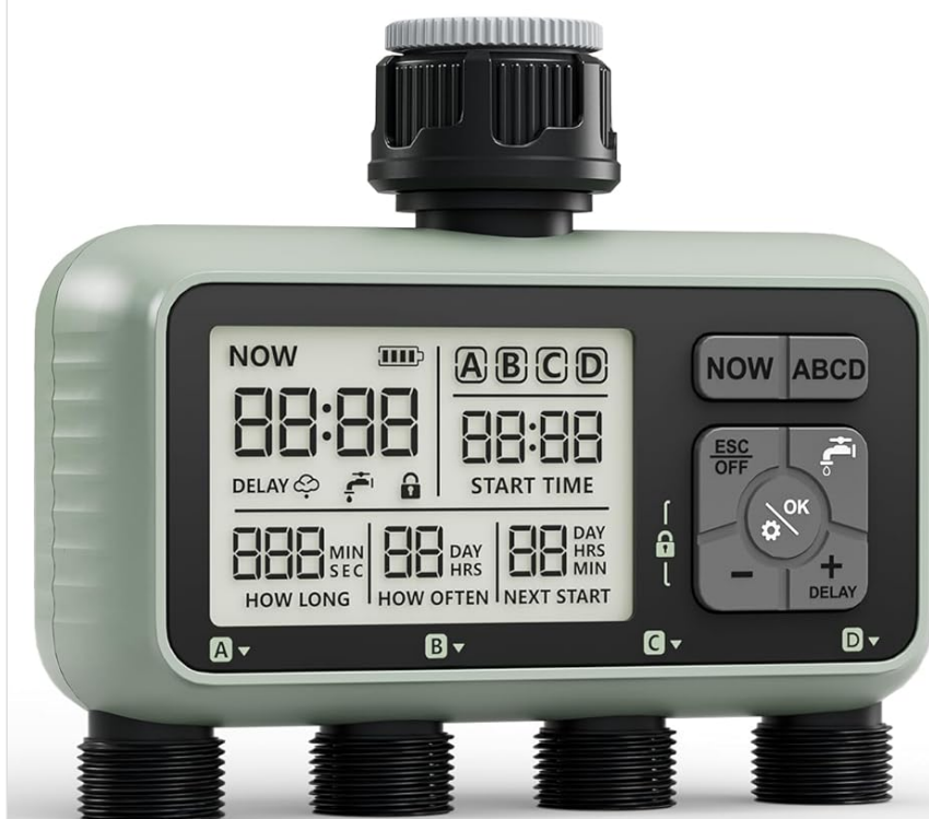
Figure 6: Illustration of manual watering in progress, showing the ability to set individual watering times for each zone from 1 second to 360 minutes.