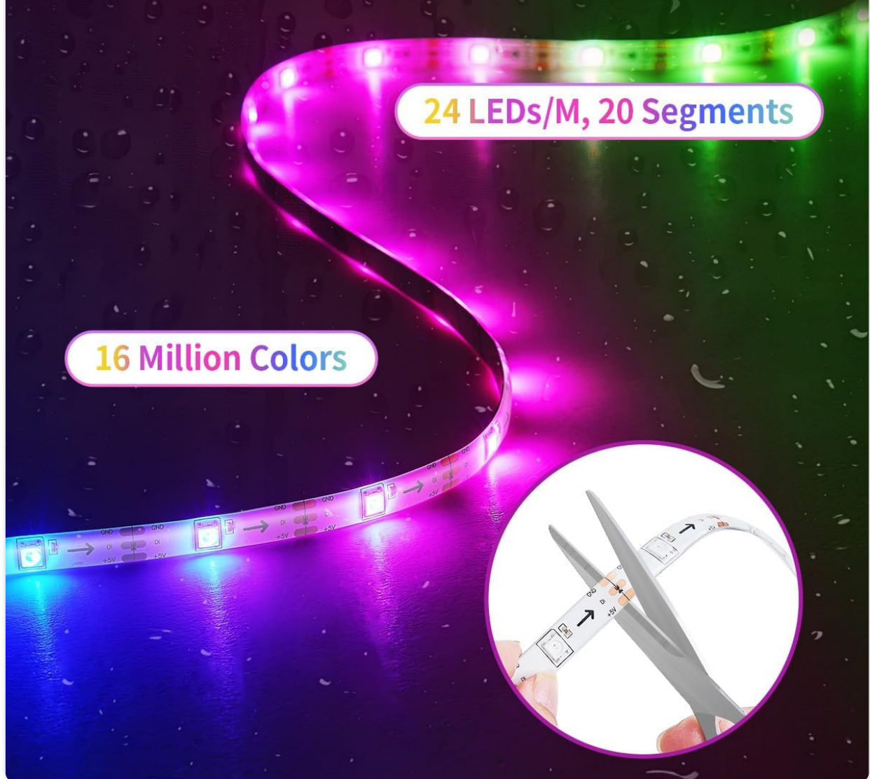
Image: The flexible LED strip with visible cuttable marks and a protective coating.