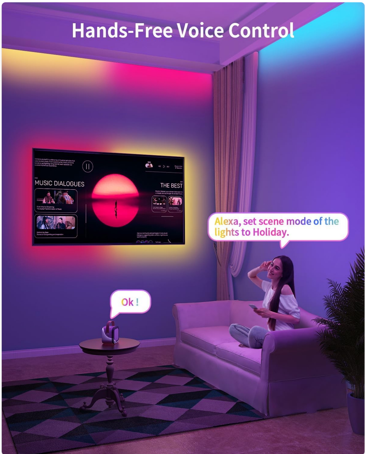
Image: A user interacting with a smart speaker to control the LED lights via voice commands.