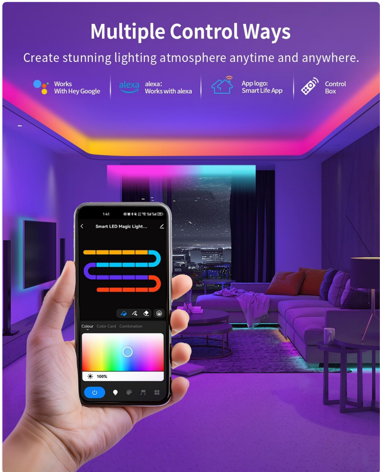
Image: The Smart Life app displaying multiple control options for the LED strip lights.

Your browser does not support the video tag.