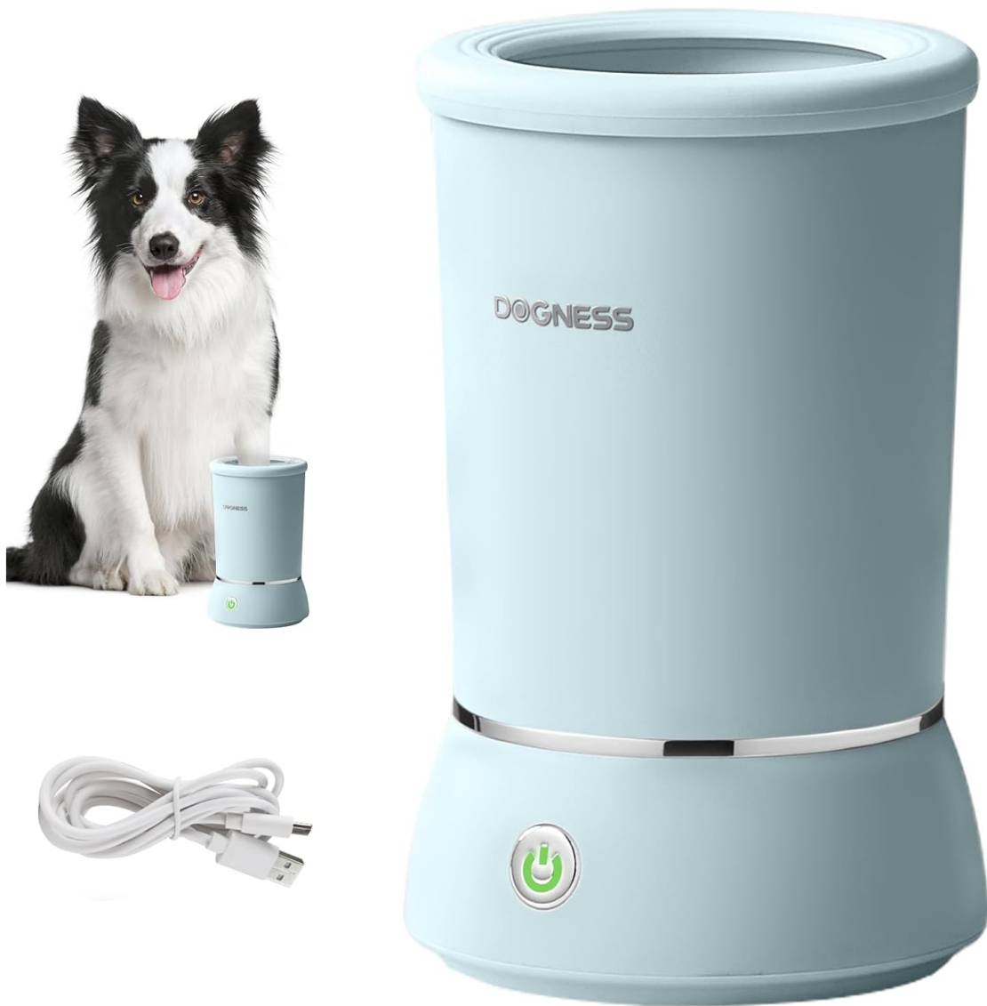
Image: The DOGNESS W01 Automatic Dog Paw Cleaner in light blue, showcasing its compact design and internal silicone bristles.