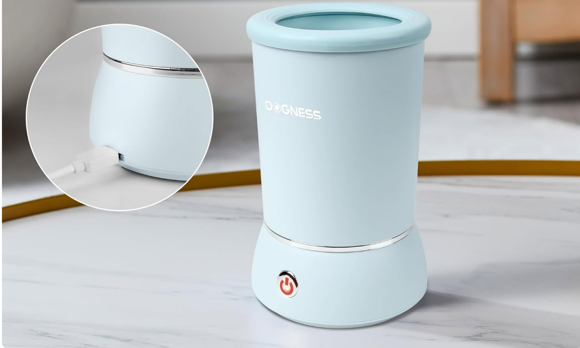
Image: Close-up of the DOGNESS W01 Automatic Dog Paw Cleaner's base, showing the USB charging port and power button.