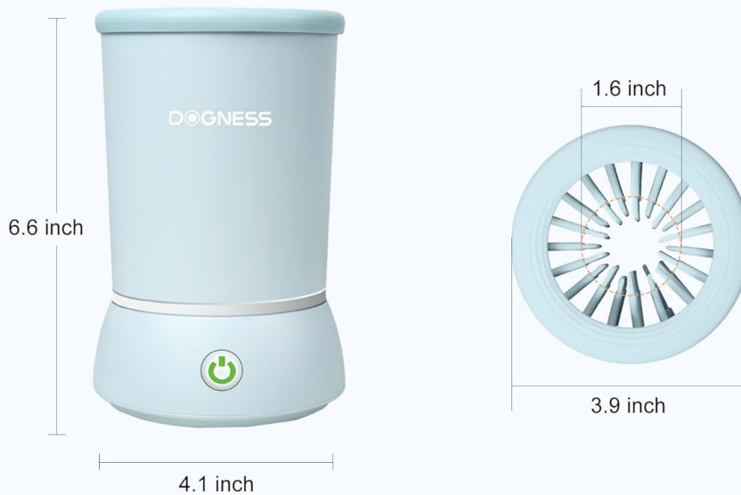
Image: Visual representation of the DOGNESS W01 Automatic Dog Paw Cleaner's dimensions, showing height, width, and paw opening diameter.