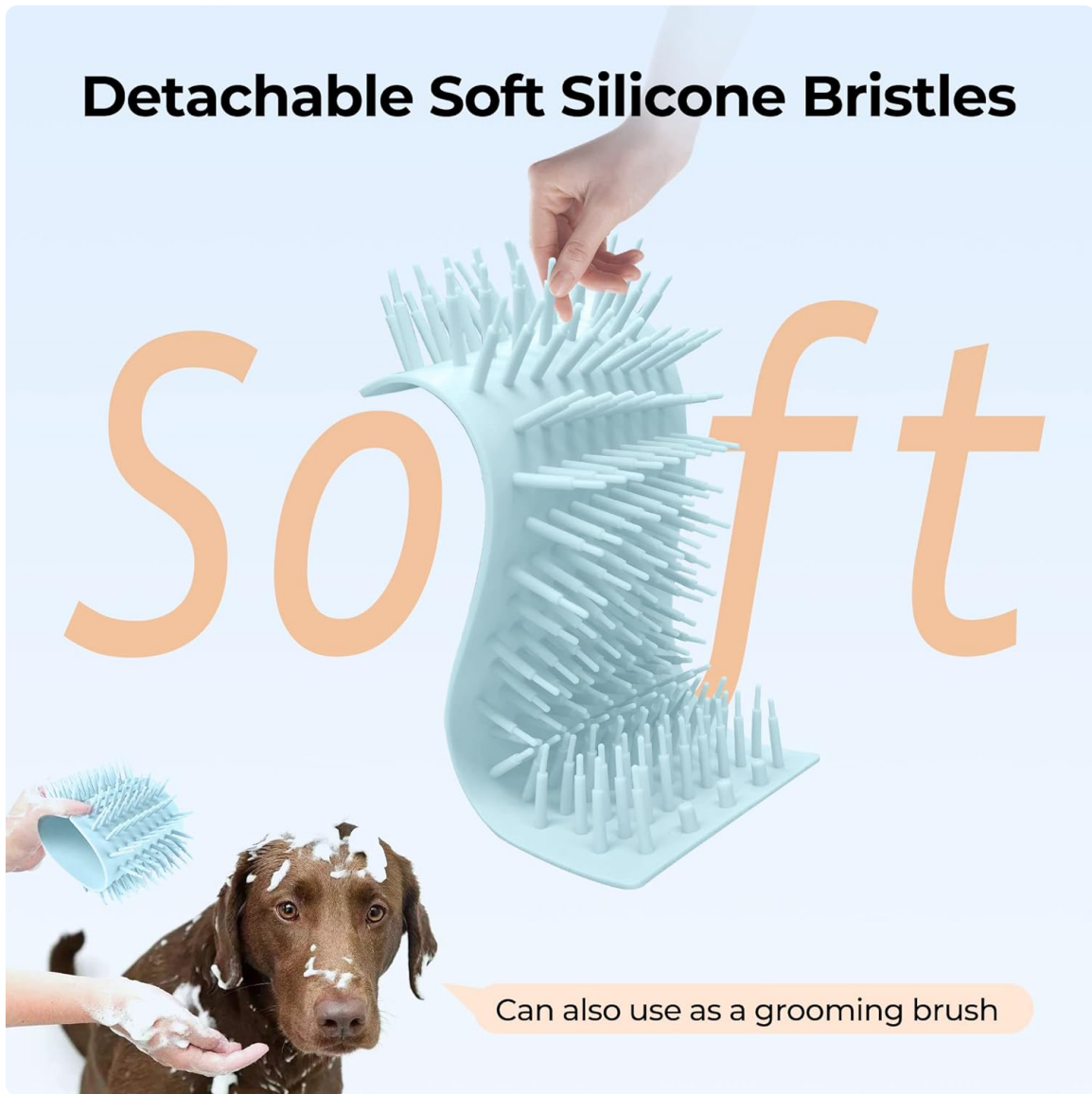
Image: The detachable soft silicone bristles of the DOGNESS W01 Automatic Dog Paw Cleaner, highlighting their flexibility and dual use as a grooming brush.