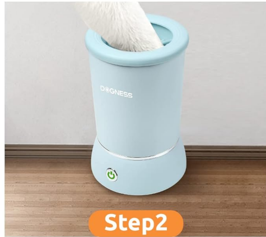
Step2 Spin Paw Cleaner