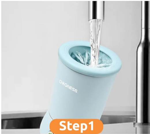
Step1 Pour the Water