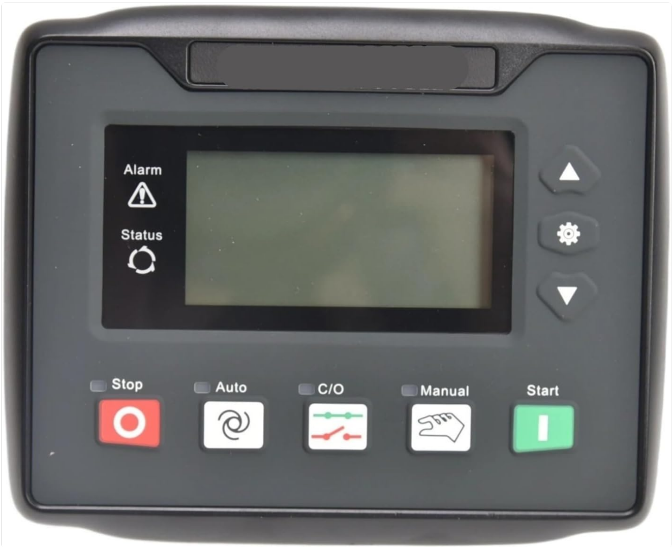
Figure 1: Front view of the HGM4020N Generator Smart Controller.