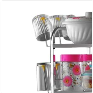
Figure 6: Detail of the glass holder.