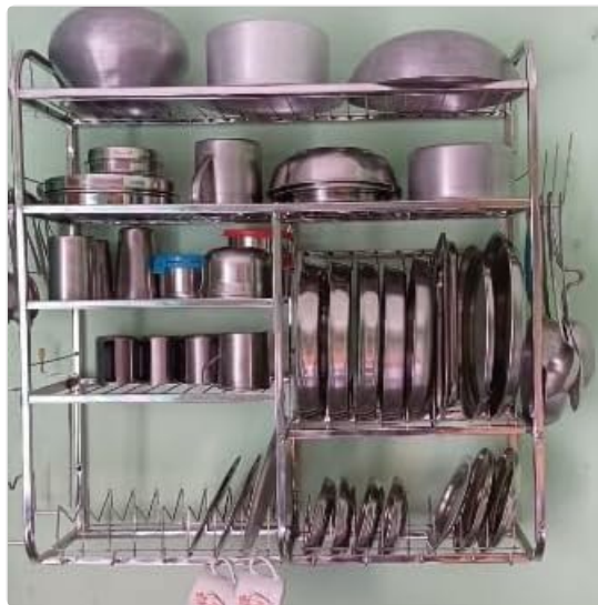
Figure 1: The DEMIQON Stainless Steel Kitchen Dish Rack, showcasing its capacity for various kitchen items like plates, bowls, and pots.

Thank you for choosing the DEMIQON Stainless Steel Kitchen Dish Rack. This multi-functional, wall-mounted rack is designed to provide an efficient and organized solution for drying and storing your kitchenware. Crafted from 100% non-magnetic stainless steel with a five-layer decorative rust-proof plating, it offers durability and a modern aesthetic. This manual provides essential information for proper setup, operation, and maintenance to ensure long-lasting performance.