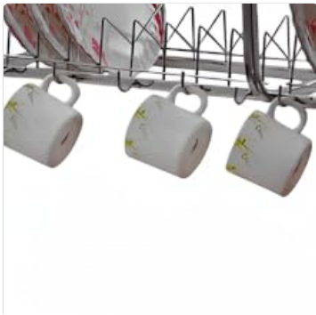
Figure 7: Detail of the cup holder hooks.