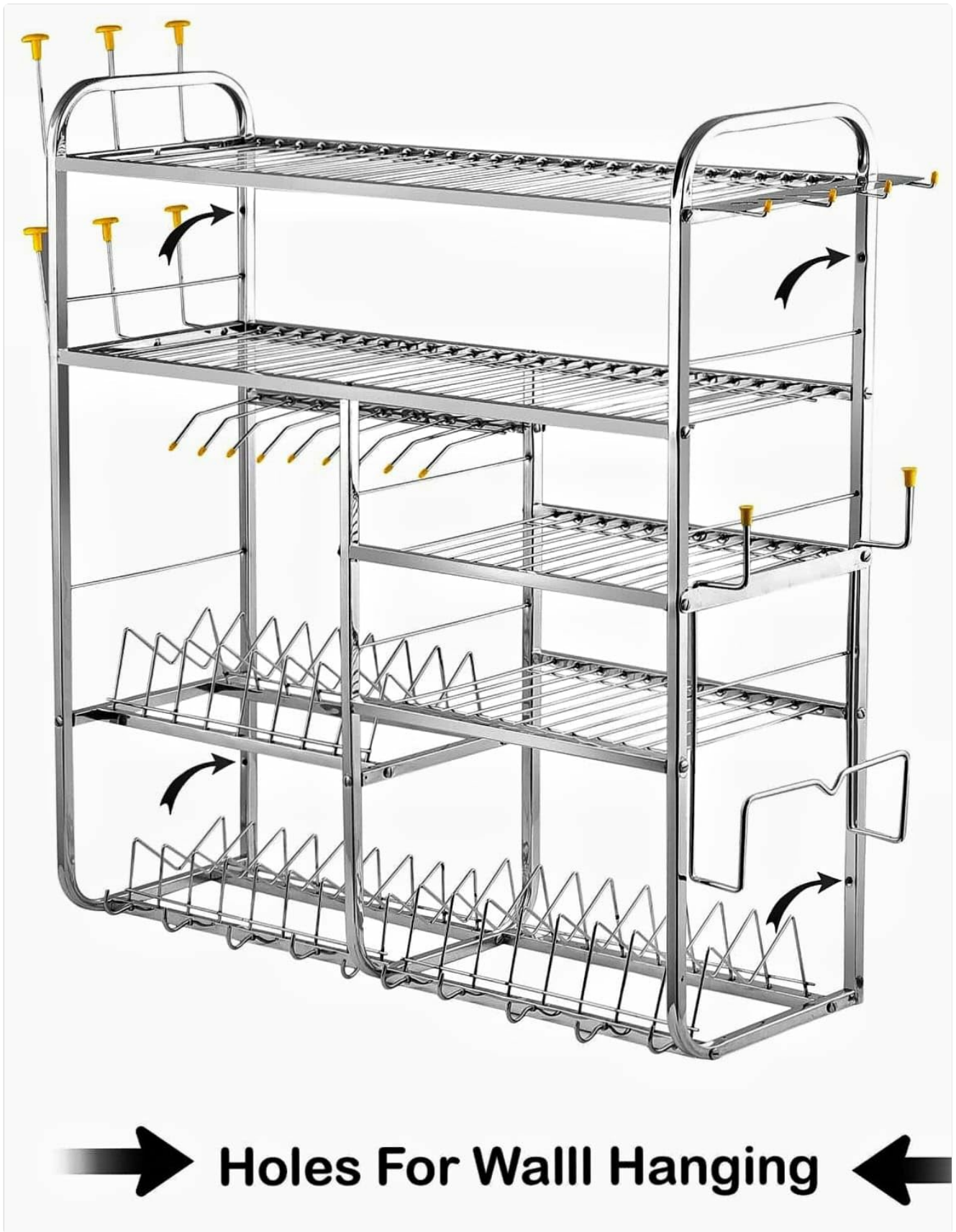
Figure 2: Illustration of the dish rack highlighting the designated holes for wall mounting.