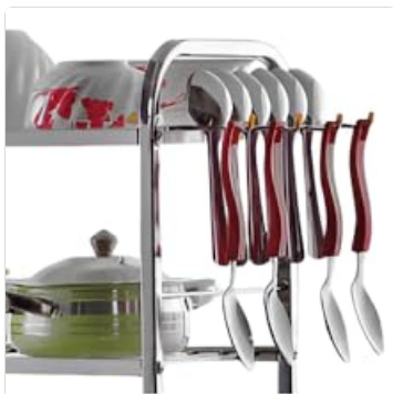
Figure 4: Detail of the integrated spoon holder.