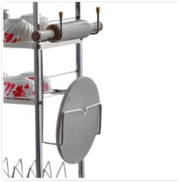
Figure 5: Detail of the chakla belan (rolling pin and board) holder.