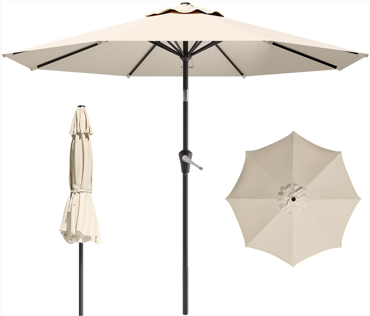
Image: The AreShark 9 FT Patio Umbrella shown fully open and also in its folded state, highlighting its overall design and the main pole.