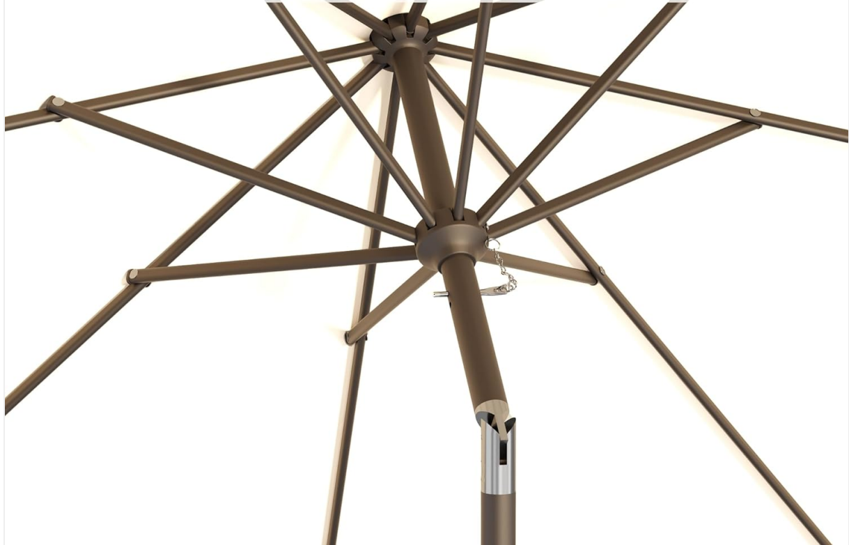
Image: A detailed view of the umbrella's internal structure, showcasing the 8 sturdy ribs that provide support and wind resistance.