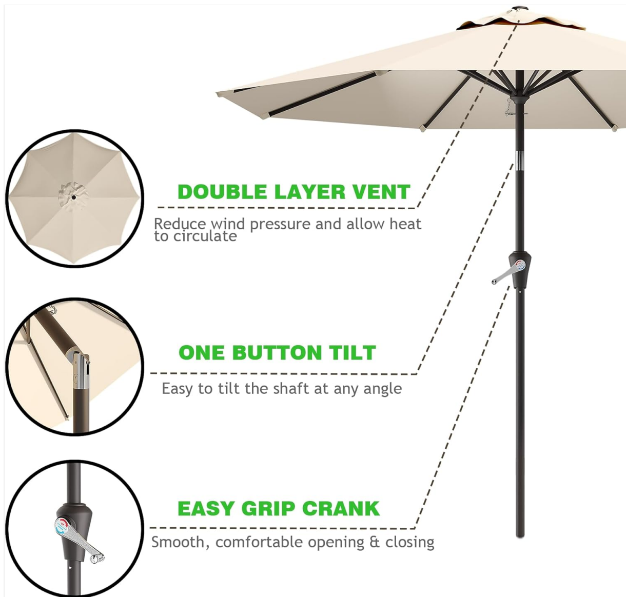
Image: A diagram illustrating the key operational features: the double-layer vent for air circulation, the push-button for tilting, and the easy-grip crank for opening and closing the canopy.