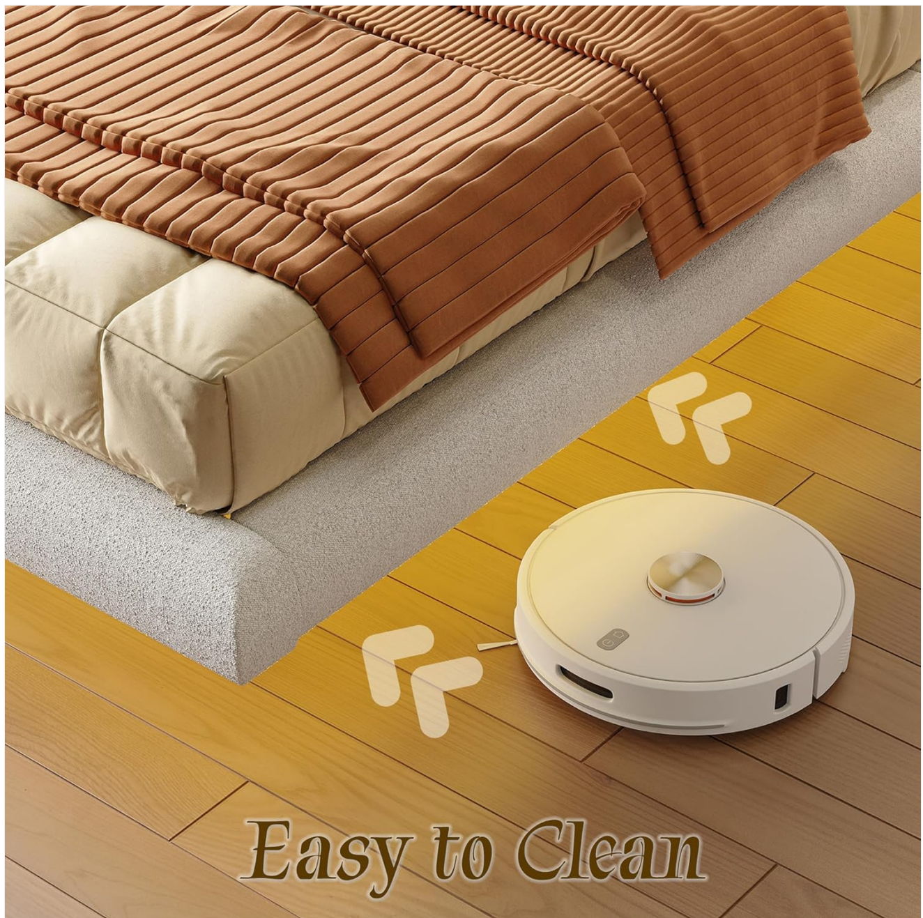
Image: A robot vacuum cleaner operating beneath the LIKIMIO floating bed frame, illustrating the convenient clearance for automated cleaning and maintenance of the floor space.