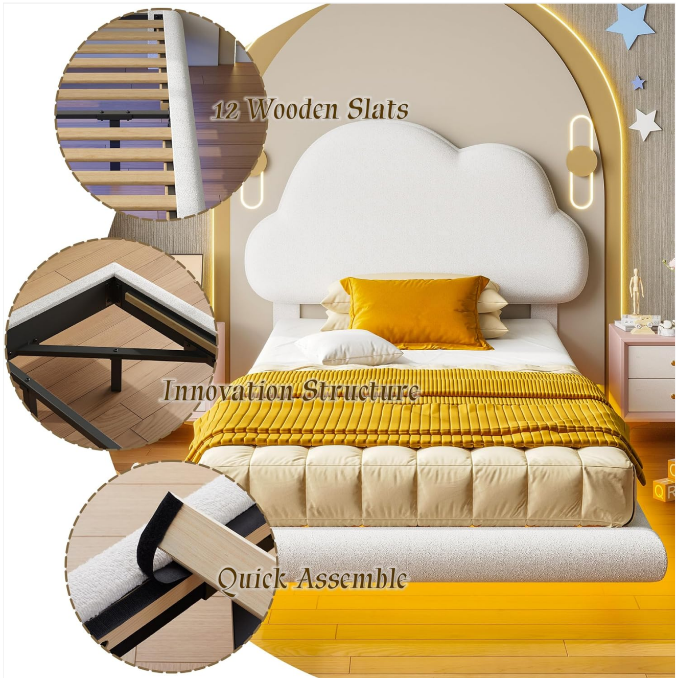
Image: Detailed view of the bed frame's internal structure, highlighting the 12 wooden slats, the innovative metal support structure, and a strap for quick assembly. This design ensures stability and ease of setup.