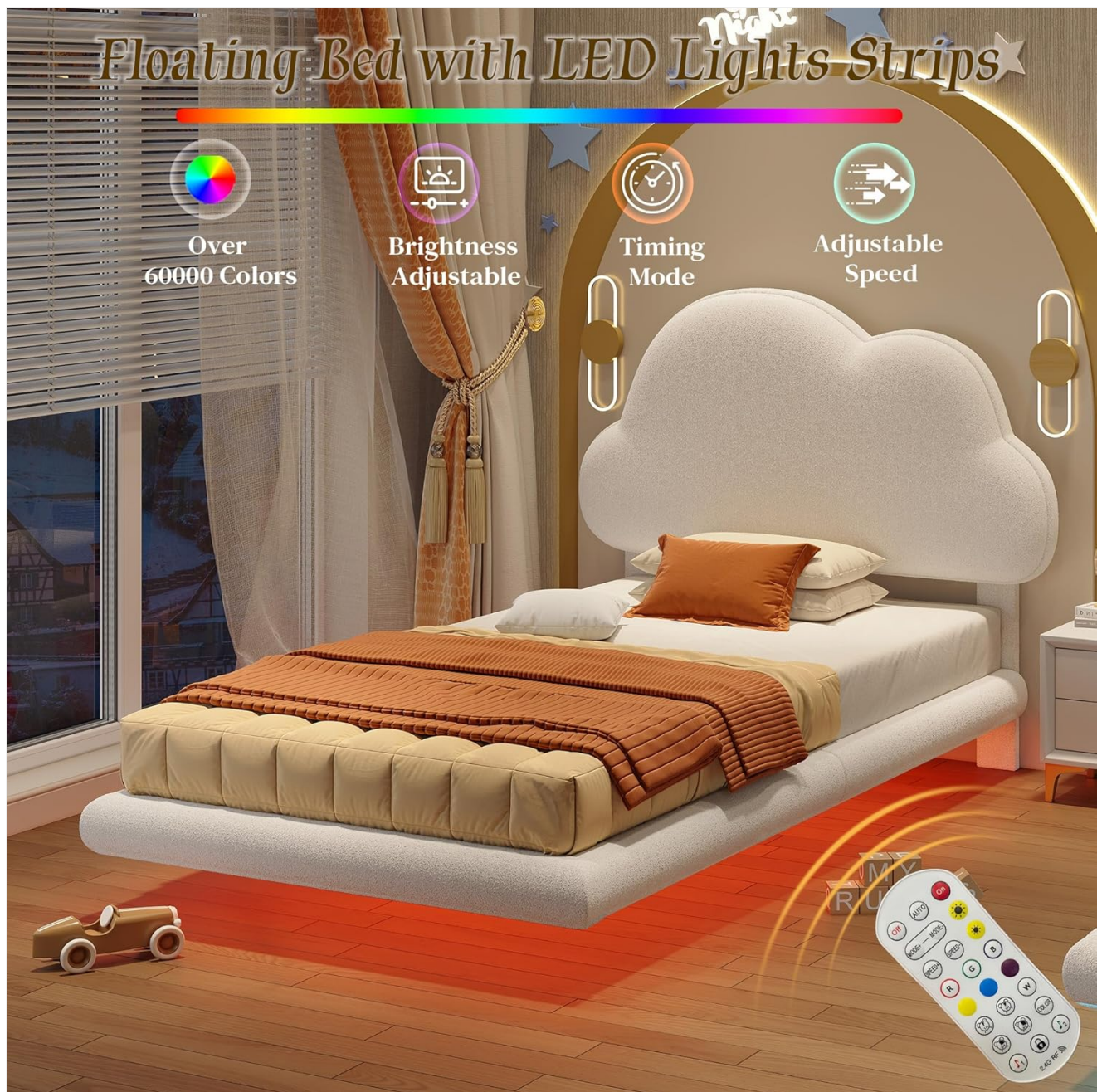
Image: The LIKIMIO Twin Bed Frame with its LED light strips activated, casting a colorful glow beneath. The image also displays icons representing various functions of the LED lights, such as color selection, brightness adjustment, timing mode, and adjustable speed, along with the remote control.