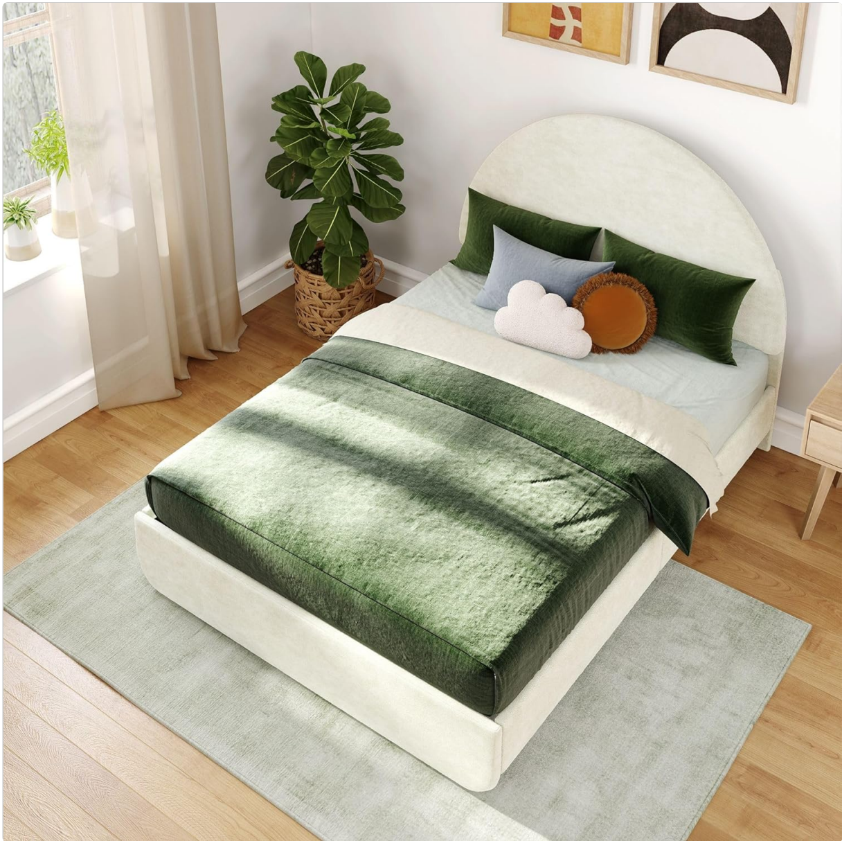
Figure 3.3: Overhead View of Bed Frame