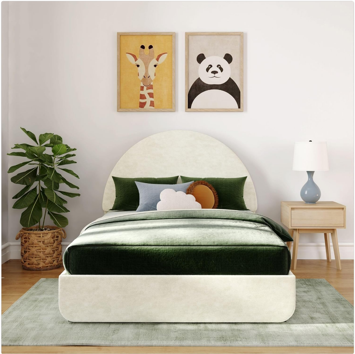
Figure 3.2: Bed Frame in a Room Setting