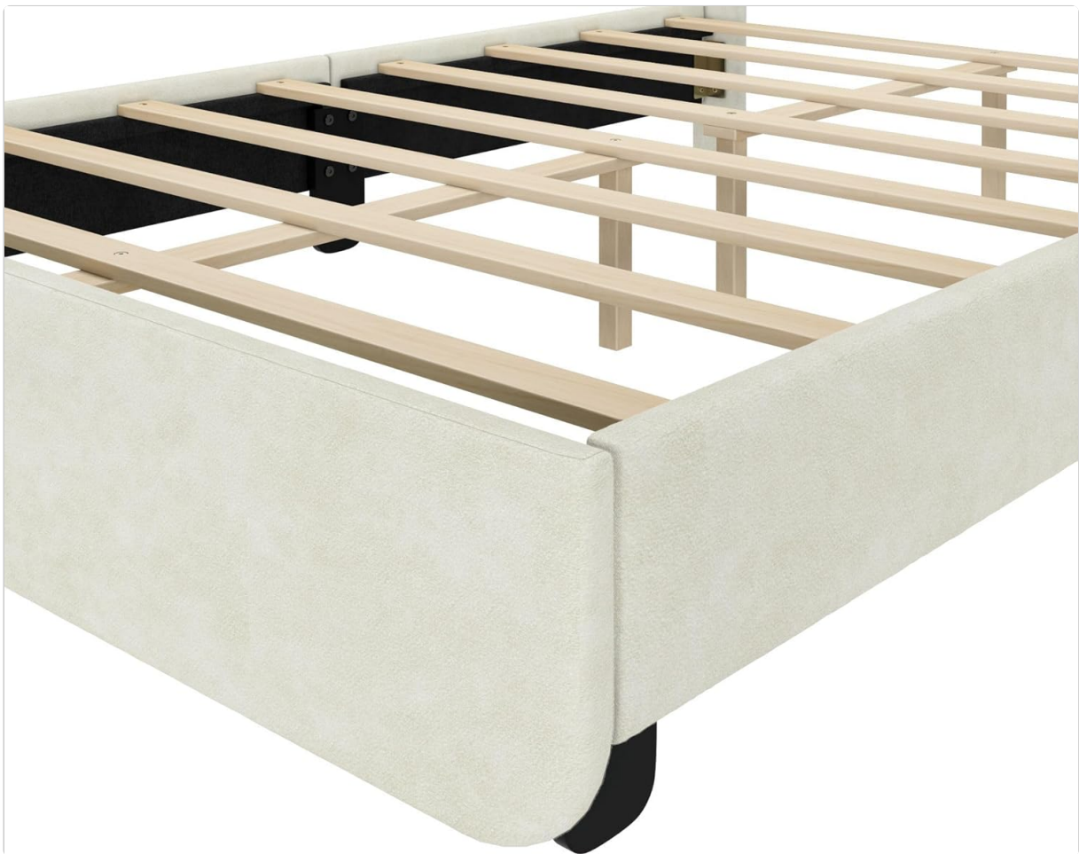
Figure 2.4: Detail of Frame Corner and Slat Support