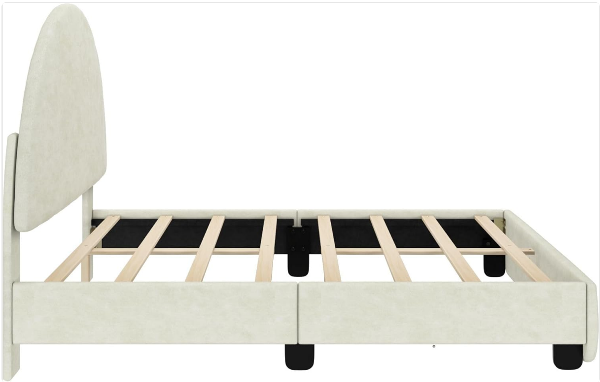
Figure 2.3: Side View of Bed Frame Construction