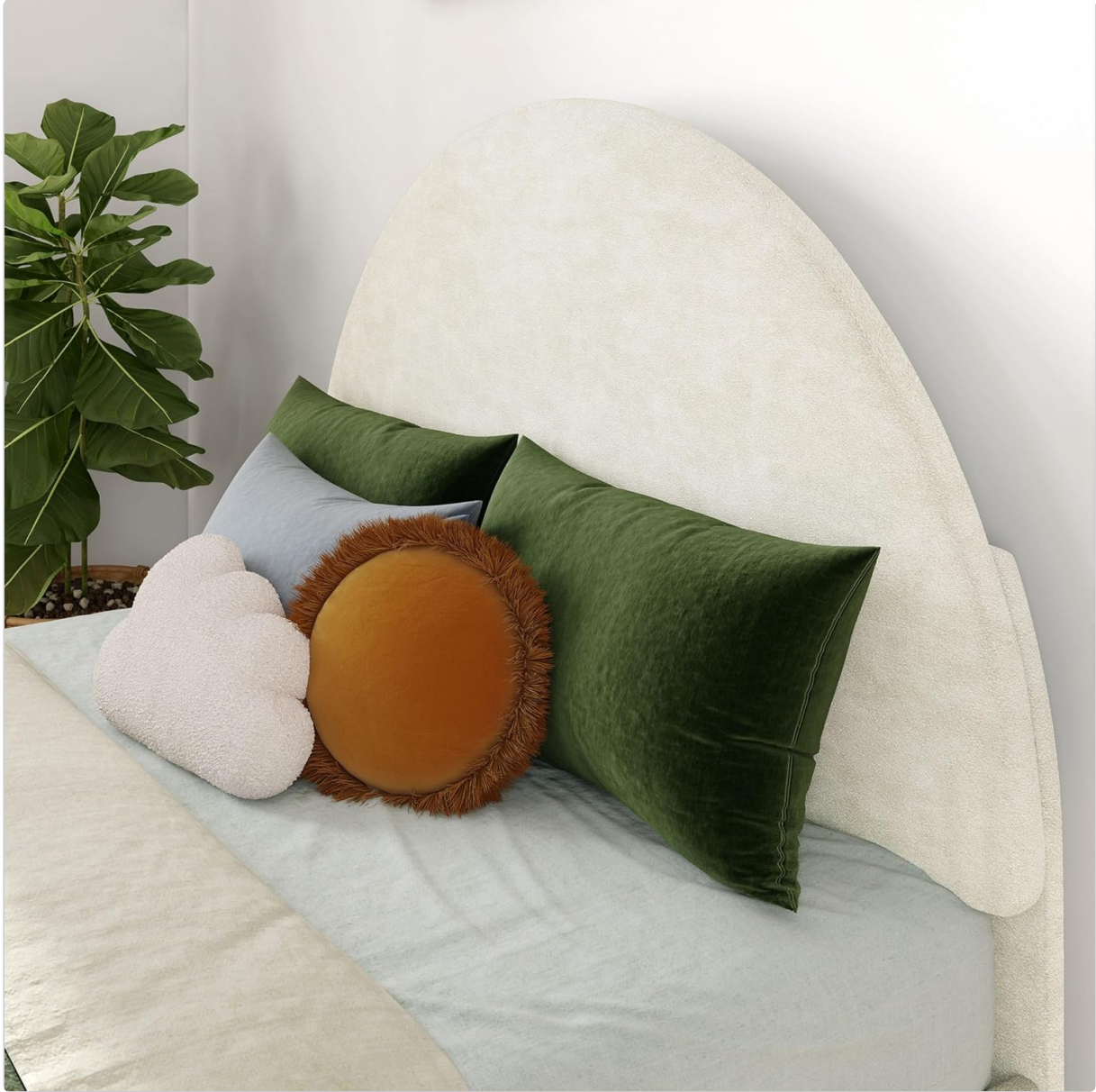
Figure 3.1: Upholstered Arch Headboard Detail

The bed features a chenille upholstered arch headboard, providing a comfortable backrest for reading or relaxing. The cream color offers a versatile aesthetic suitable for various room decors.