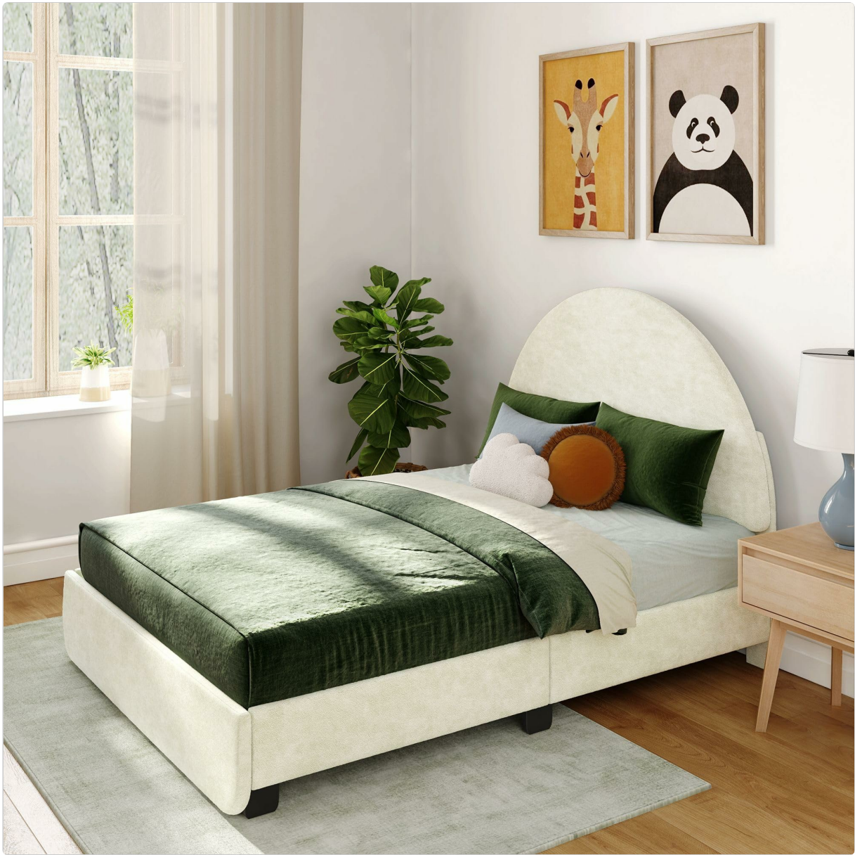
Figure 1.1: Max & Lily Upholstered Full Bed Frame with Arch Headboard (Cream)